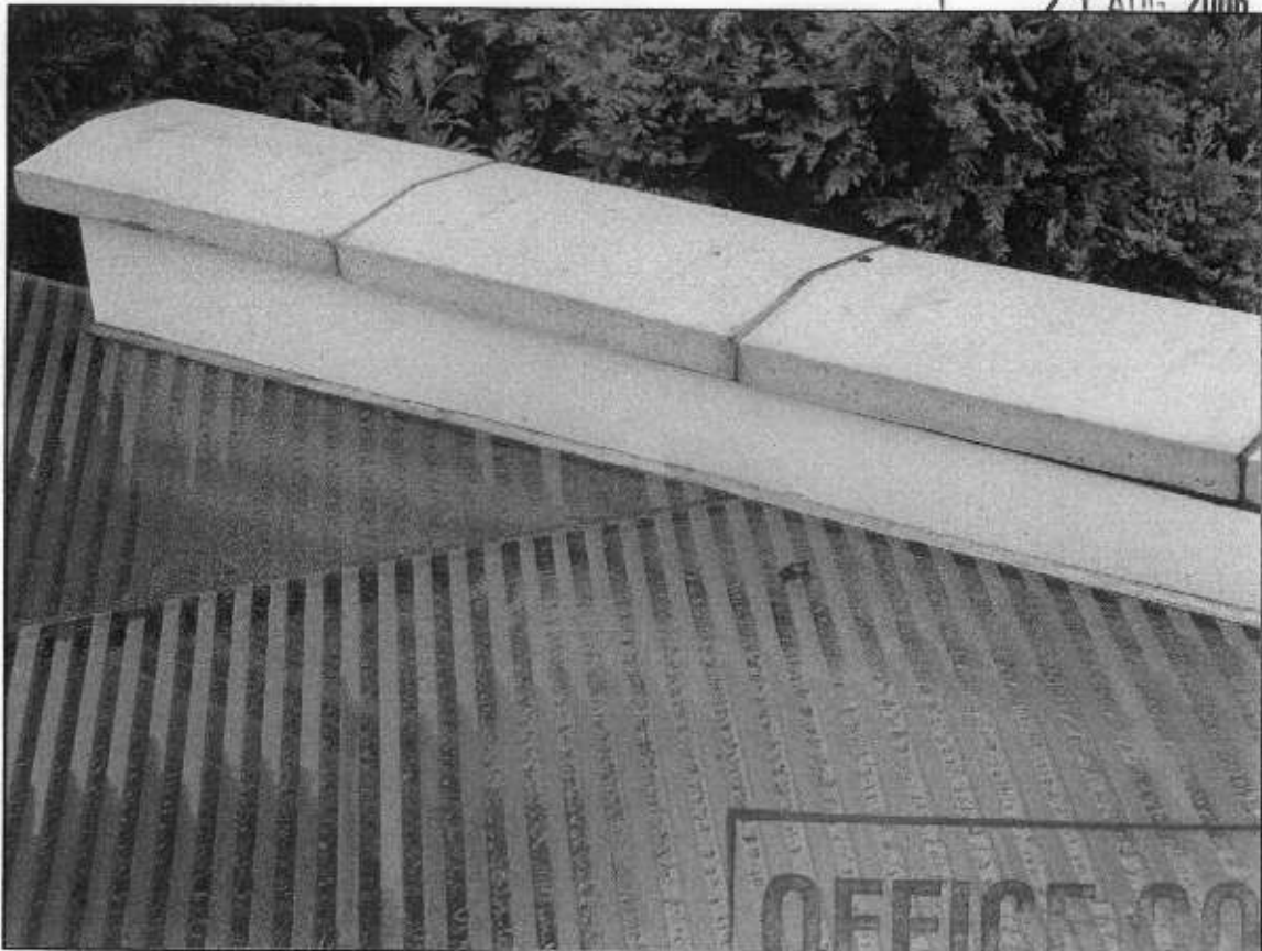
Roof connection to side wall – sealed with silicone