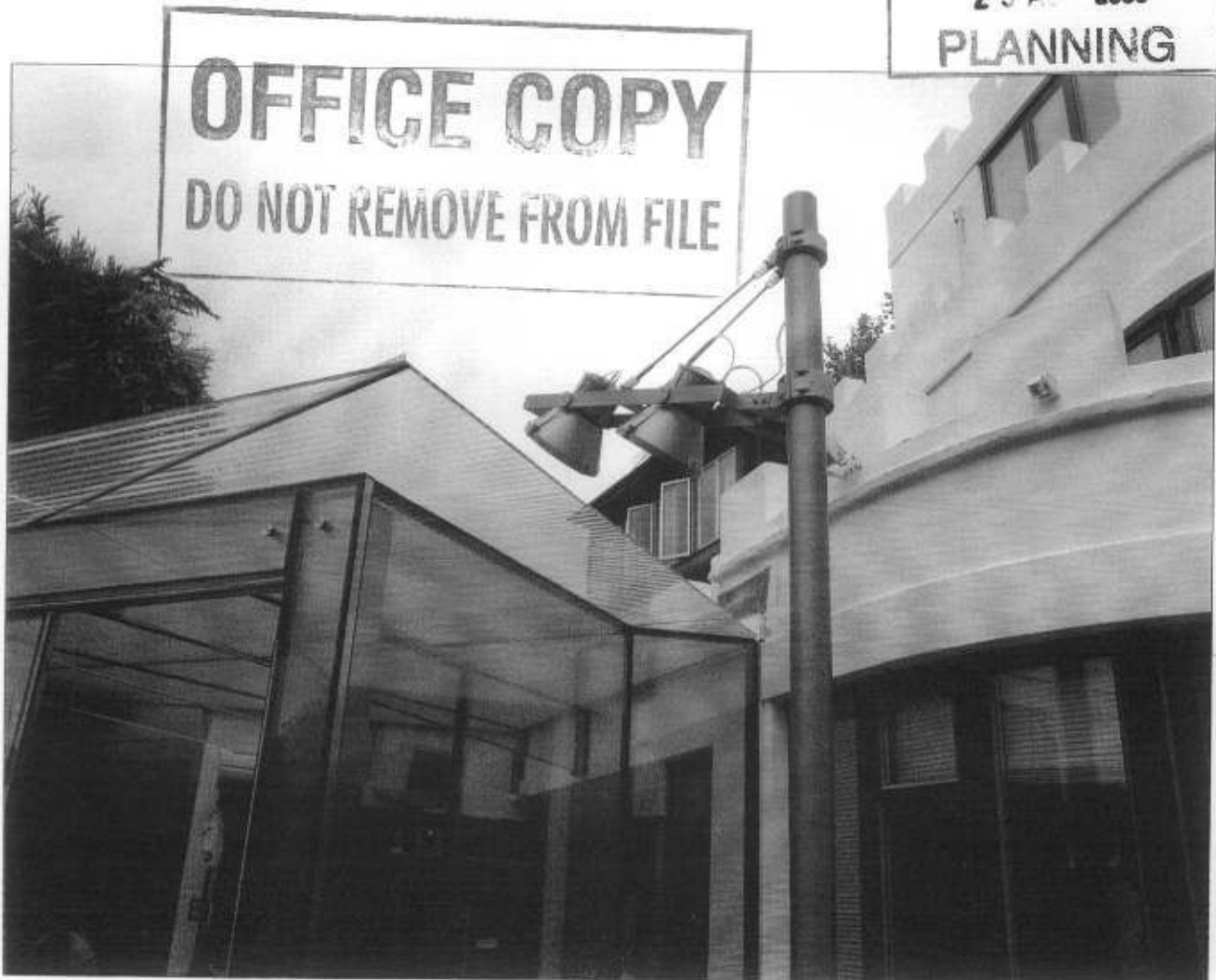
Picture 2. Side view of glass fixed panels in connection with the roof and steel goal post structure