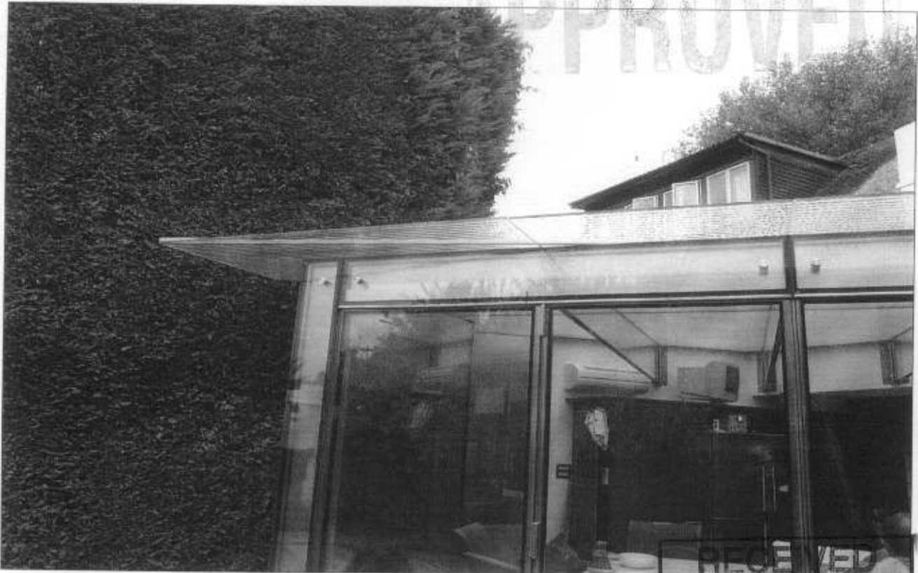
Picture 1. View of the glass doors and roof