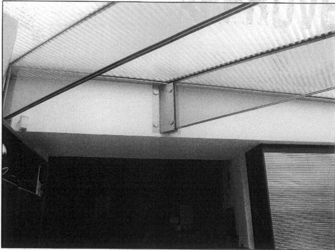
Glass structure connection to wall