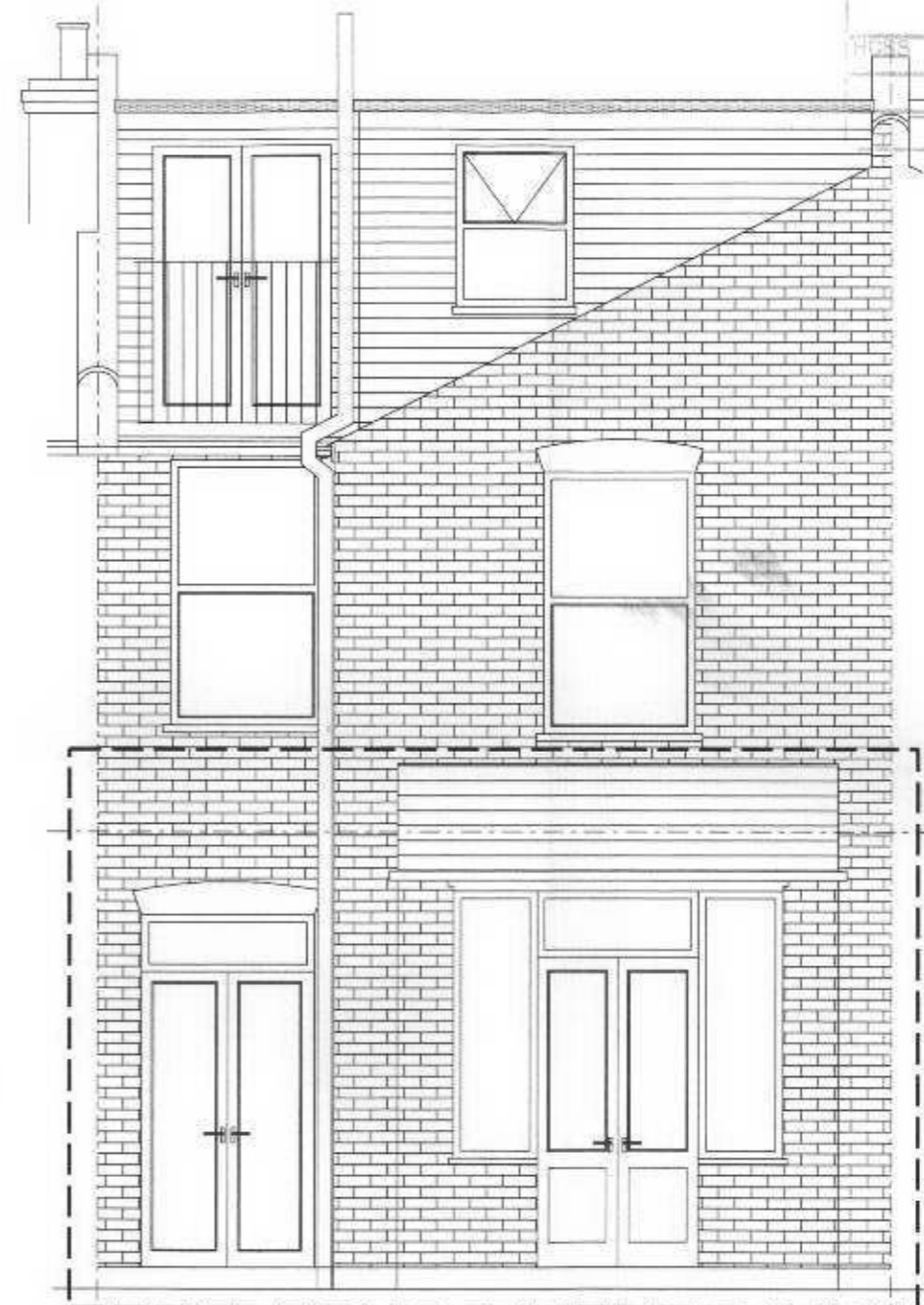
Existing Flank Elevation

Dotted line showing area of proposed works