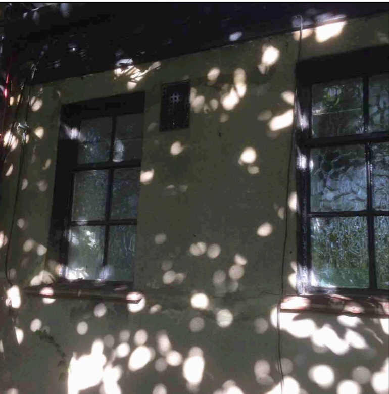
Existing Metal Casement Windows at the Rear Showing Decay