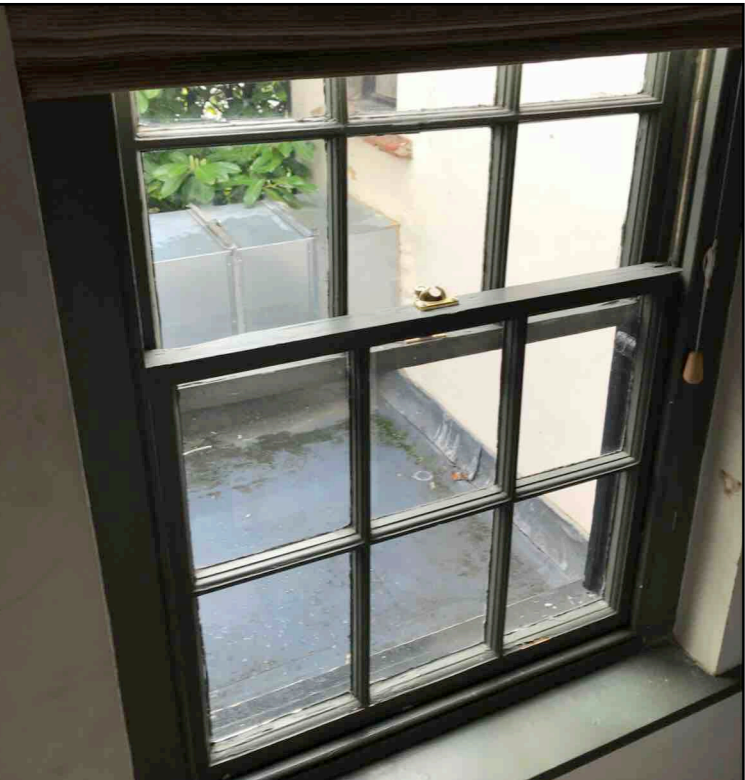
Existing Sash Window at the Rear