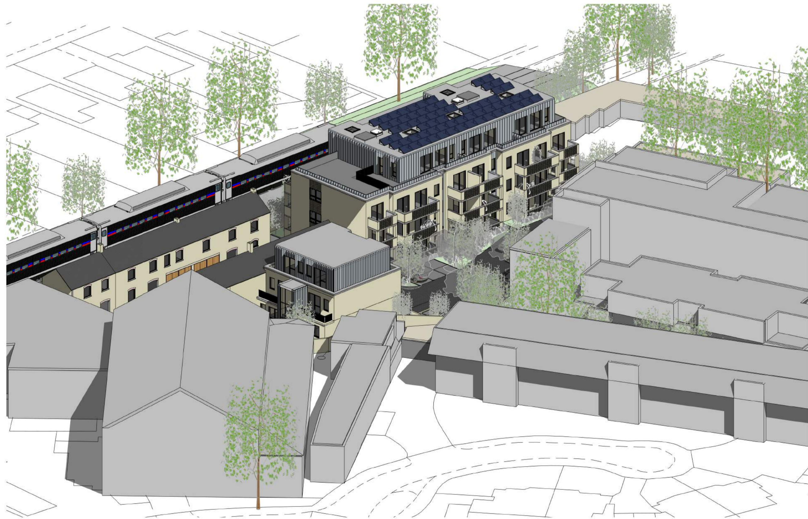
③ 3D - South - Proposed