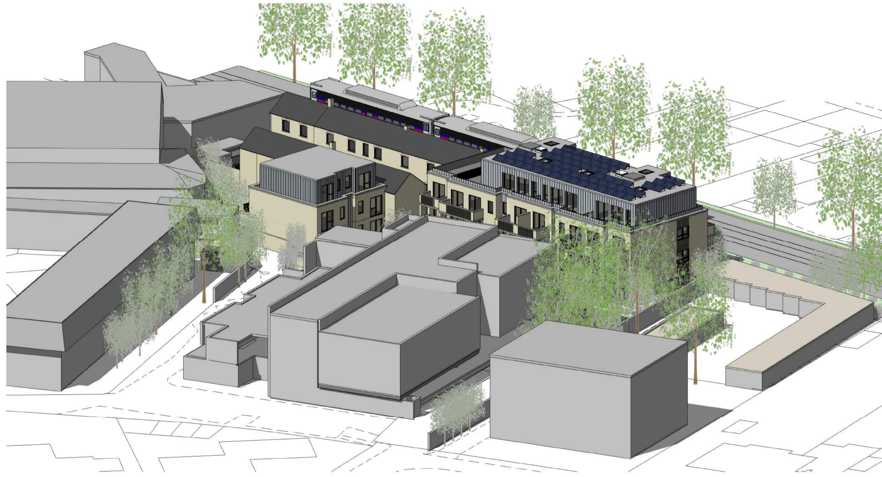
① 3D - East - Proposed