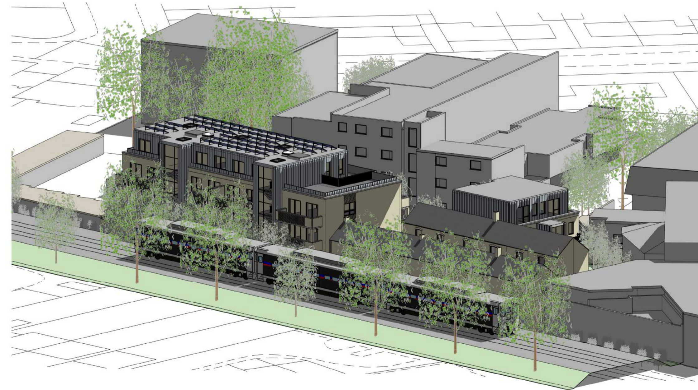
④ 3D - West - Proposed