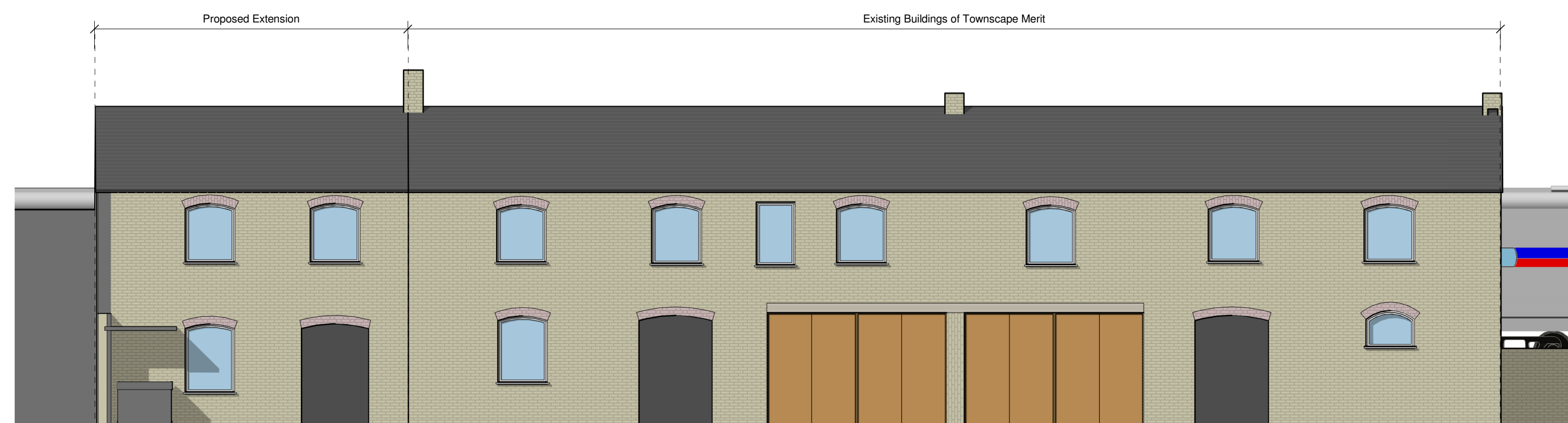
① B1 Commercial Units 1, 2 + 5 - Front Elevation 1 : 100