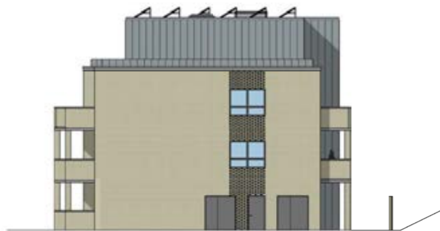
③ North East Elevation 1 : 100