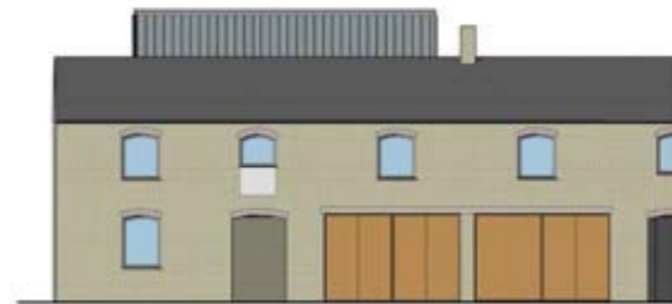
③ Small Block - West Elevation 1 : 100