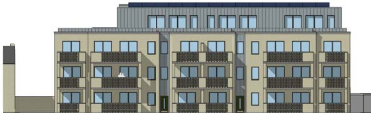
① Front Elevation 1 : 100