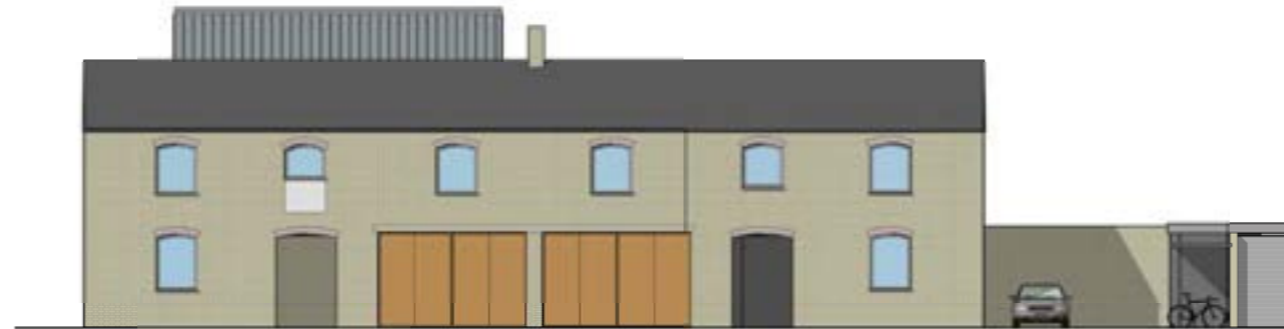
① B1 Commercial Units 3 + 4 - Front Elevation 1 : 100