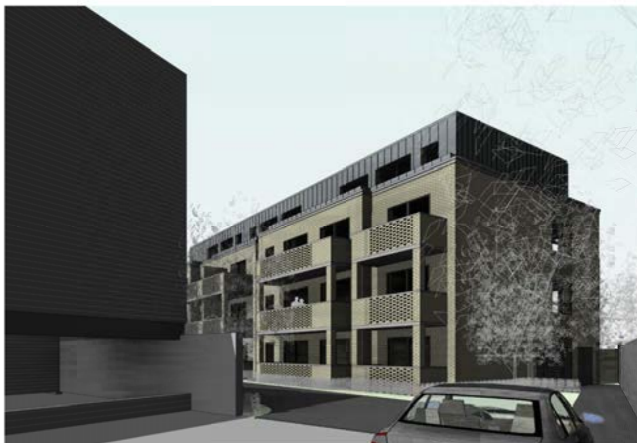
① Perspective 1