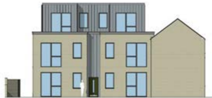
① Small Block - Front Elevation 1 : 100