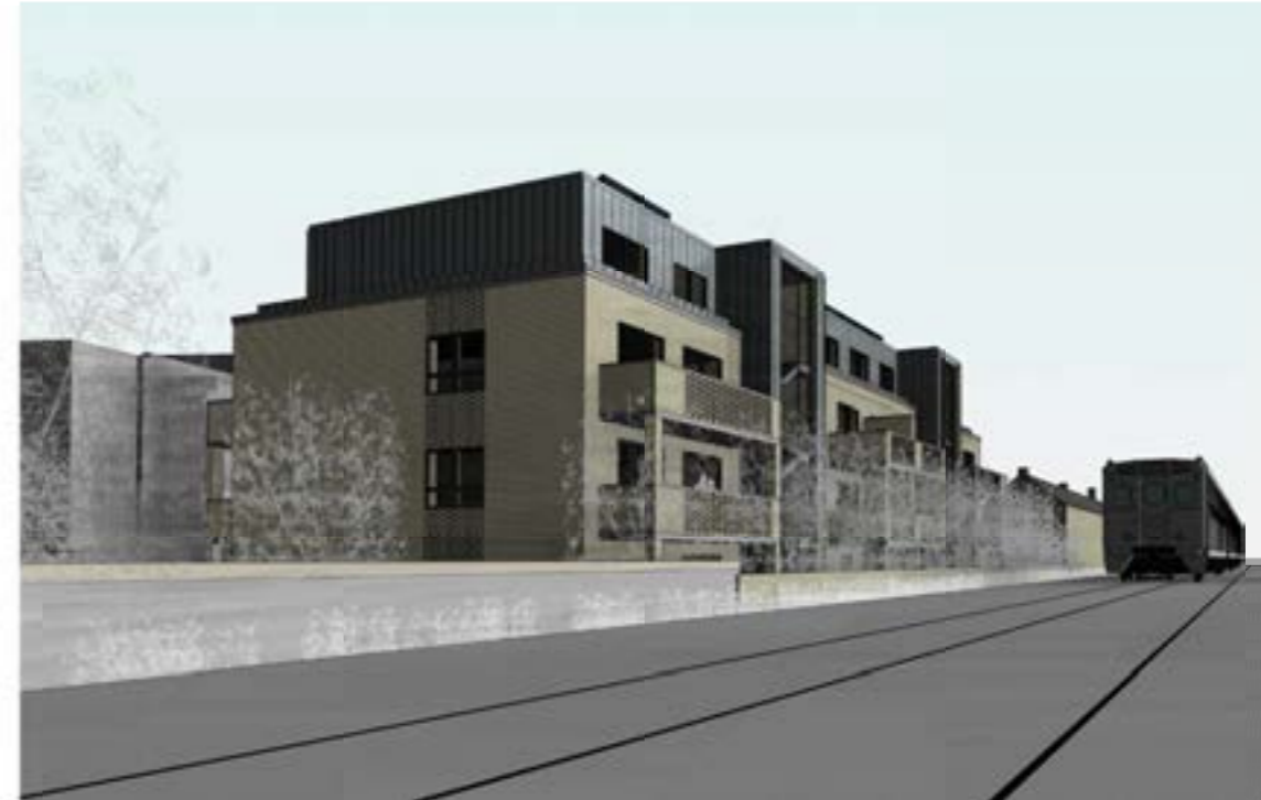
③ Perspective 5