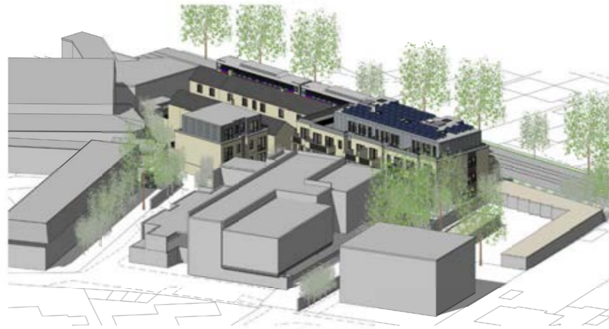
① 3D - East - Proposed