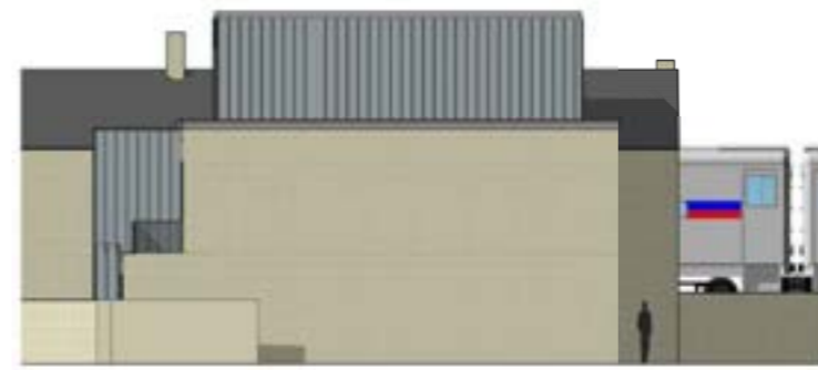
④ Small Block - East Elevation 1 : 100