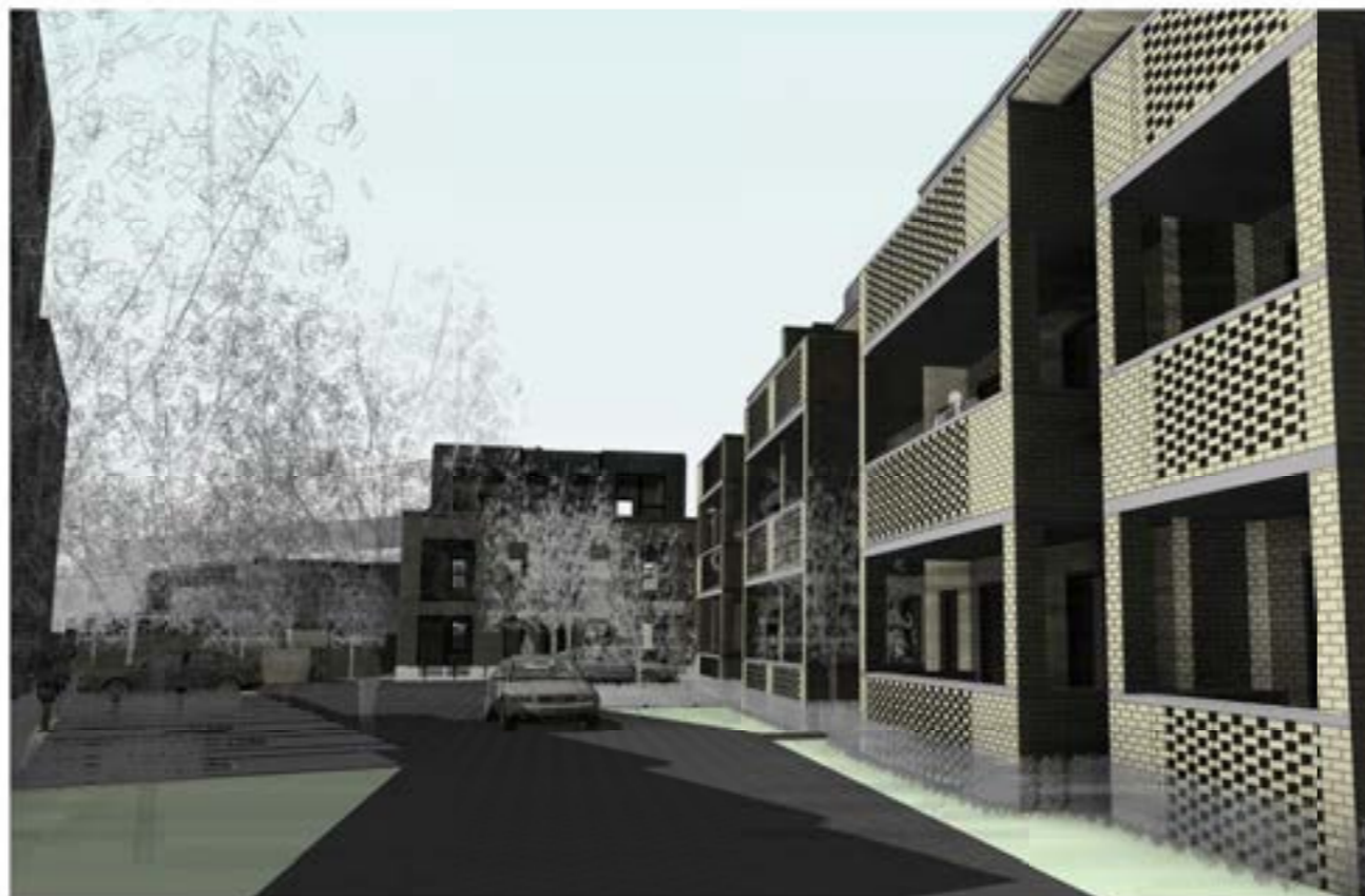
② Perspective 2