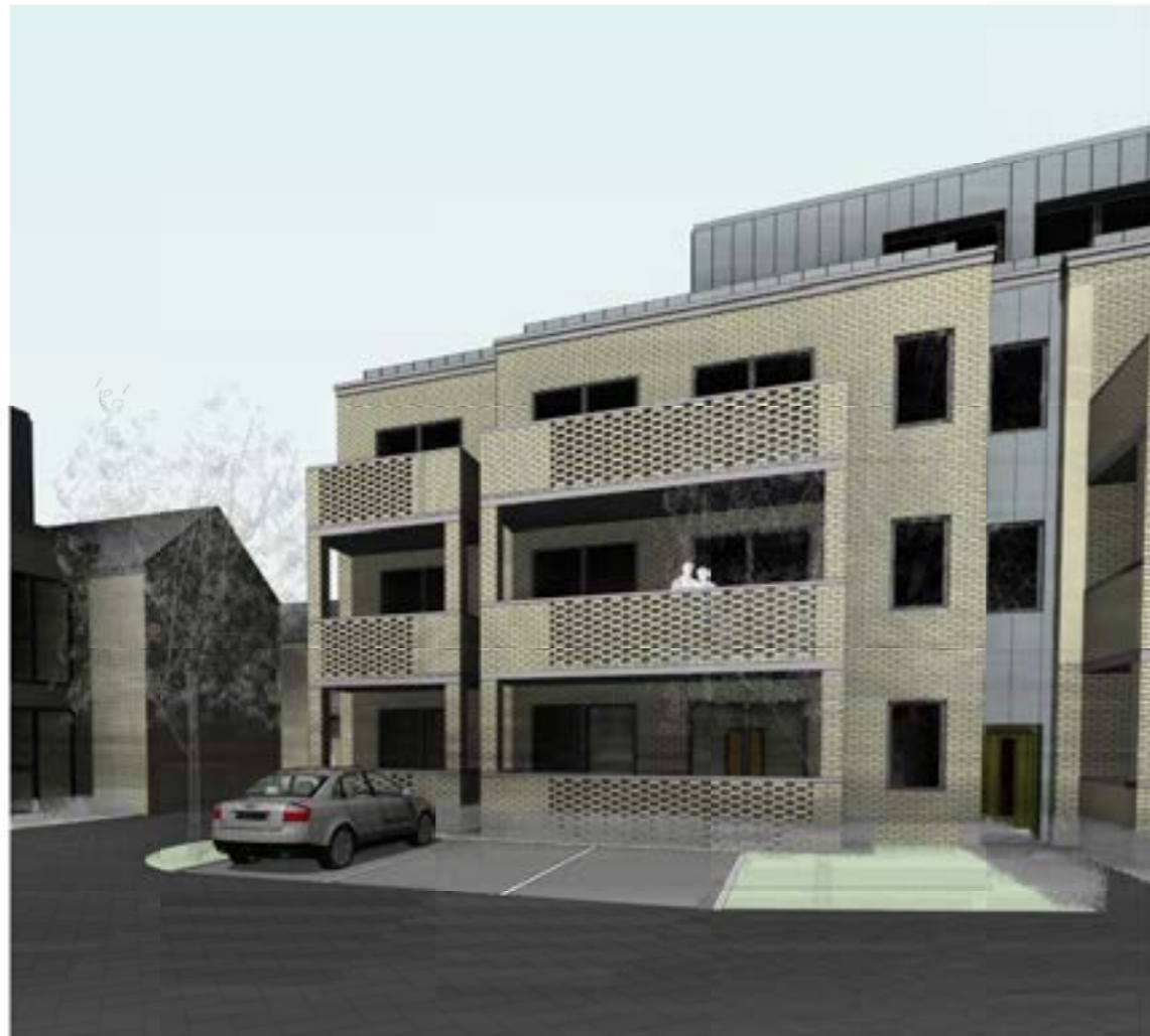
② Perspective 4