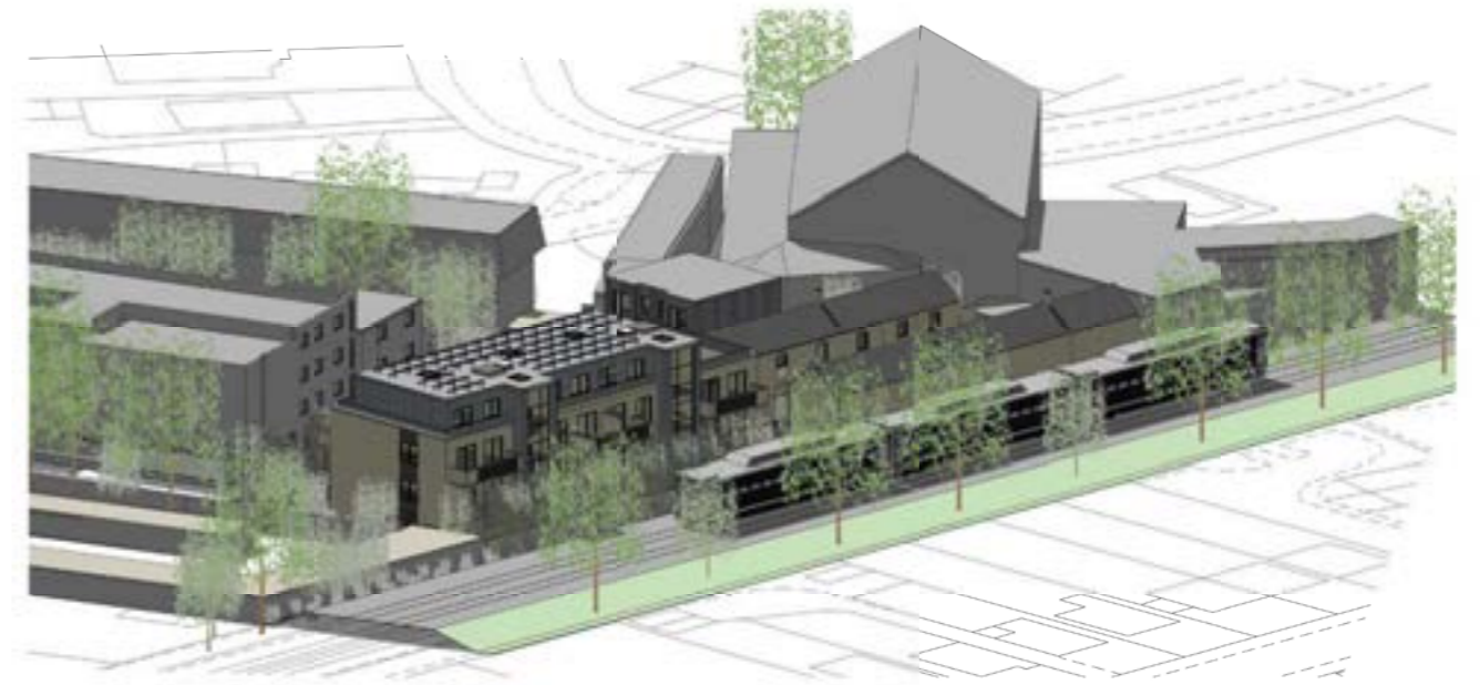
② 3D - North - Proposed