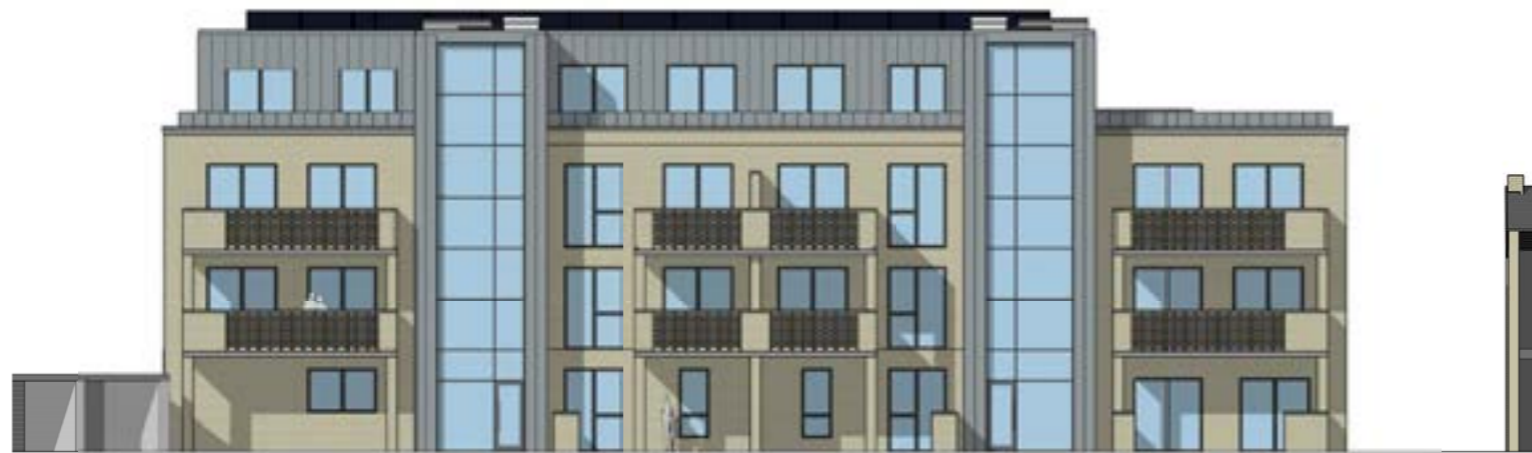
② Rear Elevation 1 : 100