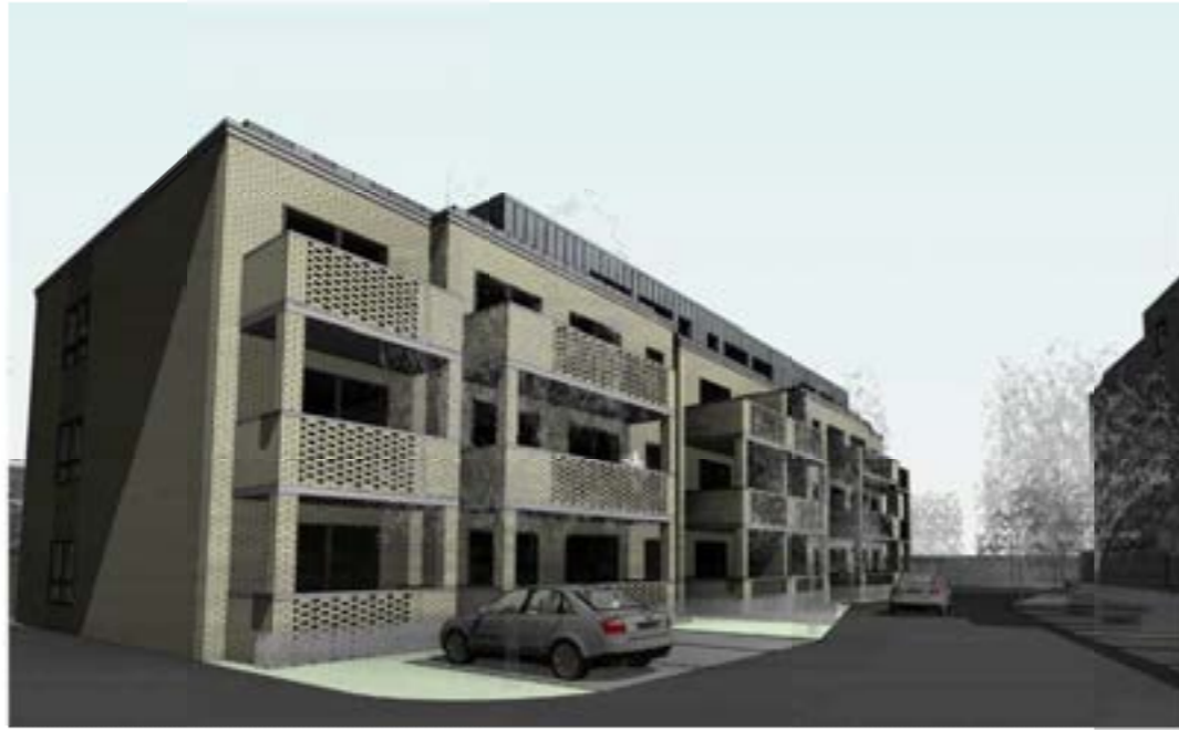
① Perspective 3