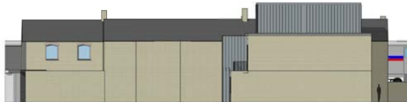
② B1 Commercial Units 3 + 4 - Rear Elevation 1 : 100