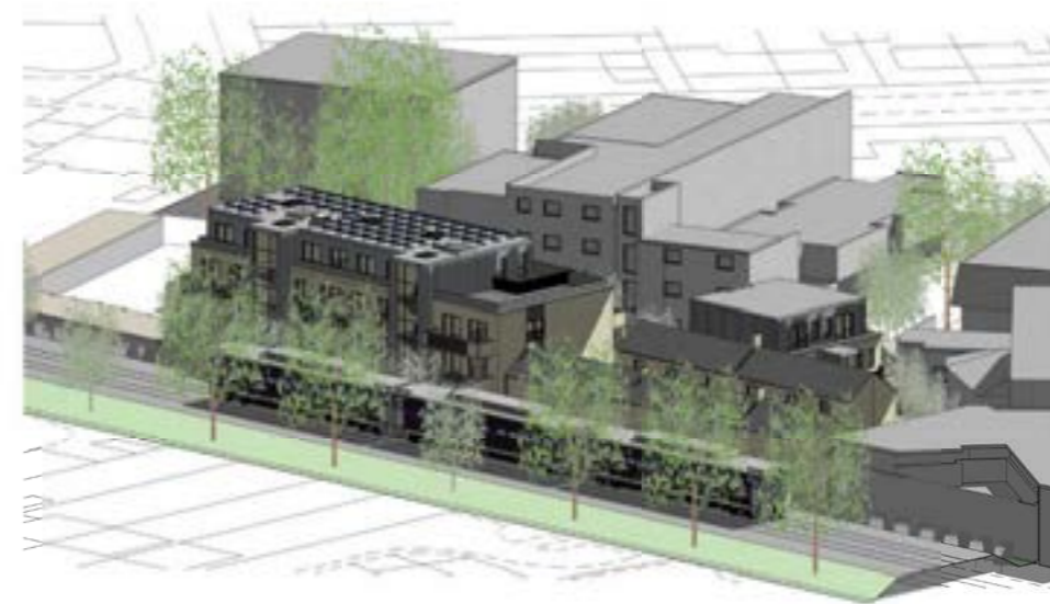
④ 3D - West - Proposed