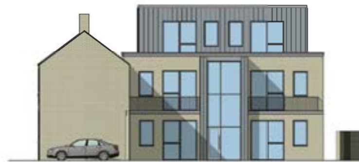
② Small Block - Rear Elevation 1 : 100