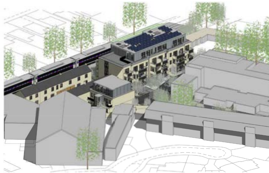
③ 3D - South - Proposed