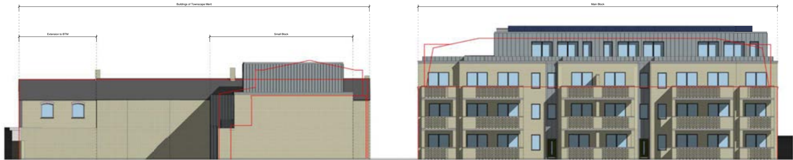
1 Pre-Application Comparative Elevation 1 : 100

Outline of previous scheme submitted for Pre-Application Advice