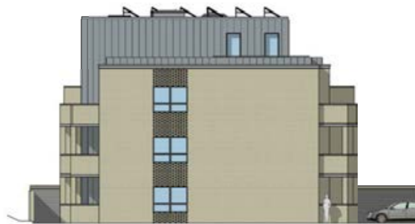
④ South West Elevation 1 : 100