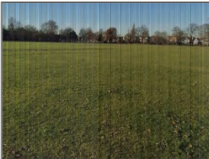
Plate 5: Cricket Outfield