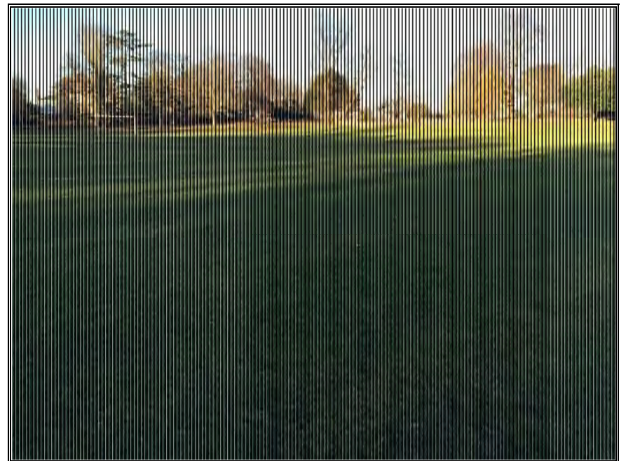
Plate 4: Rugby Pitch 1 – high shade levels