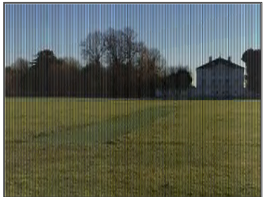
Plate 6: Cricket wicket