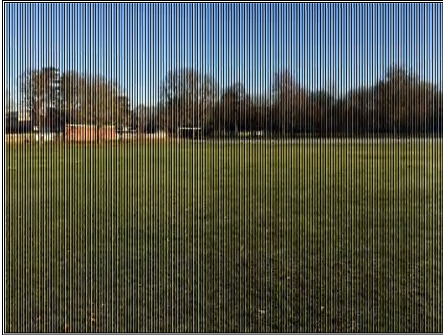
Plate 1: Pitch 1 and 2, facing east

No evidence was seen on the surface of the sports pitches of underground service infrastructure, e.g. manholes, marker posts, valve housing etc.