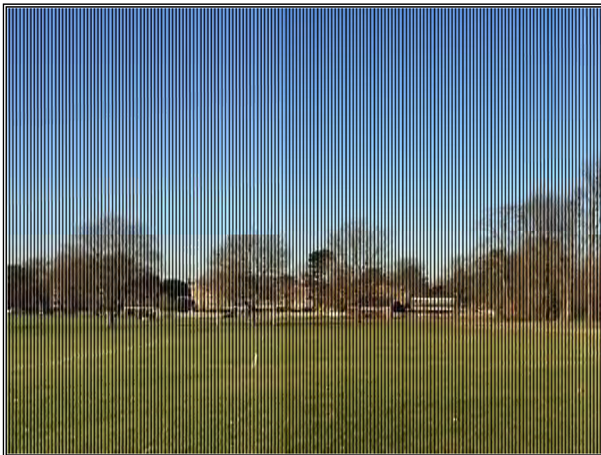
Plate 3: Pitch 7, facing north