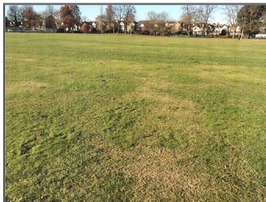
Plate 16: Patchy grass colour – cricket outfield