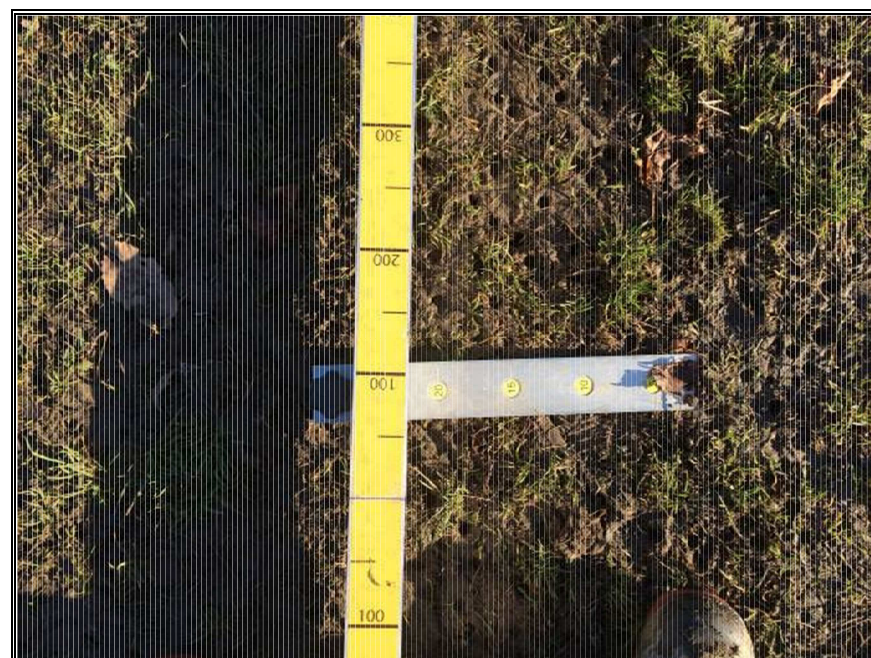
Plate 14: Undulation > 25mm depth – centre circle