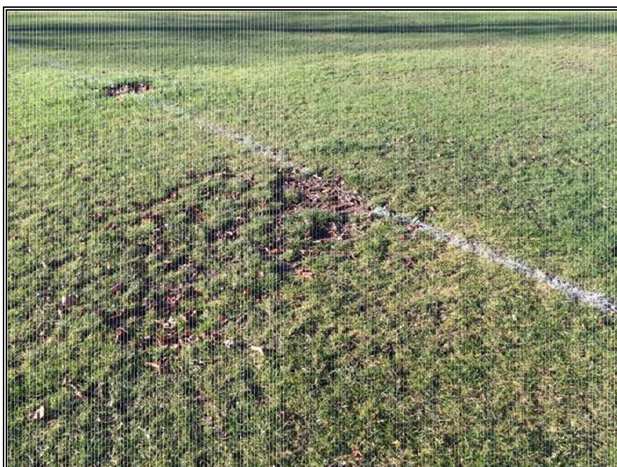
Plate 13: Slight wear in goal mouth – Pitch 4