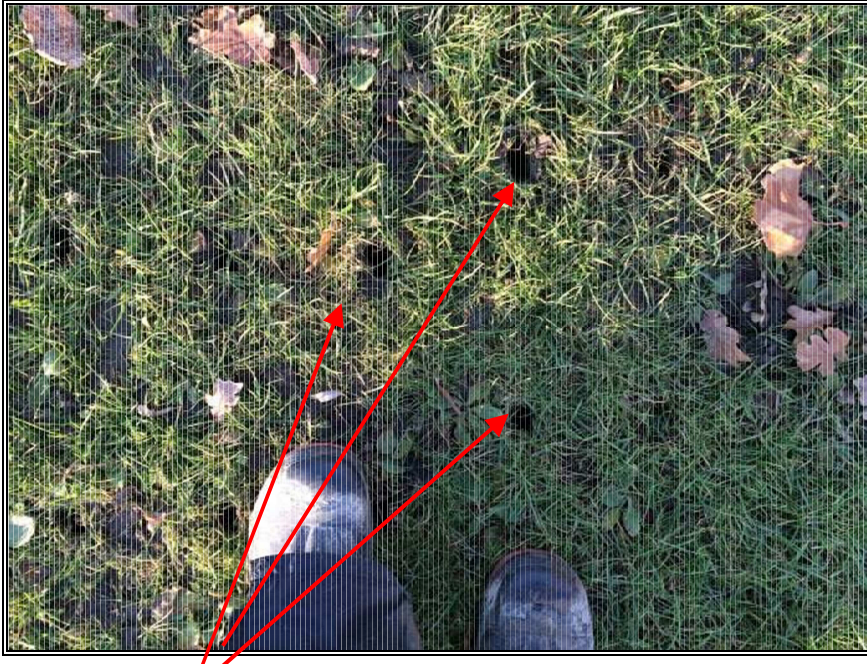
Plate 18: Verti-drain holes