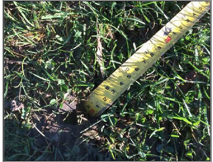
Plate 19: Measured depth of vert-drain hole 210mm