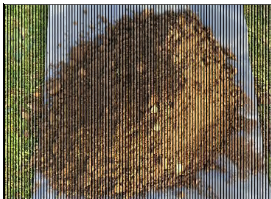
Plate 10: Profile 1 Topsoil arisings – dry friable consistency