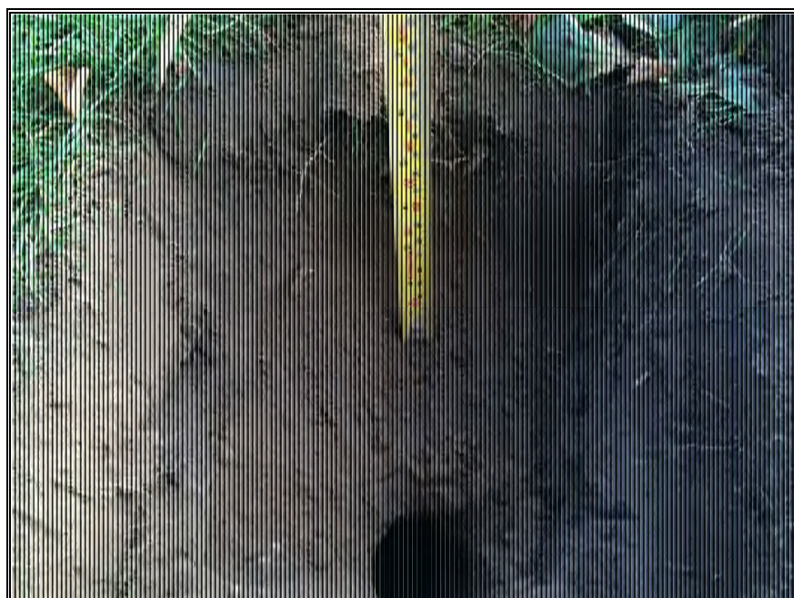
Plate 9: Profile 1 Topsoil at TH26