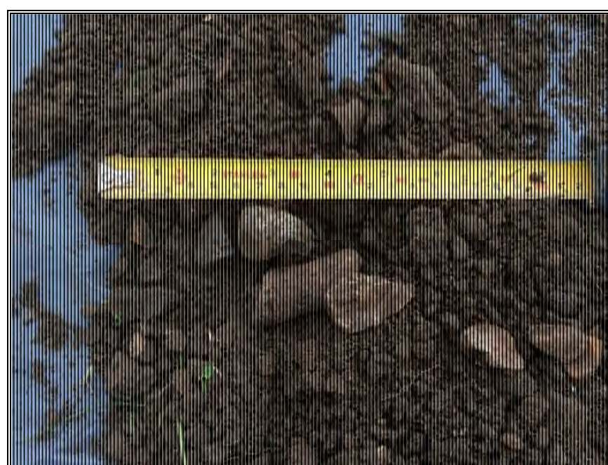
Plate 12: Subangular and subrounded, small to medium sized stones within Profile 1 Topsoil