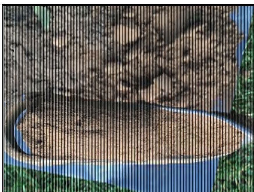
Plate 13: Yellowish brown Profile 1 Subsoil