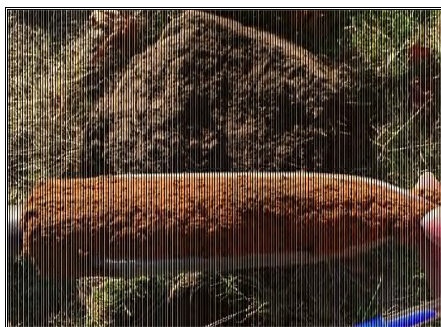
Plate 14: Strong brown Profile 1 Subsoil