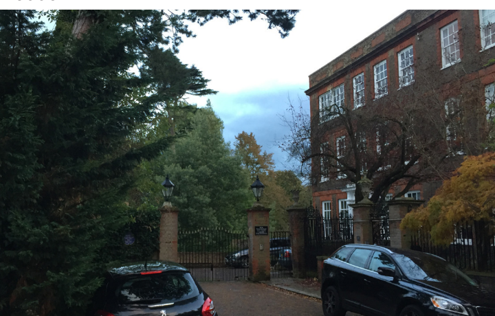
9. Montpelier Row and South End House

MARBLE HILL PARK STABLE BLOCK DESIGN AND ACCESS STATEMENT