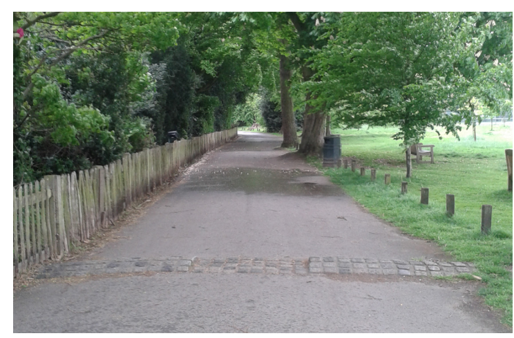
1. Delivery road from Richmond Road, looking north from Stable Block