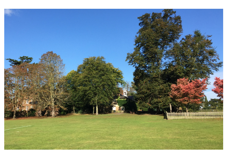
8. Stable Block and South End House viewed from Western Meadow