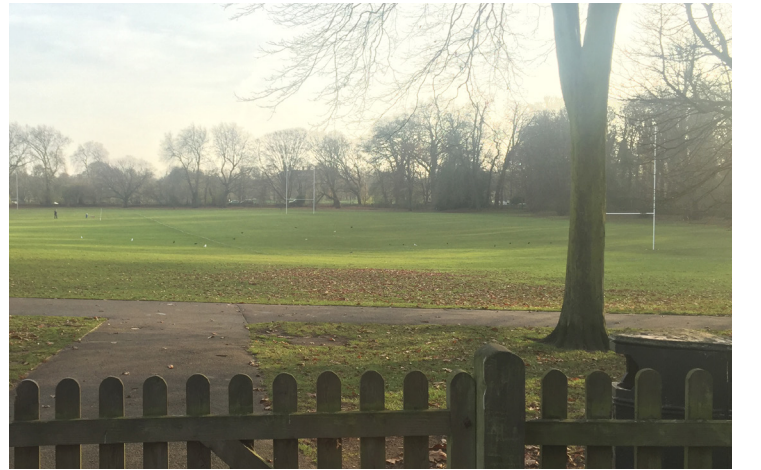
2. View from existing Cafe terrace across Western Meadow to the Thames