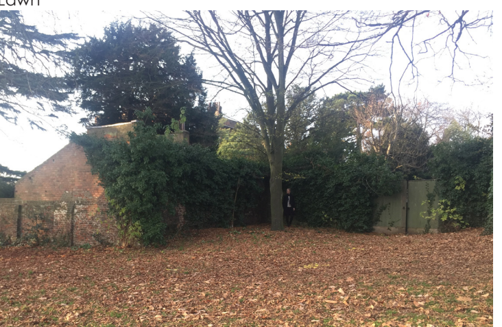
6. South End House boundary wall and gazebo with existing Stable Block fence