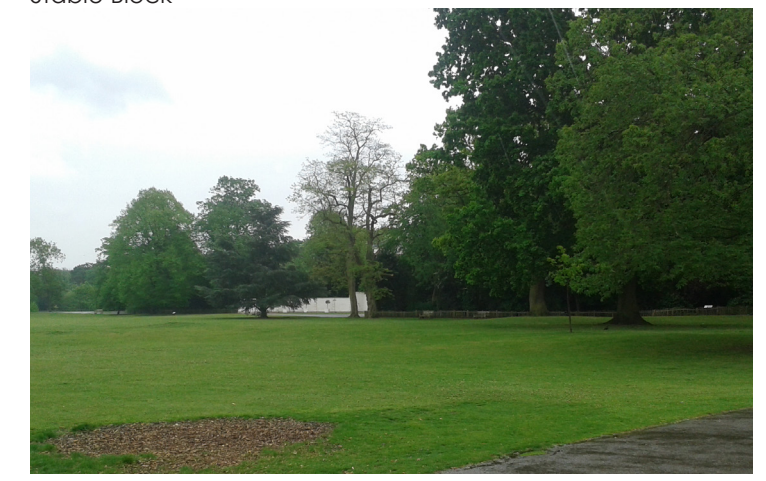
2. View from Stable Block looking across Marble Hill Park to Marble Hill House