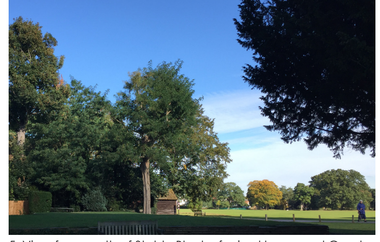
5. View from south of Stable Block of raised lawns and Great Lawn