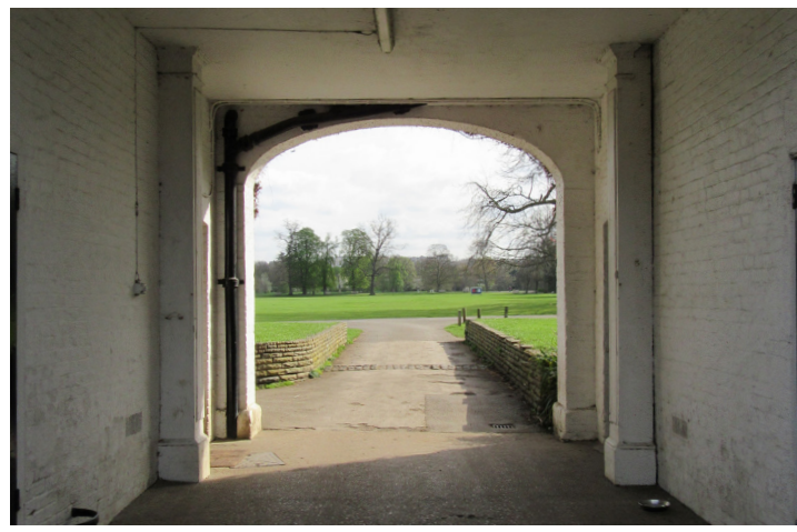
7. View from Stable Block to Great Lawn