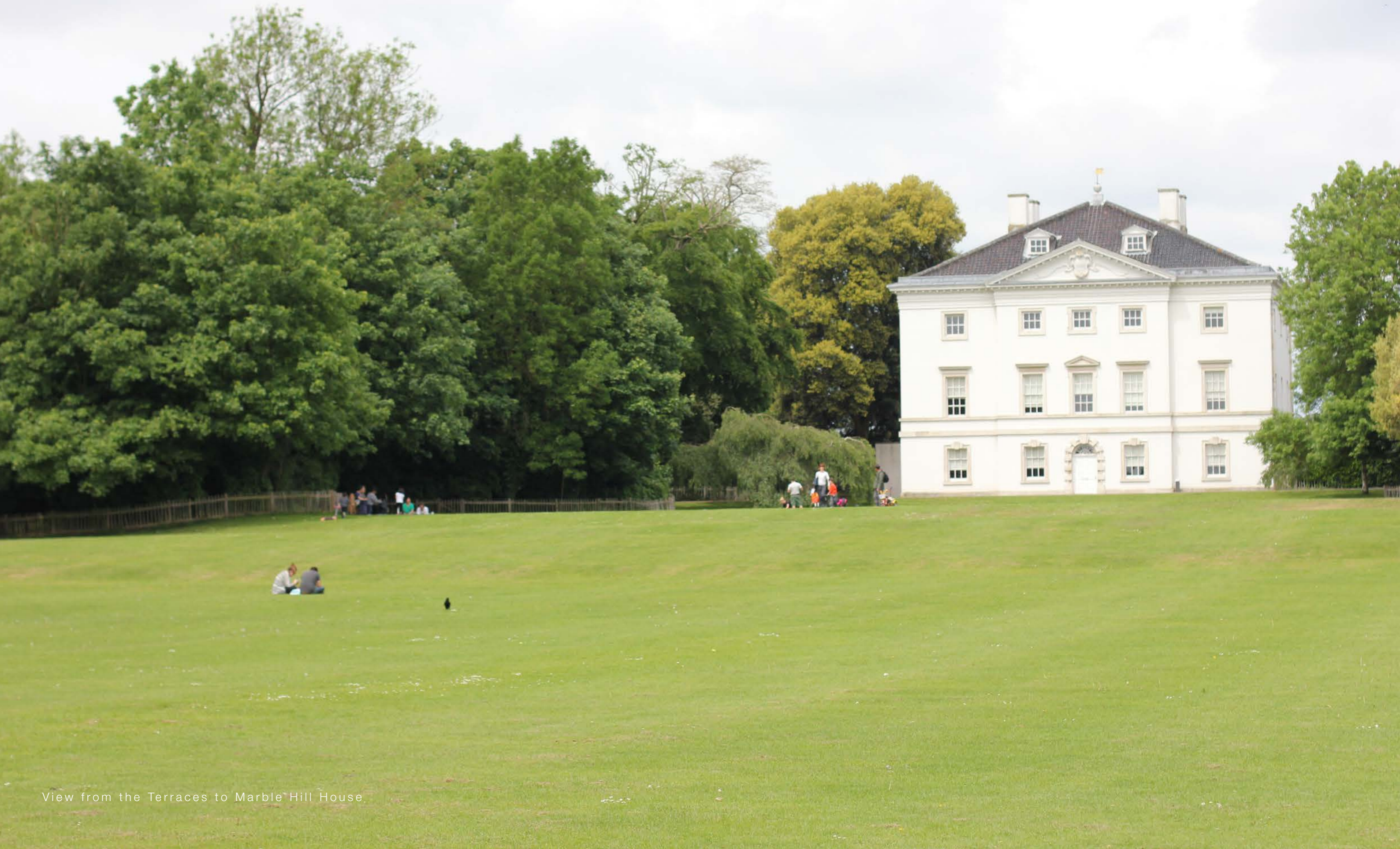
View from the Terraces to Marble Hill House