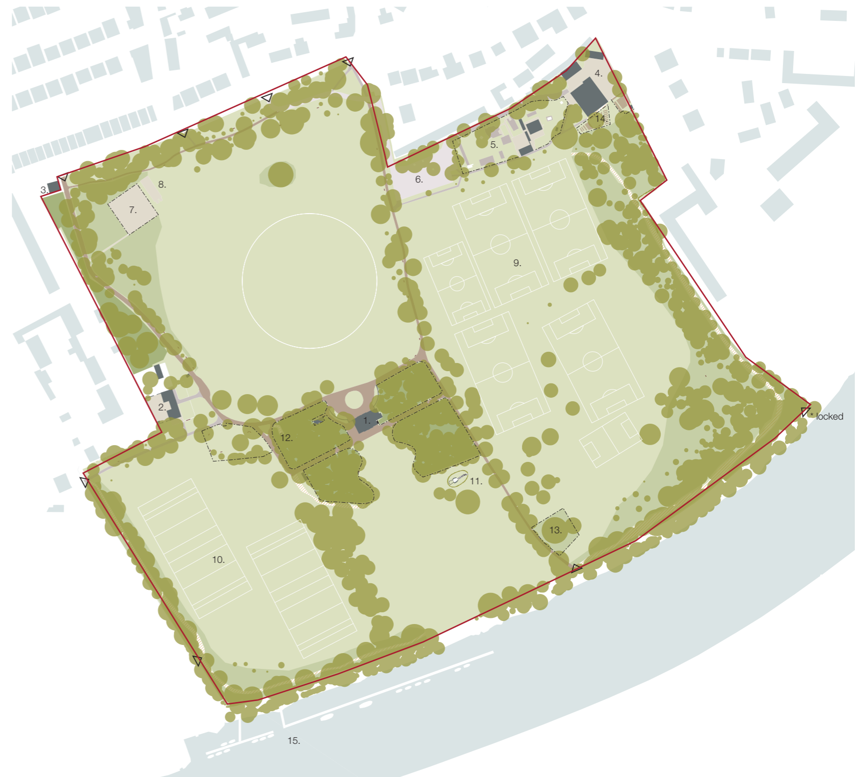
Existing landscape plan