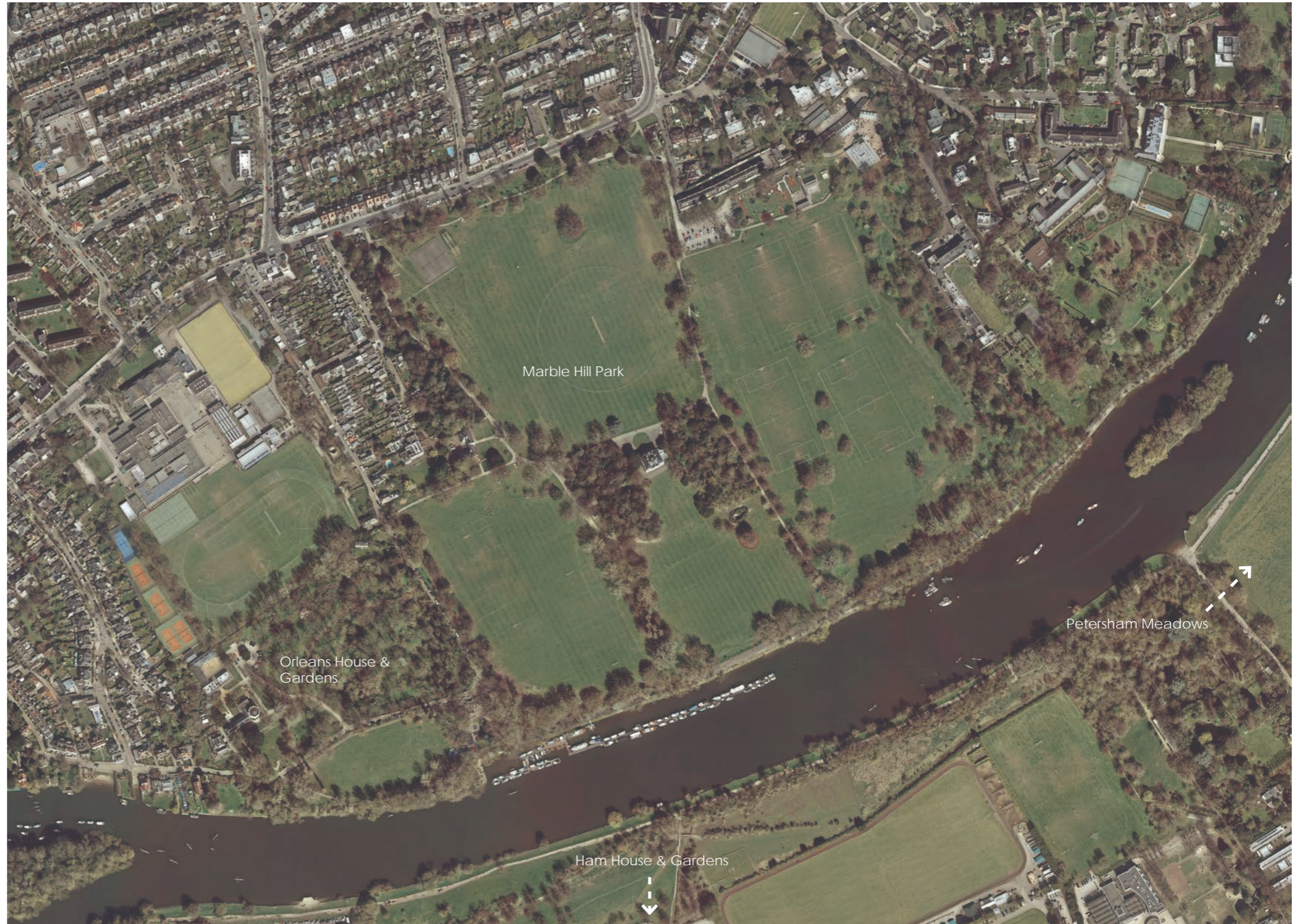
Marble Hill Park in the local open space context

The area to the north and east of Marble Hill Park is made of predominantly low rise, 19th century residential streets. Immediately along the western boundary is Montpelier Row, comprising several listed dwellings, notably two Grade II* listed early 18th century terraces and Grade II* listed South End House whose grounds share a boundary to the rear of the Stable Block. The Grade II listed 'Woodside' is a detached dwelling which shares a boundary along the western edge of the park.