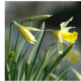
Narcissus pseudonarcissus Daffodil (UK native)