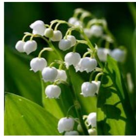
Convallaria majalis Lily of the Valley