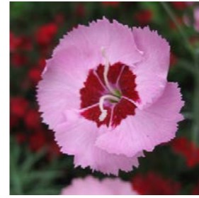
Dianthus plumarius Pink