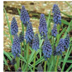
Muscari armeniacum Grape Hyacinth