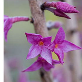
Daphne mezereum February daphne