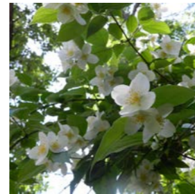
Philadelphus 'Belle étoile' Mock orange