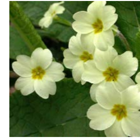
Primula vulgaris Common Primrose