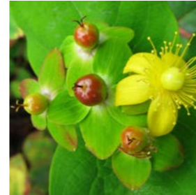
Hypericum androsaemum Balm of the warriors wounds