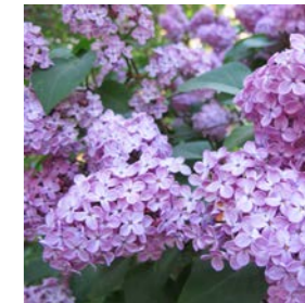
Syringa vulgaris Lilac