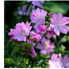
Malva moschata Musk mallow