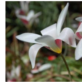
Tulipa clusiana Lady tulip