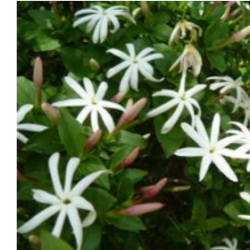
Jasminum angulare Jasmine