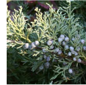
Juniperus communis Juniper