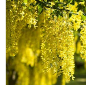
Laburnum x watereri Laburnum