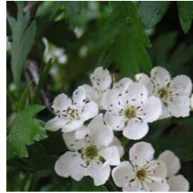
Crateagus monogyna Hawthorn