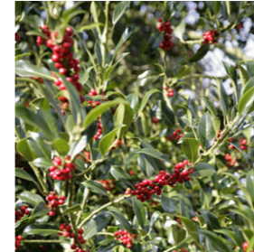
Ilex aquifolium Common holly