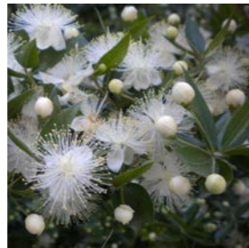
Myrtus communis Myrtle