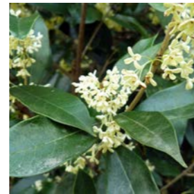
Osmanthus fragans Sweet olive