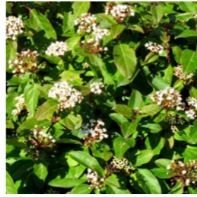
Viburnum tinus Laurustinus