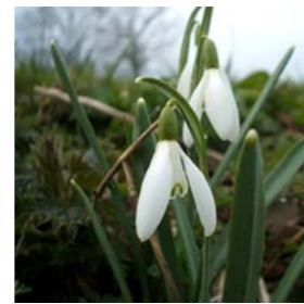
Galanthus nivalis Snowdrop