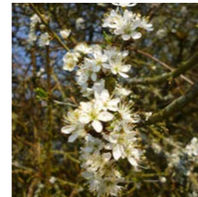
Prunus spinosa Blackthorn