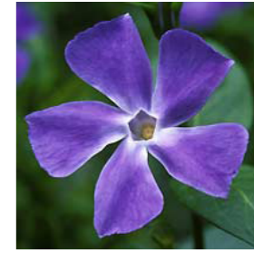
Vinca major Greater periwinkle