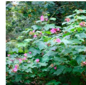
Rubus odoratus Purple flowering raspberry