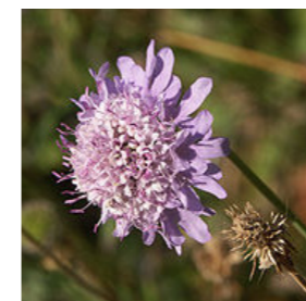
Scabiosa columbaria - Small scabious Flowering period: summer / autumn