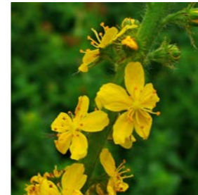
Agrimonia eupatoria - Agrimony Flowering period: summer / autumn