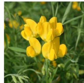
Lathyrus pratensis - Meadow Vetchling Flowering period: spring / summer