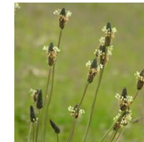
Plantago lanceolata - Ribwort Plantain Flowering period: spring / summer