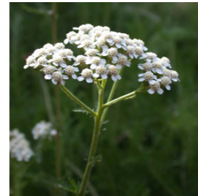
Achillea millefolium - Yarrow Flowering period: summer

The existing woodland edges and belts of trees with tall grassland understorey will be extended with significant new tree planting and expanded zones of relaxed mowing. This will improve movement corridors for mammals such as badgers and encourage more flying insects along bat foraging routes. The zones to the south of the site which are prone to flooding will be overseeded with wildflowers which are suited to the wetter conditions to encourage a more diverse flowering meadow sward. Improvements to the habitat edges to the park will be an on-going management operation, carried out by the Head Gardener, potentially as a volunteer engagement activity.