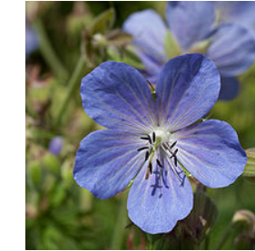
Geranium pratense - Meadow Cranesbill Flowering period: summer