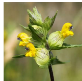
Rhinanthus minor - Yellow rattle Flowering period: summer / autumn