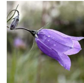
Campanula rotundifolia - Harebell Flowering period: spring / summer / autumn