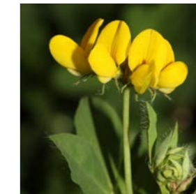
Lotus corniculatus - Bird's Foot Trefoil Flowering period: summer / autumn