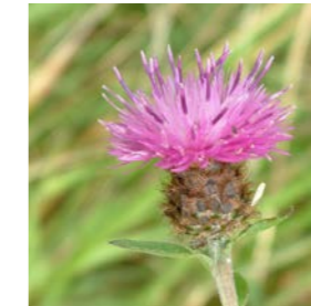
Centaurea nigra - Lesser Knapweed Flowering period: summer / autumn