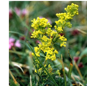
Galium verum - Lady's bedstraw Flowering period: summer