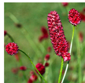
Sanguisorba officinalis - Great Burnet Flowering period: summer