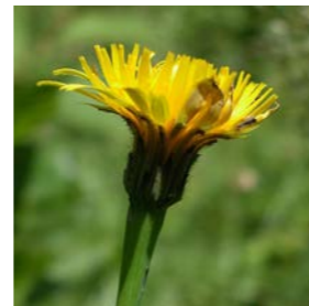
Hypochaeris radicata - Common Catsear Flowering period: summer / autumn