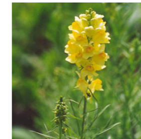
Linaria vulgaris - Yellow Toadflax Flowering period: summer / autumn