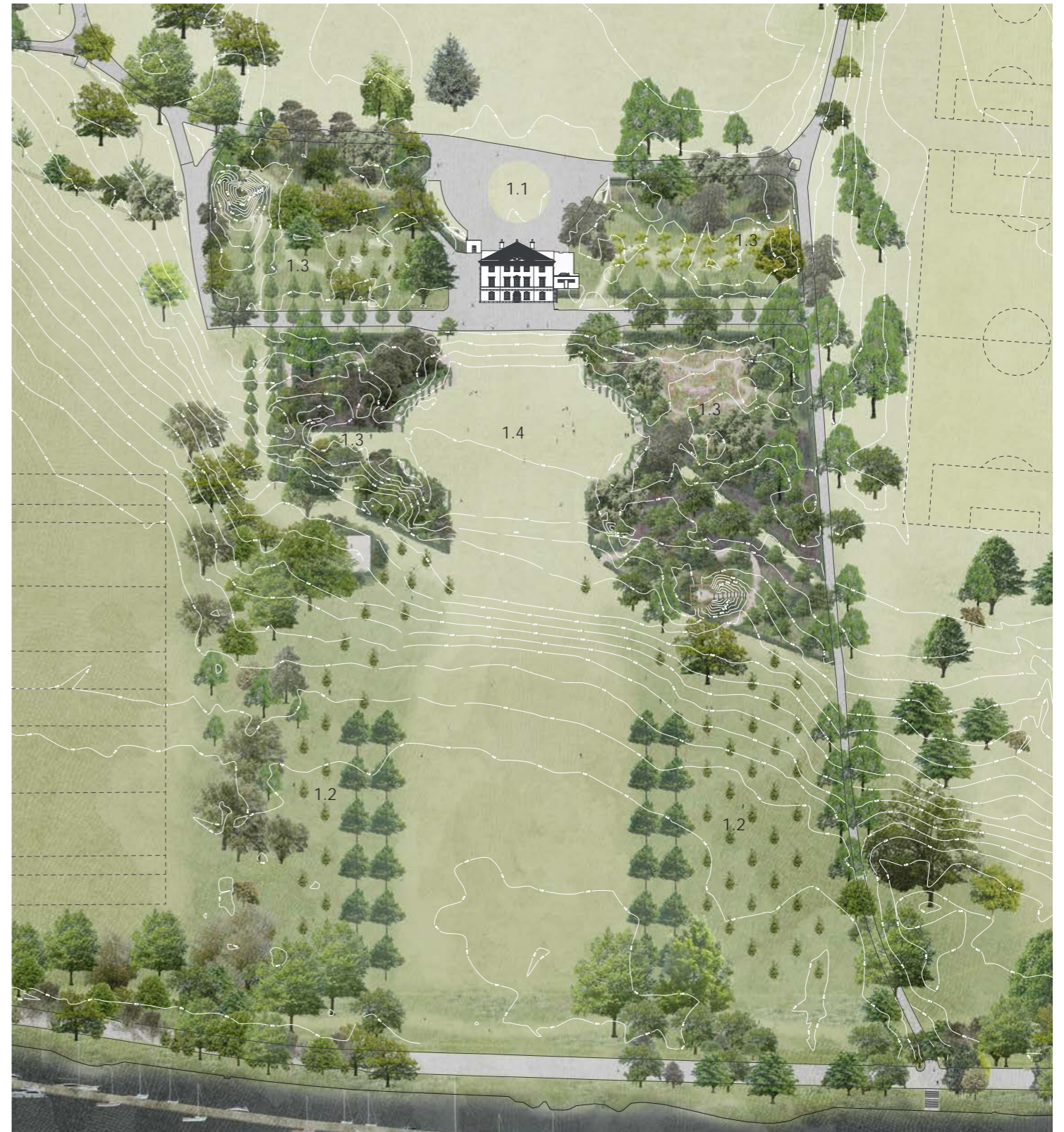
Planometric of the proposed Pleasure Grounds reinterpretation - Ref. 581_PL_L_03_E