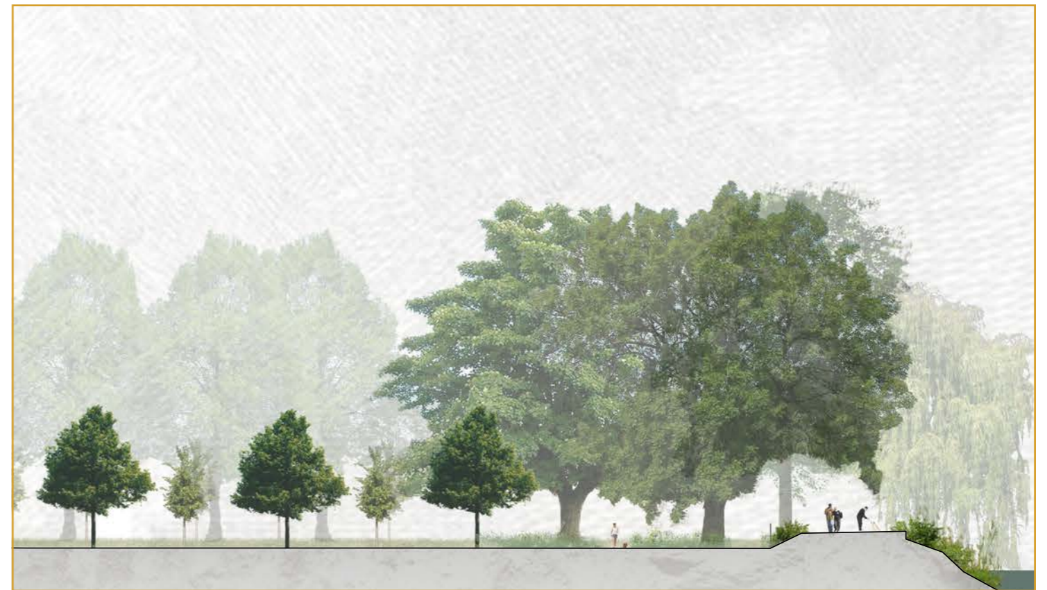
Detail of north-south proposed landscape section through the Pleasure Grounds