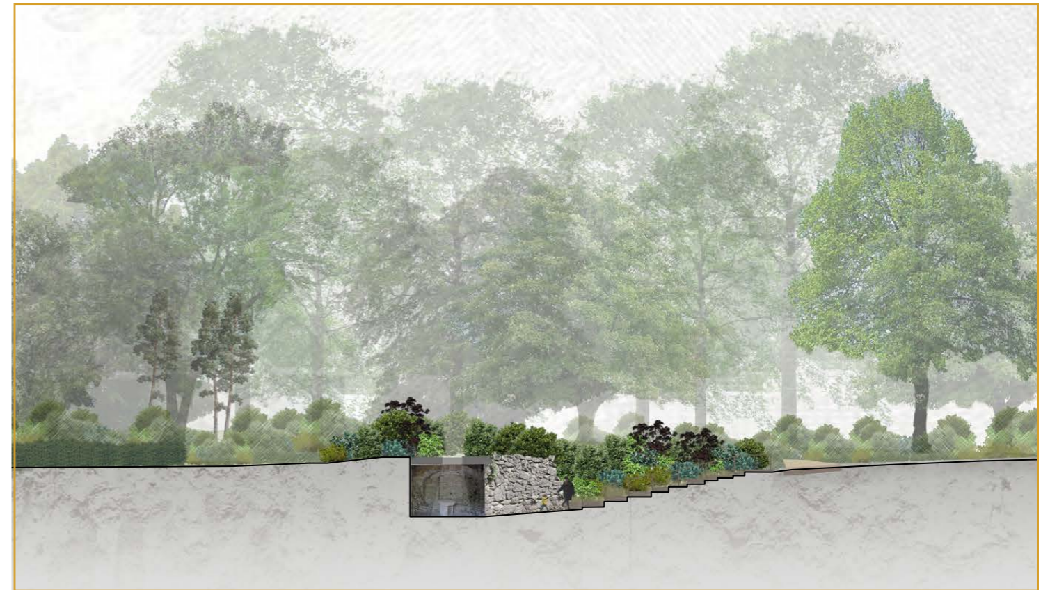
B' - B' East West proposed landscape section through the Pleasure Grounds Ref. 581_PL_L_06_B