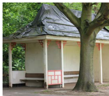
Chinese style shelter