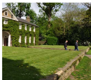
Raised lawns in front of Stable Block