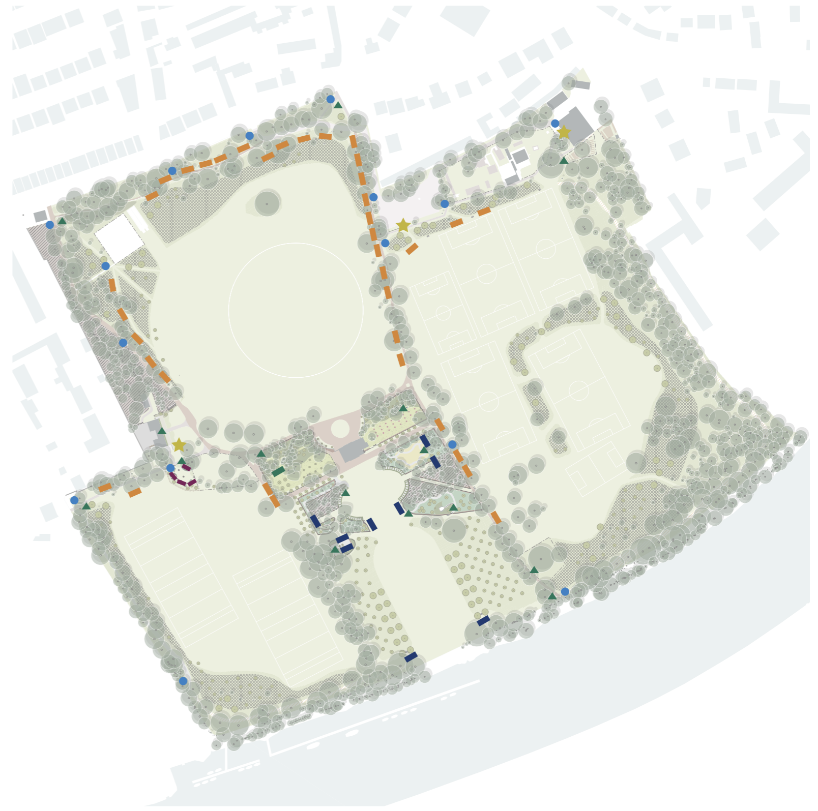
Diagram of proposed furniture and interpretative elements within Marble Hill Park - Ref. 581_PL_L_04_G