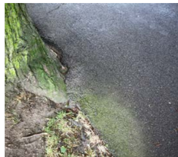
Existing surfaces within Marble Hill Park