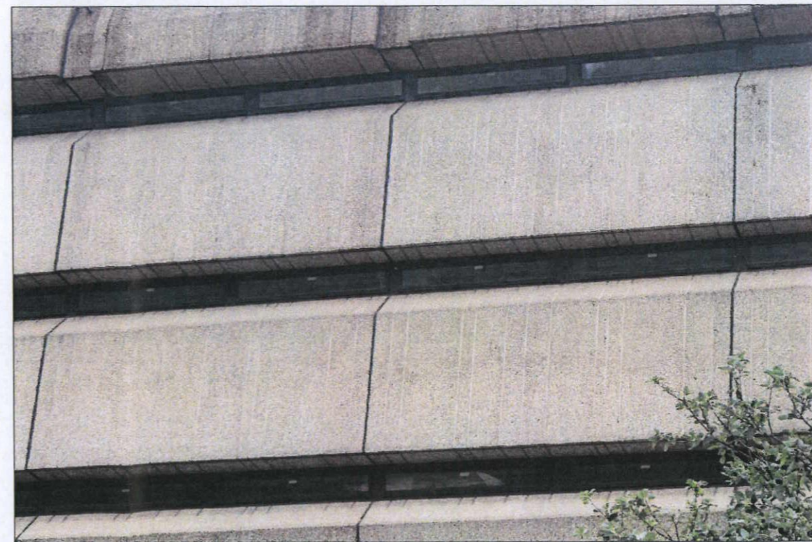
Typical bay of existing Q1 external elevations