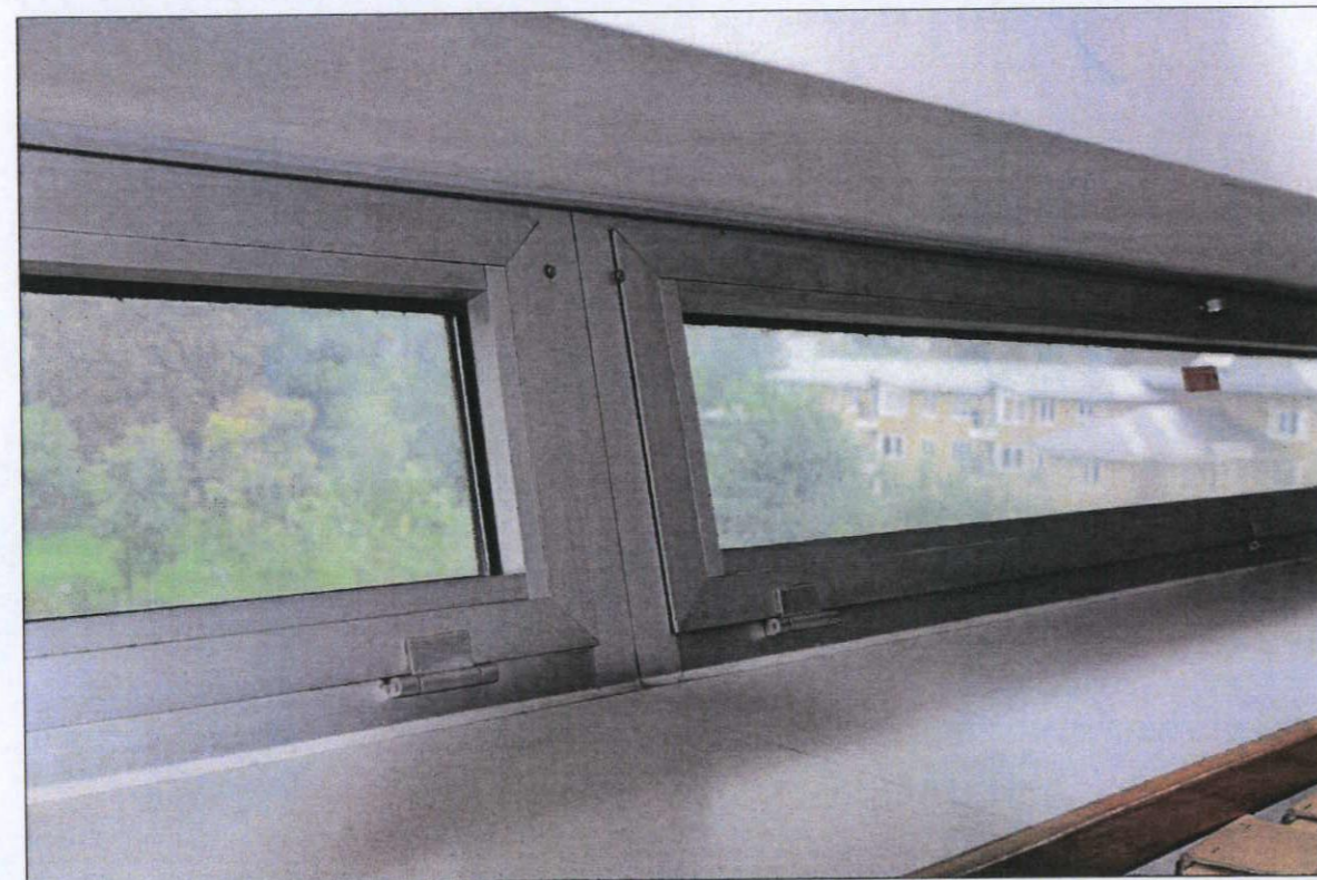
Internal view of a typical Q1 building Repository window.