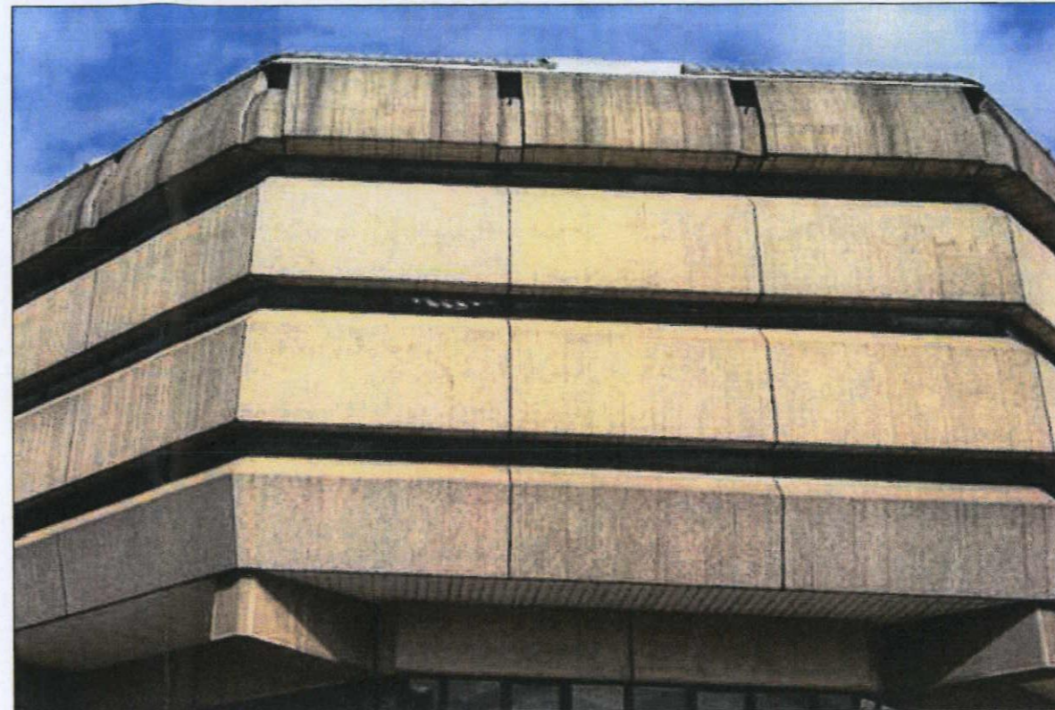
The as existing, deeply recessed, windows to the 2nd, 3rd, and 4th floor Q1 building Repositories