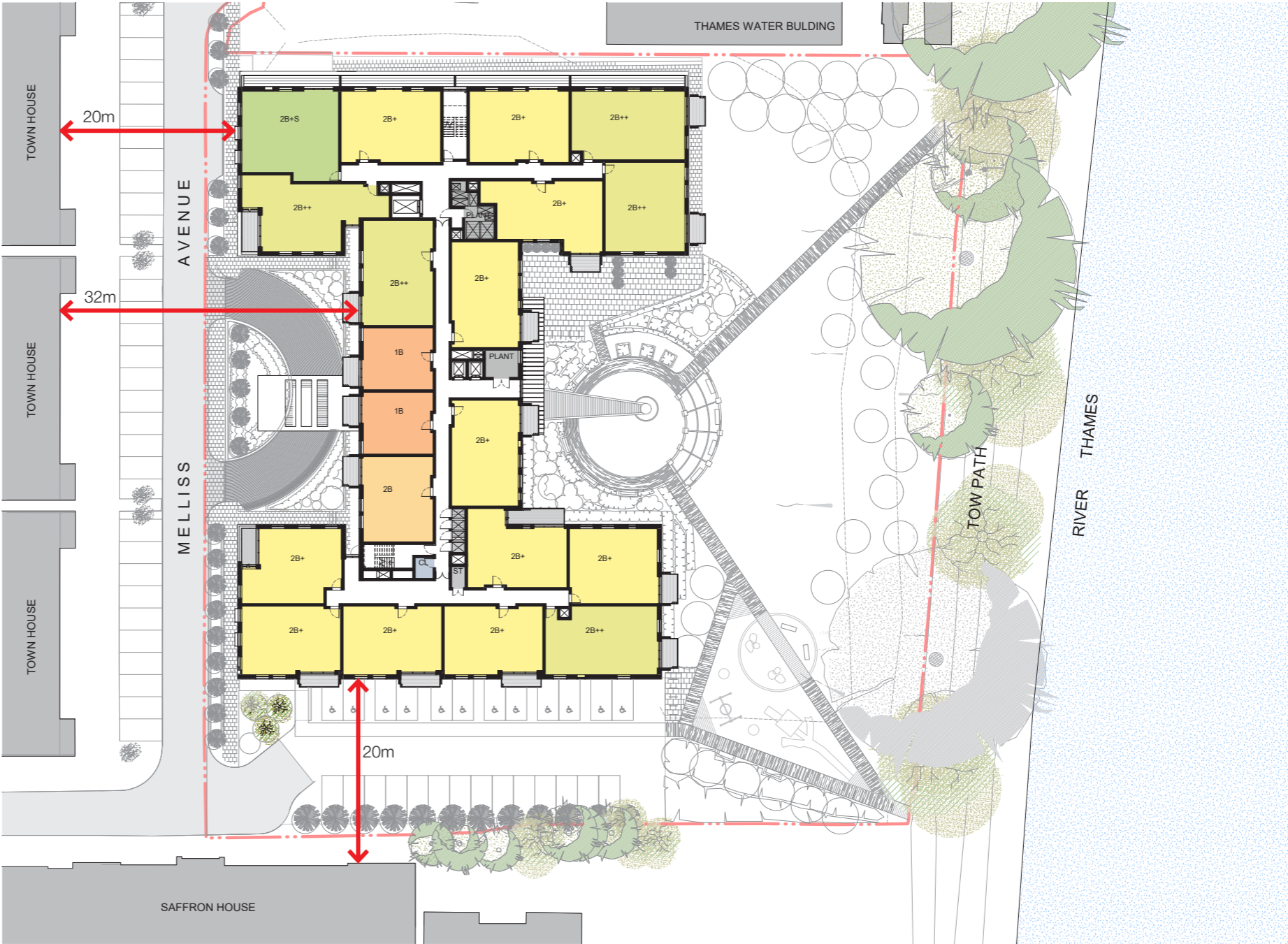
Proposed Level 1 General Arrangement