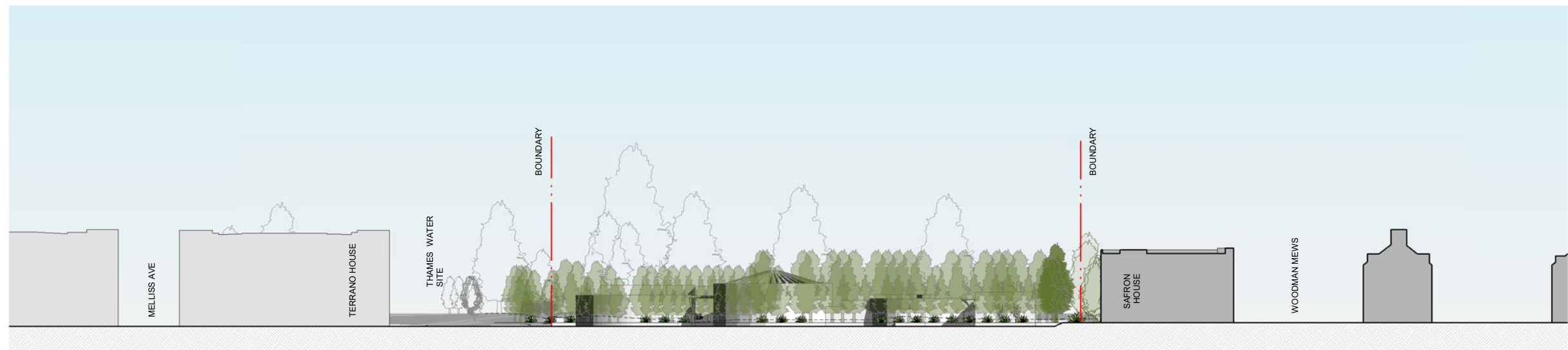
EXISTING WEST ELEVATION 100m