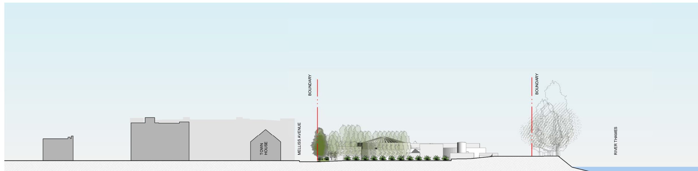
EXISTING SOUTH ELEVATION 100m 1 : 400 @A1 1 : 800 @A3