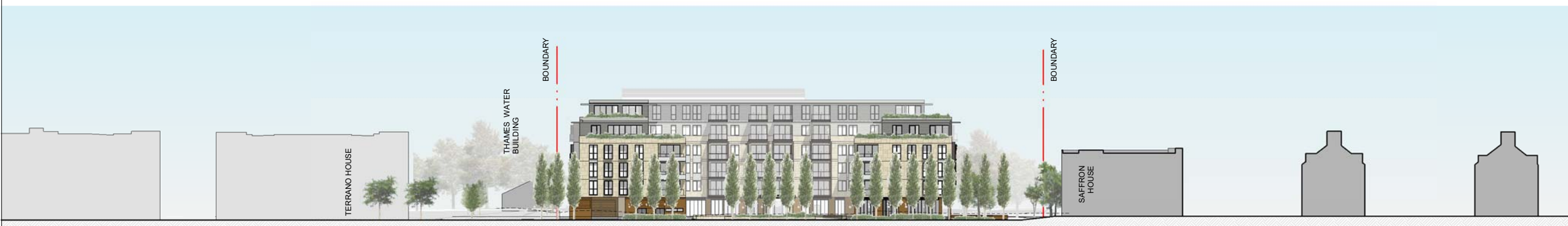
PROPOSED WEST ELEVATION 100m 1: 400 @A1 1: 800 @A3