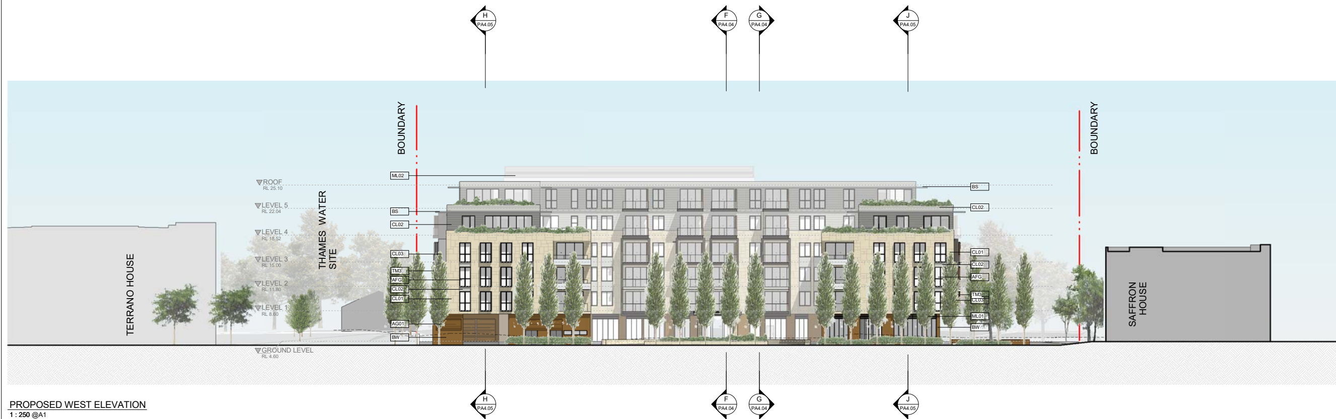
PROPOSED WEST ELEVATION 1: 250 @A1 1: 500 @A3