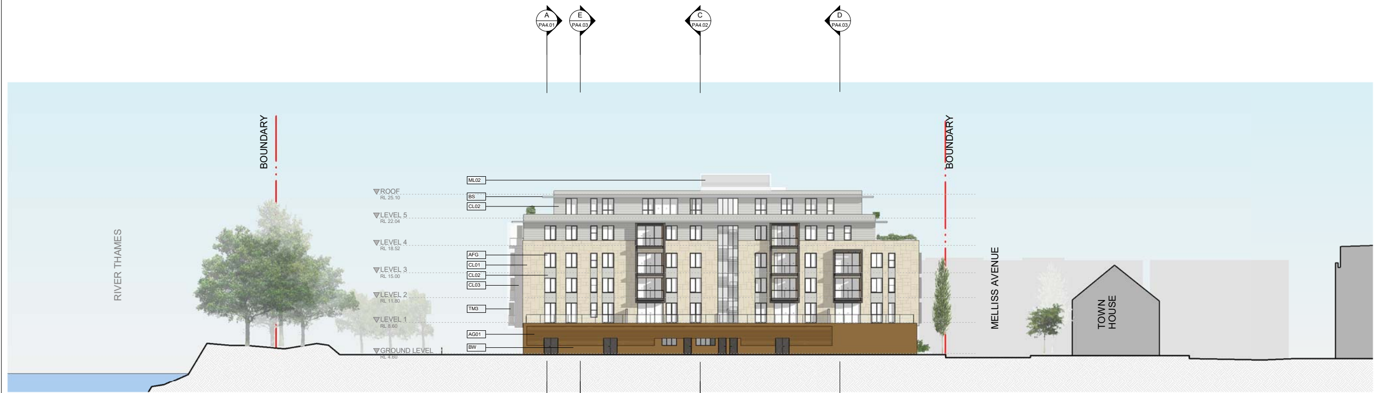
PROPOSED NORTH ELEVATION 1:250 @A1 1:500 @A3