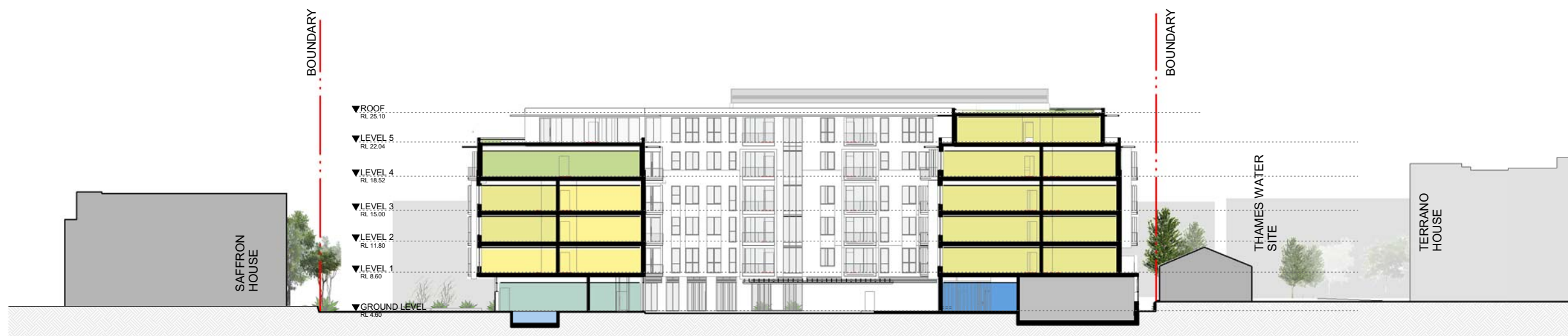
PROPOSED SECTION E-E' 1 : 250