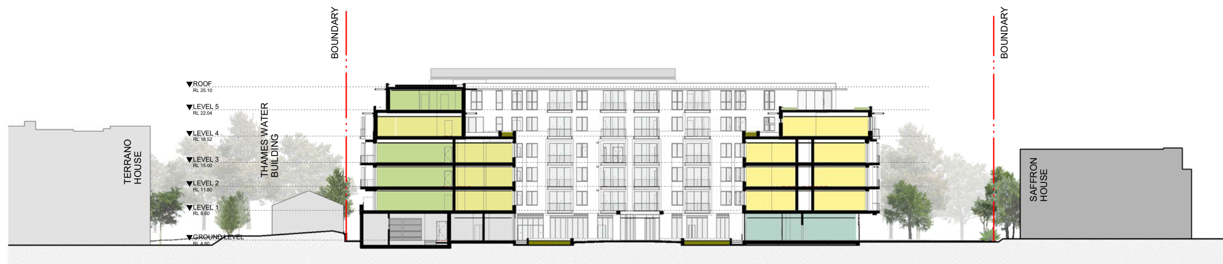
PROPOSED SECTION D-D' 1 : 250

IMPORTANT NOTES: Do not scale from drawings. All dimensions to be checked on site before commencement of work. All discrepancies to be brought to the attention of the Architect. Larger scale drawings and written dimensions take preference. This drawing is copyright and the property of the author, and must not be retained, copied or used without the express authority of MARCHESE + PARTNERS INTERNATIONAL PTY. LTD.