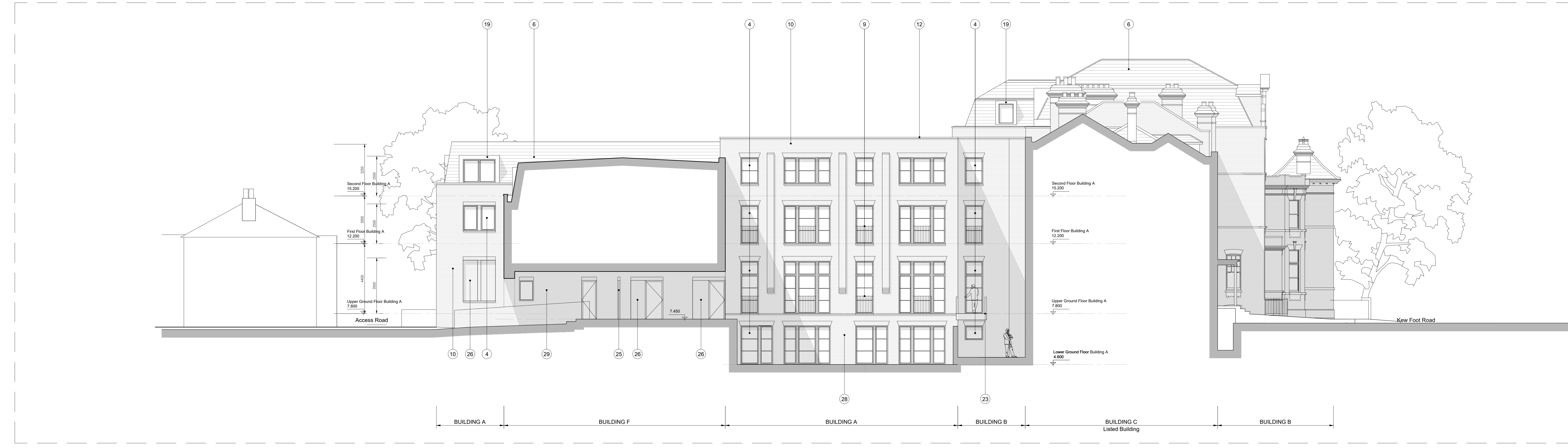
1 Elevation E07 T20E04 SCALE: 1:100 (A0)