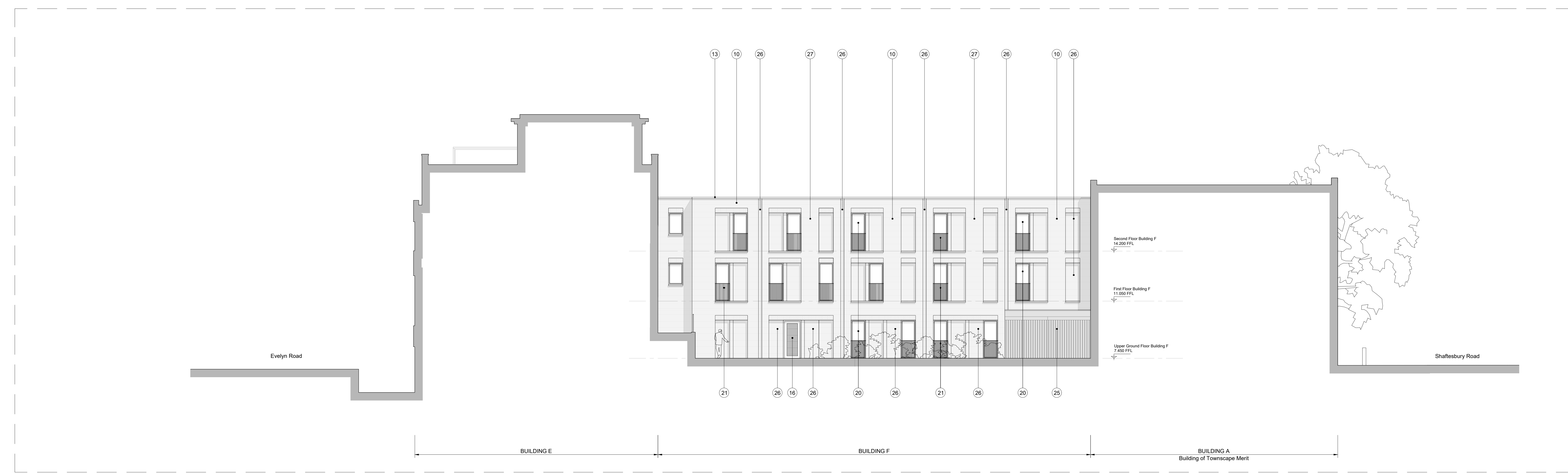
2 Elevation E08 T20E04 SCALE: 1:100 (A0)

1A Issued for Planning Submission 29/11/18 Rev Date