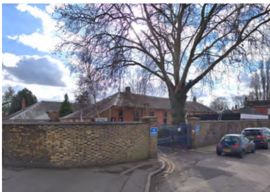
Fleming Lodge North Elevation

NOTES: DO NOT SCALE FROM THIS DRAWING. ALL DIMENSIONS TO BE CHECKED ON SITE. ALL OMISSIONS AND DISCREPANCIES TO BE REPORTED TO THE ARCHITECT IMMEDIATELY. ALL RIGHTS RESERVED. THIS WORK IS COPYRIGHT AND CANNOT BE REPRODUCED OR COPIED OR MODIFIED IN ANY FORM OR BY ANY MEANS, GRAPHIC ELECTRONIC OR MECHANICAL, INCLUDING PHOTOCOPYING WITHOUT THE WRITTEN PERMISSION OF SQUIRE AND PARTNERS ARCHITECTS.