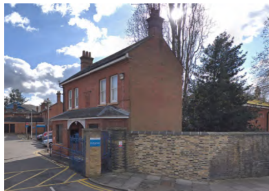
Entrance Lodge North Elevation