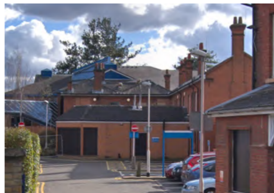
Administration Building Noth Elevation