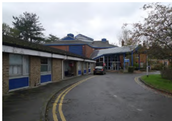
Pembroke Lodge, Sheen Lodge & ESM Unit Noth Elevation

NOTES: DO NOT SCALE FROM THIS DRAWING. ALL DIMENSIONS TO BE CHECKED ON SITE. ALL OMISSIONS AND DISCREPANCIES TO BE REPORTED TO THE ARCHITECT IMMEDIATELY. ALL RIGHTS RESERVED. THIS WORK IS COPYRIGHT AND CANNOT BE REPRODUCED OR COPIED OR MODIFIED IN ANY FORM OR BY ANY MEANS, GRAPHIC ELECTRONIC OR MECHANICAL, INCLUDING PHOTOCOPYING WITHOUT THE WRITTEN PERMISSION OF SQUIRE AND PARTNERS ARCHITECTS.