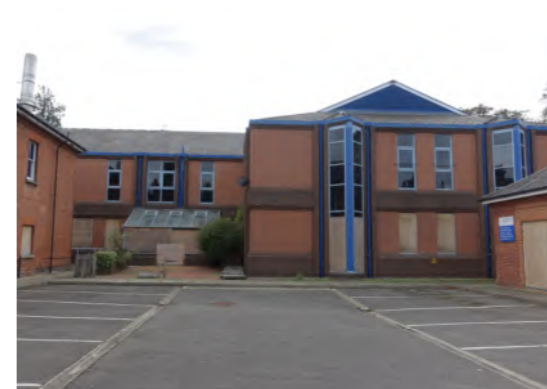
Pembroke Lodge, Sheen Lodge & ESM Unit Noth Elevation