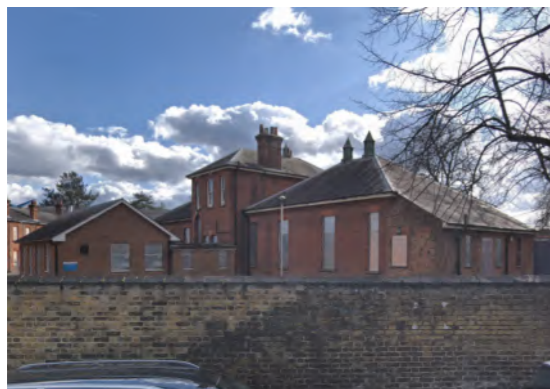
Elizabeth Lodge West Elevation

NOTES: DO NOT SCALE FROM THIS DRAWING. ALL DIMENSIONS TO BE CHECKED ON SITE. ALL OMISSIONS AND DISCREPANCIES TO BE REPORTED TO THE ARCHITECT IMMEDIATELY. ALL RIGHTS RESERVED. THIS WORK IS COPYRIGHT AND CANNOT BE REPRODUCED OR COPIED OR MODIFIED IN ANY FORM OR BY ANY MEANS, GRAPHIC ELECTRONIC OR MECHANICAL, INCLUDING PHOTOCOPYING WITHOUT THE WRITTEN PERMISSION OF SQUIRE AND PARTNERS ARCHITECTS.