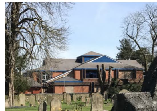
Pembroke Lodge/Sheen Lodge/ ESM Unit West Elevation