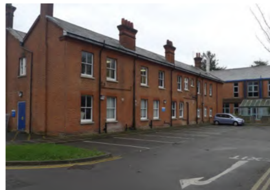
Administration Building West Elevation