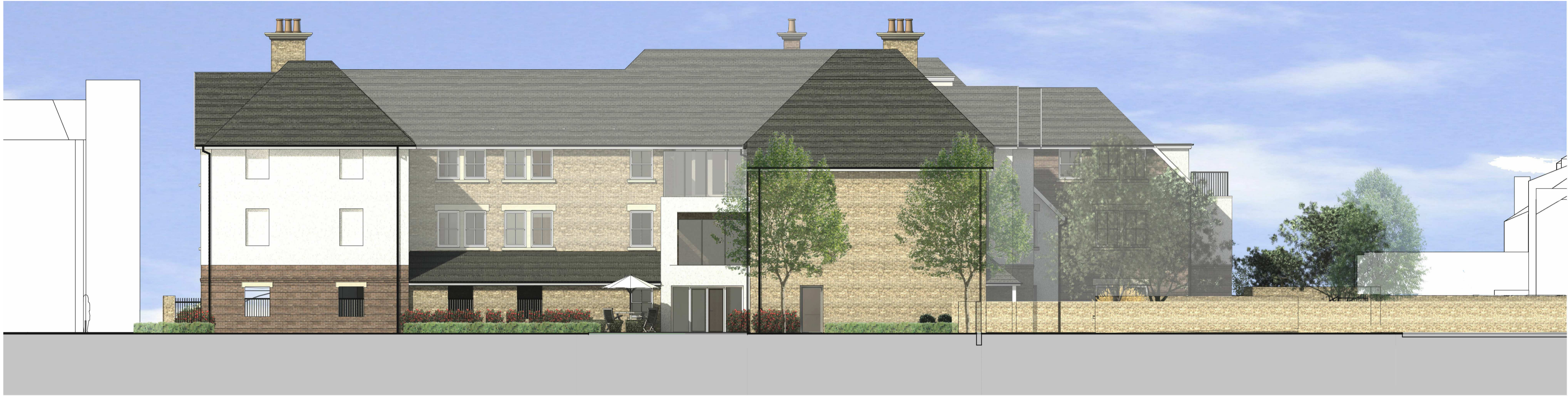
South Elevation (Seymour Lodge) 1 : 100