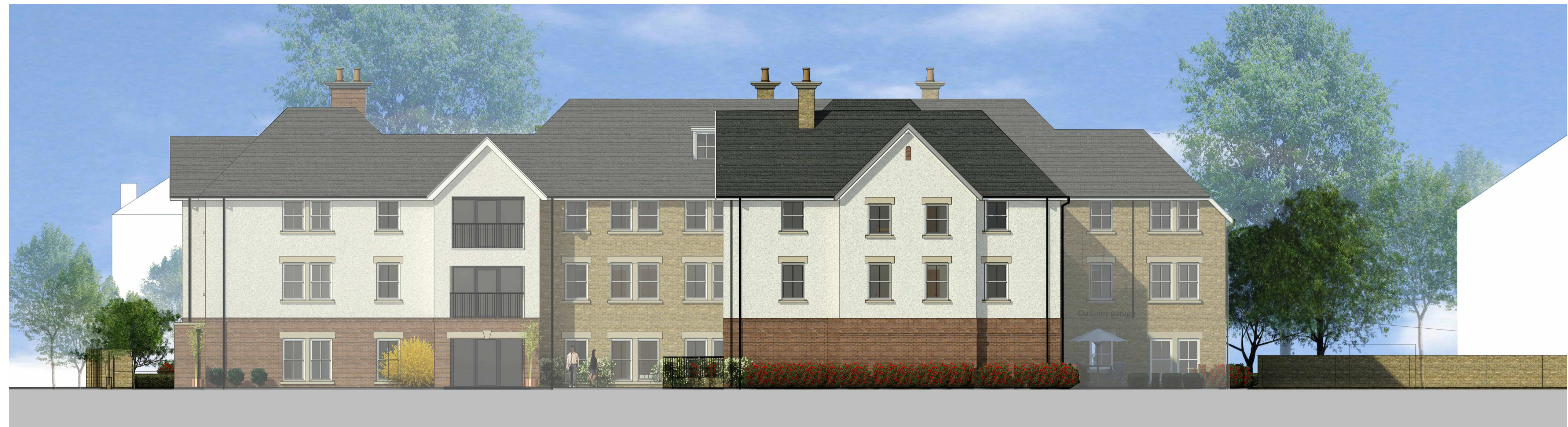
West Elevation (Wick House) 1 : 100