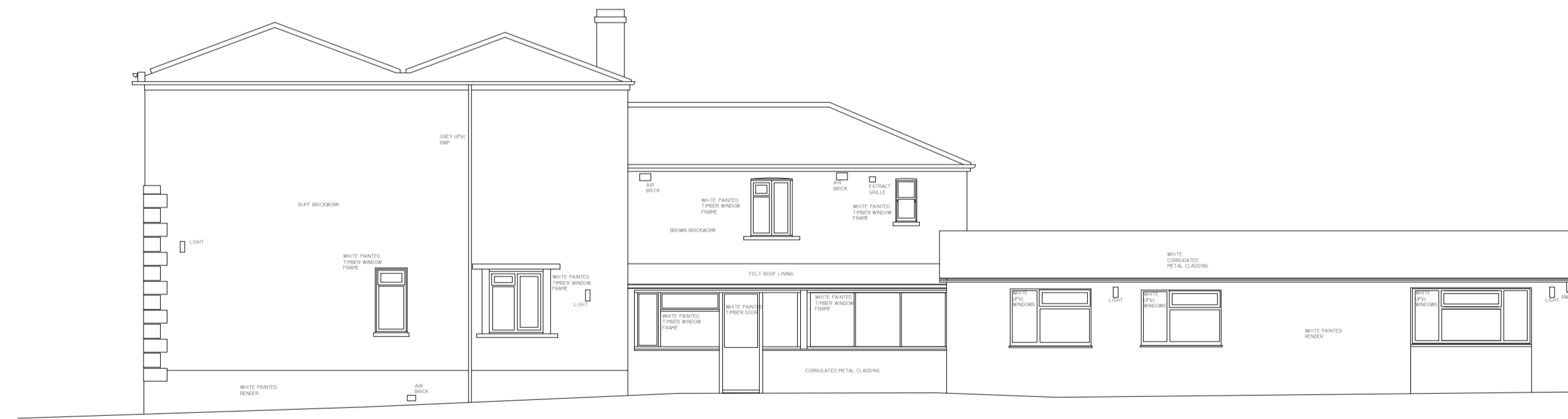
13 North Elevation (Station Road)