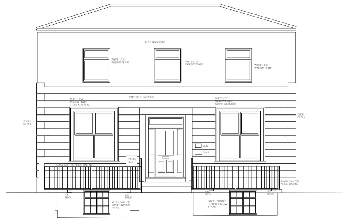
13 East Elevation (Lower Teddington Road)