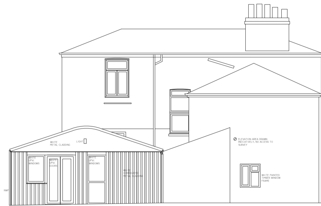
13 West Elevation (Wick House)