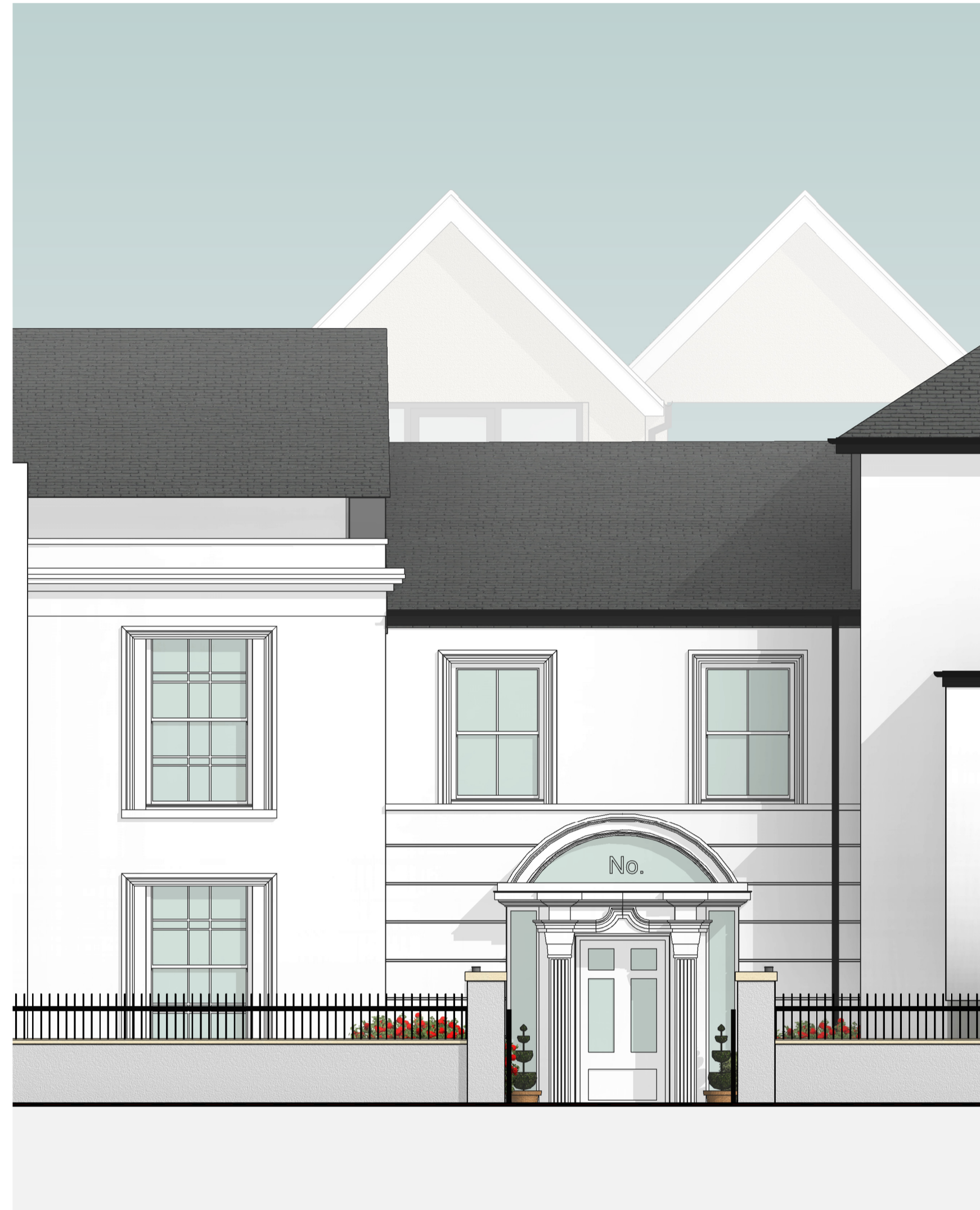
Proposed Entrance Elevation (No.27) 1 : 50