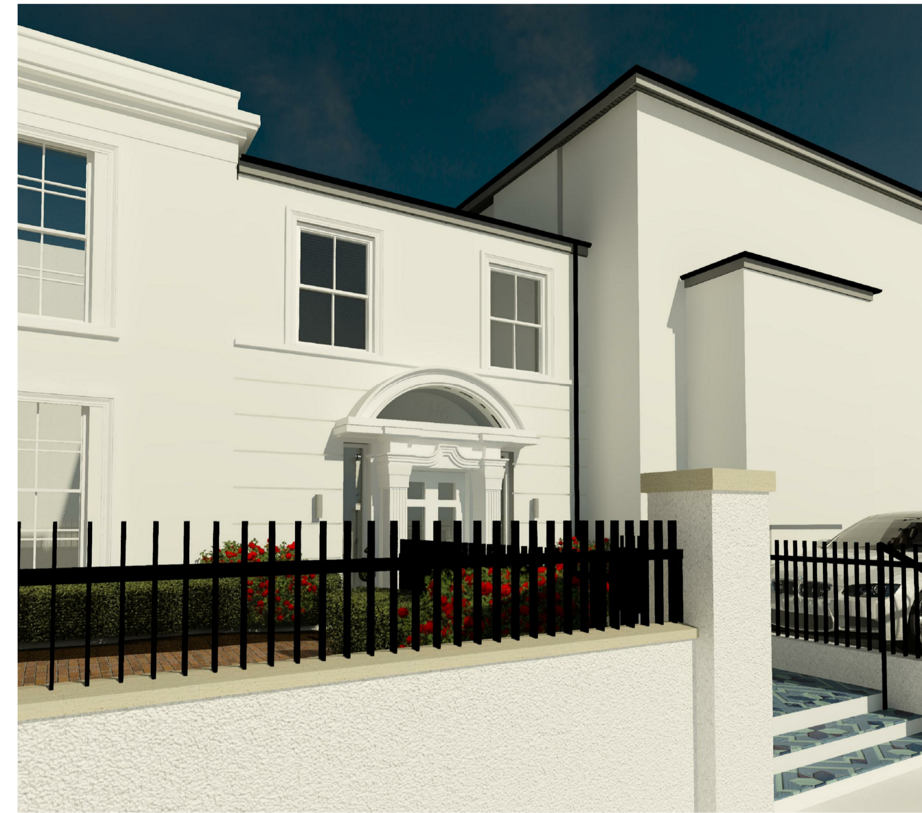
Proposed Front Perspective View 01