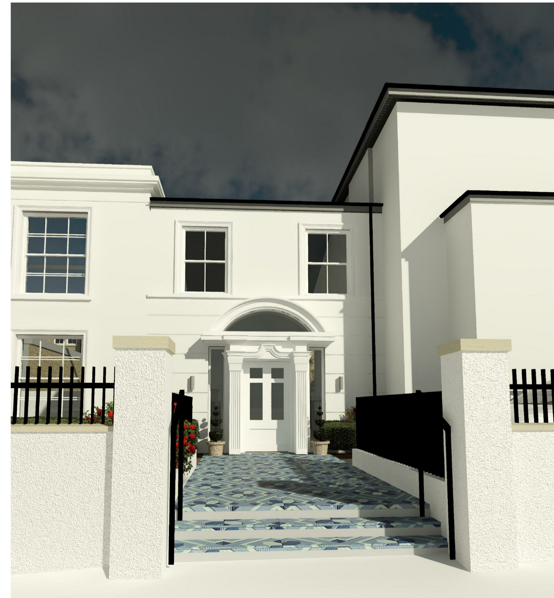
Proposed Front Perspective View 02