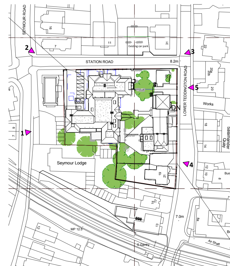
SP00(Location Plan)(FE - 1-1250) 1 : 1250

Figured dimensions only are to be used. All dimensions to be checked onsite. Differences between drawings and between drawings and specification or bills of quantities to be reported to the PRC Group.