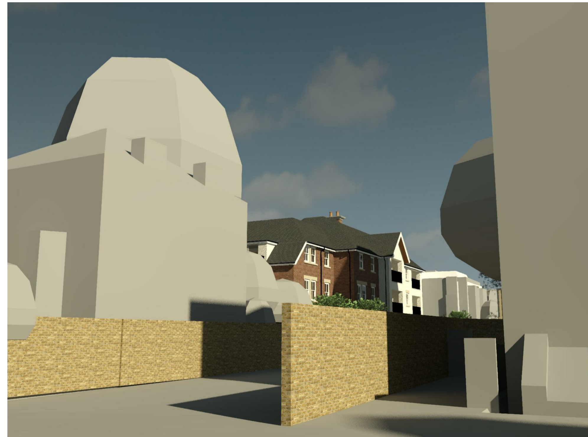
Planning Perspective 03A 1 : 1