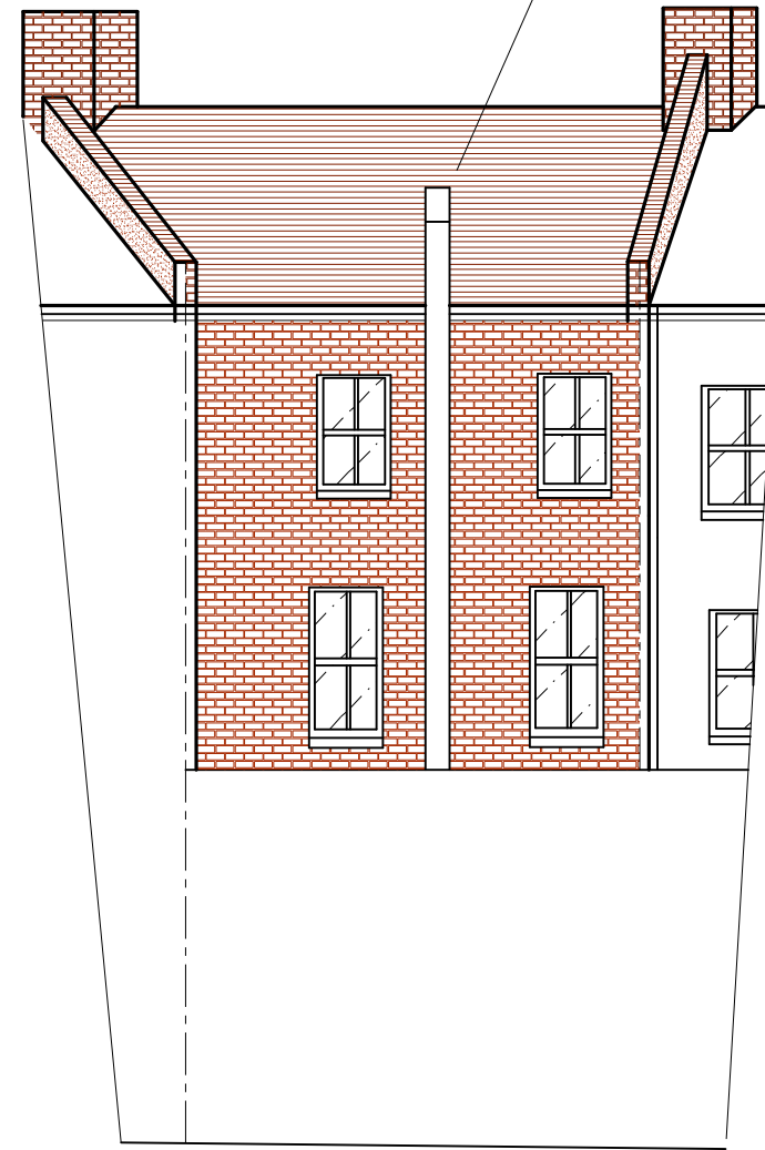
REAR ELEVATION scale 1:100