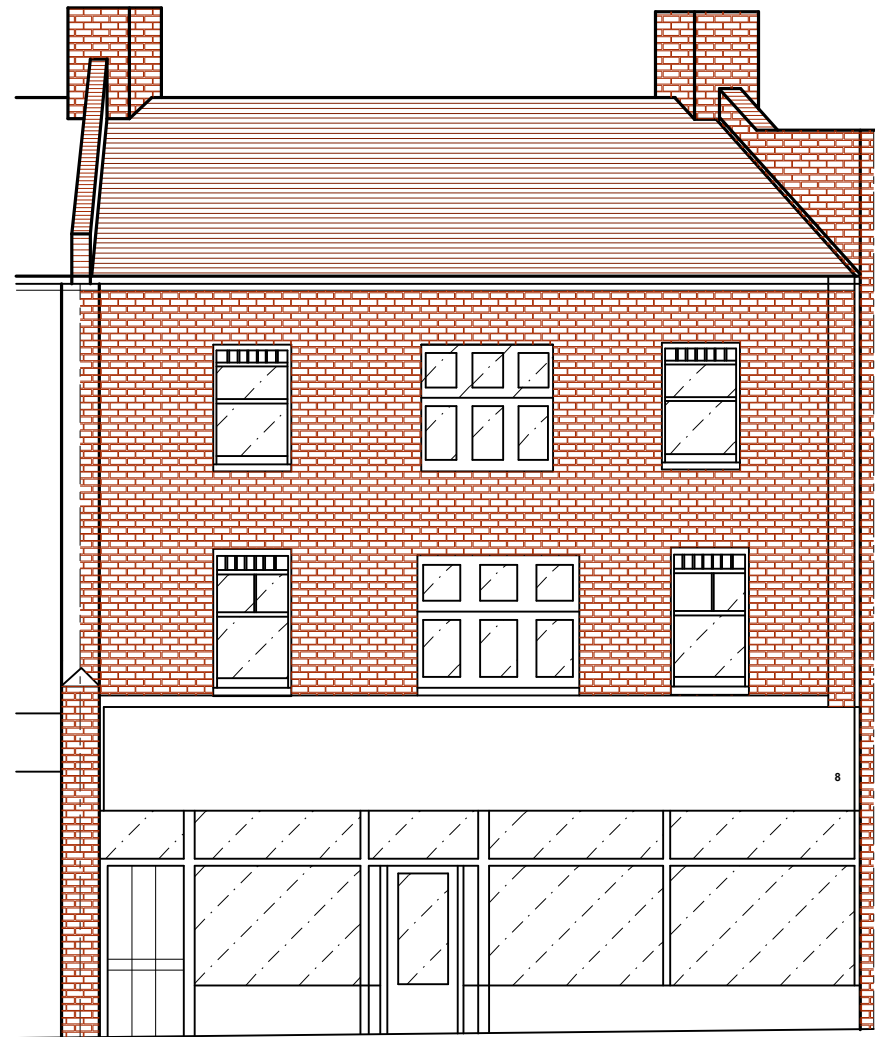
FRONT ELEVATION scale 1:100

Ventilation stack for the Kitchen of the restaurant. To be removed on change of use of ground floor subject of a separate application.