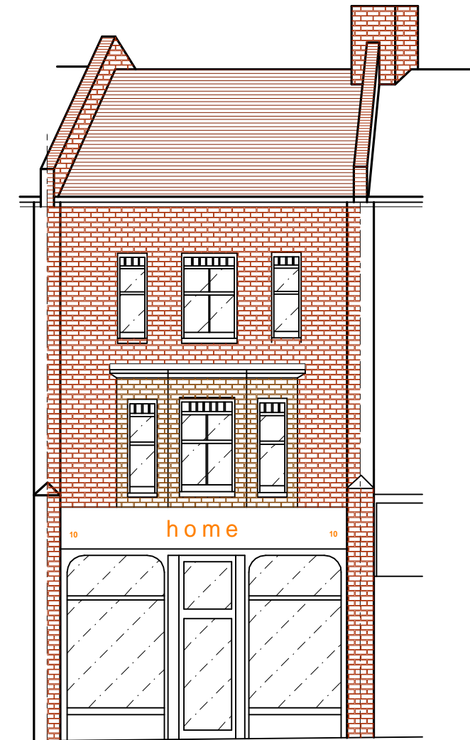
FRONT ELEVATION scale 1:100