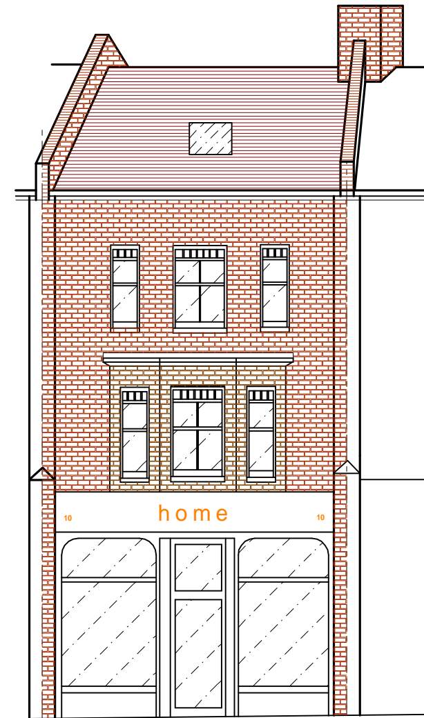
FRONT ELEVATION scale 1:100

Windows - Aluminum double glazed windows, white printed. Flat Roof - Single membrane in dark gray. Dormer face - Dark red clay tiles. Dormer cheeks - Lead.