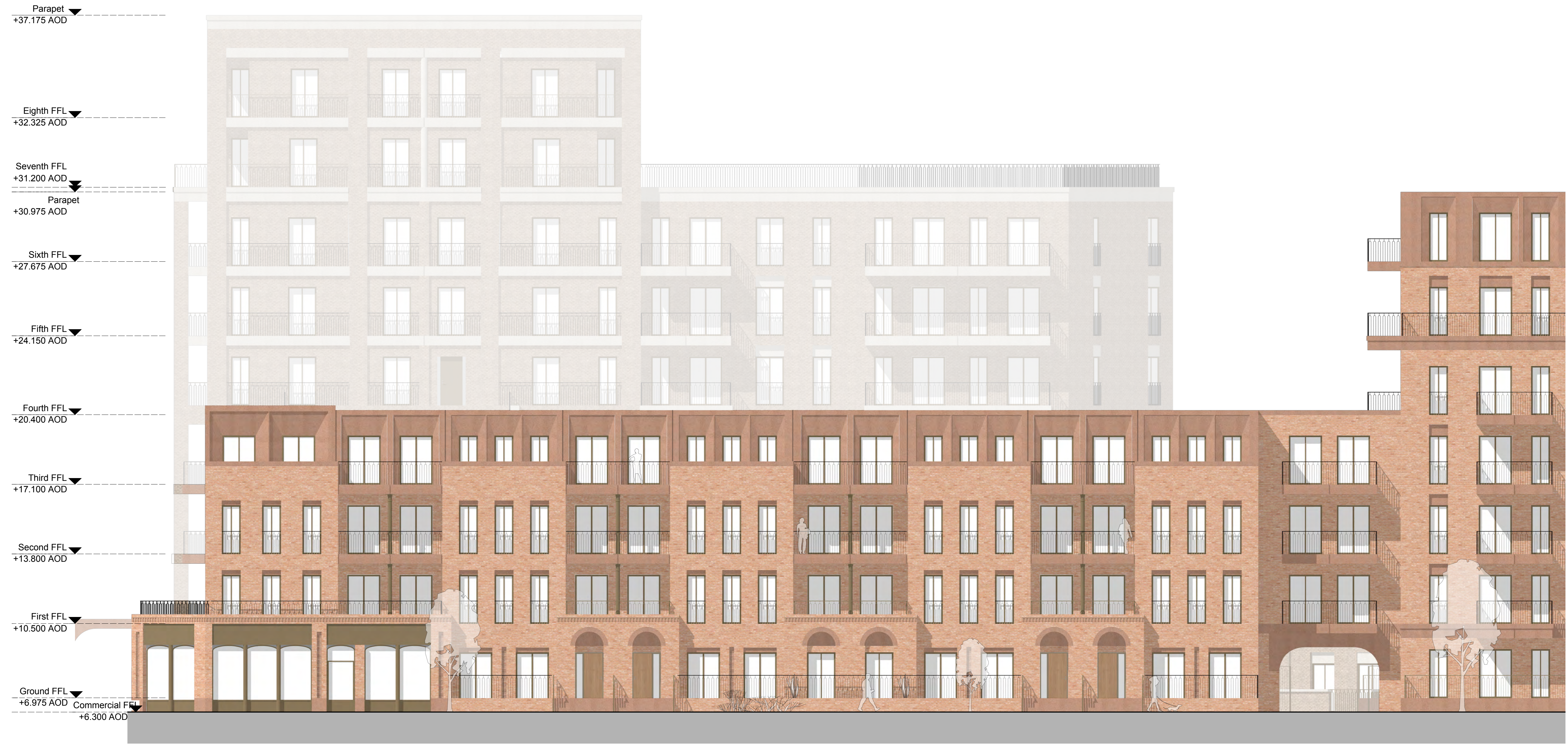
2 Block A East Elevation Scale: 1:100

Assael Architecture Limited 123 Upper Richmond Road London SW15 2TL +44 (0)20 7736 7744 info@assael.co.uk www.assael.co.uk