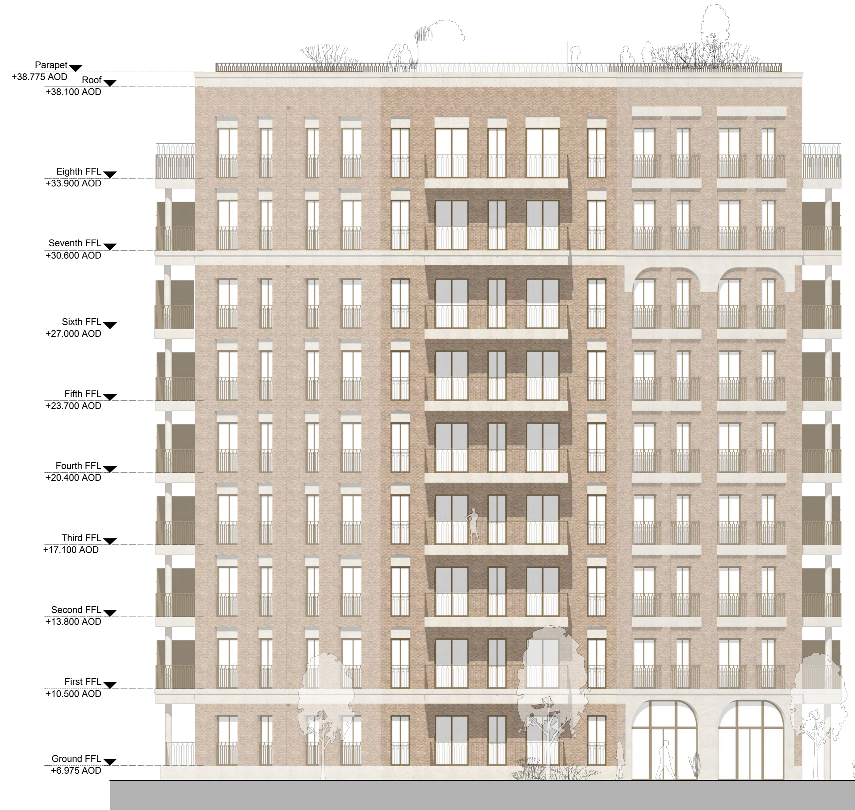
2 Block B East Elevation Scale: 1:100