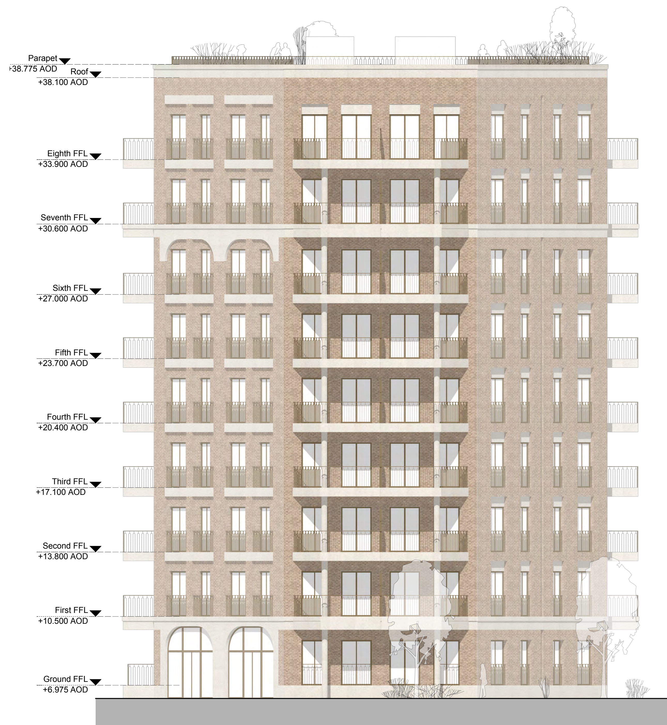
1 Block B North Elevation Scale: 1:100