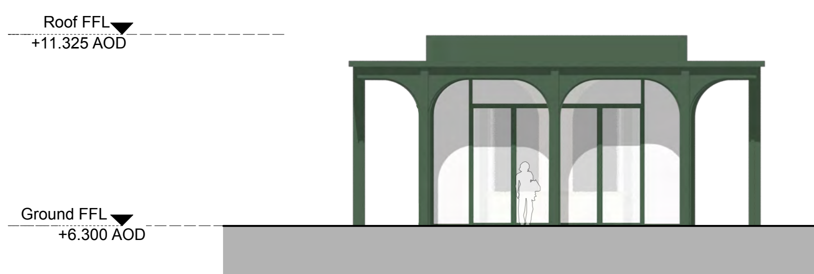
3 Pavilion North Elevation Scale: 1:100