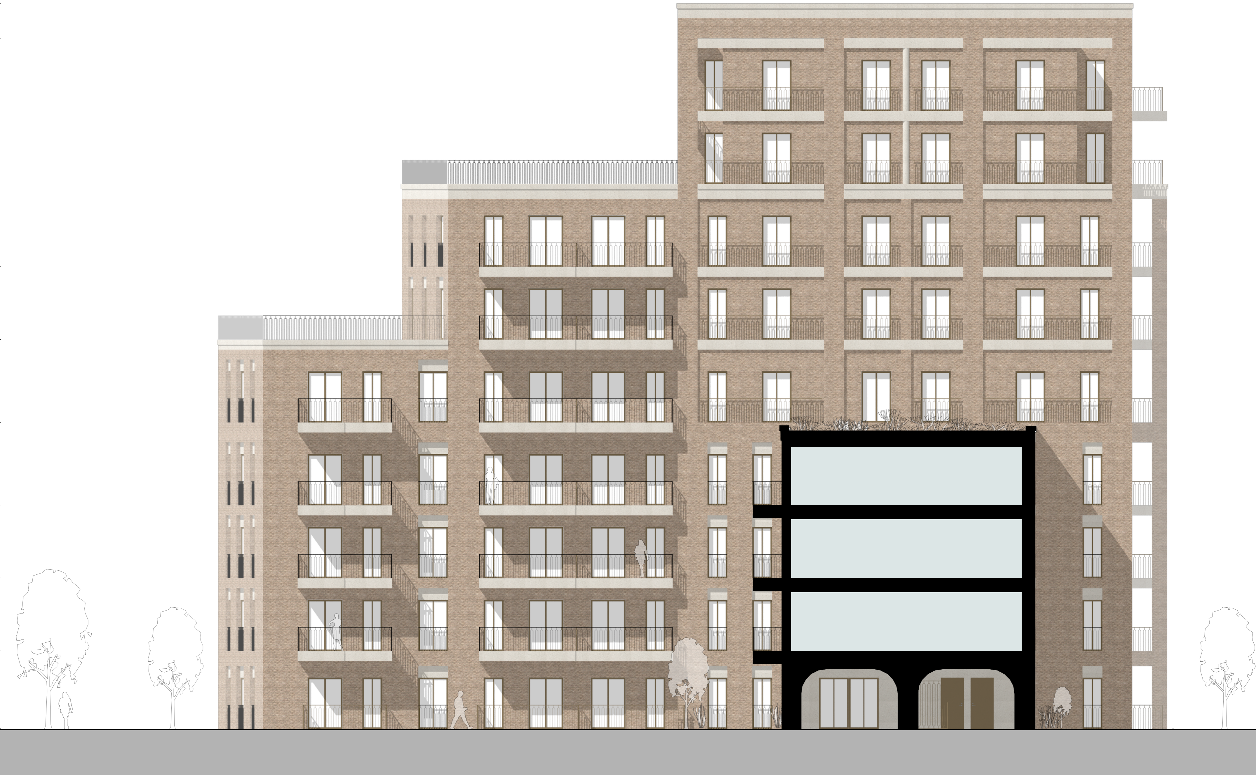
6 Block D East Internal Courtyard Elevation Scale: 1:100

Parapet +39.725 AOD Roof +38.150 AOD Eighth FFL +33.750 AOD Seventh FFL +30.750 AOD Sixth FFL +27.000 AOD Fifth FFL +23.700 AOD Fourth FFL +20.400 AOD Third FFL +17.100 AOD Second FFL +13.800 AOD First FFL +10.500 AOD Ground FFL +6.975 AOD Commercial FFL +6.300 AOD