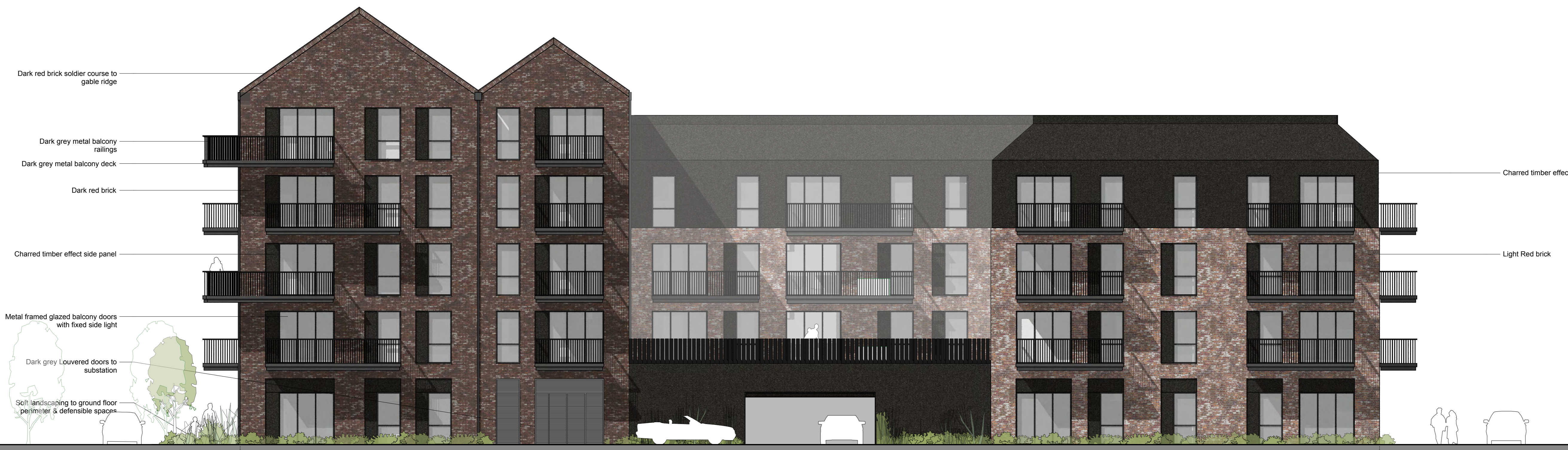
1 North Elevation Scale: 1:100