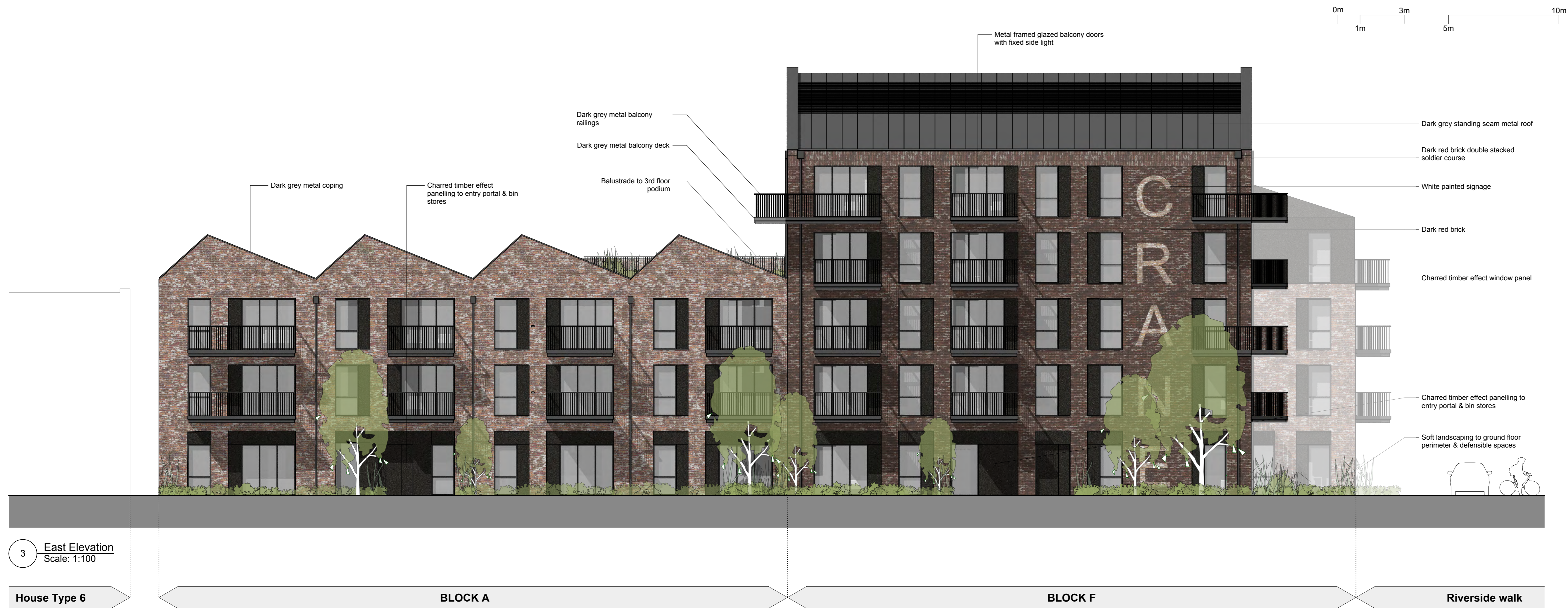
3 East Elevation Scale: 1:100