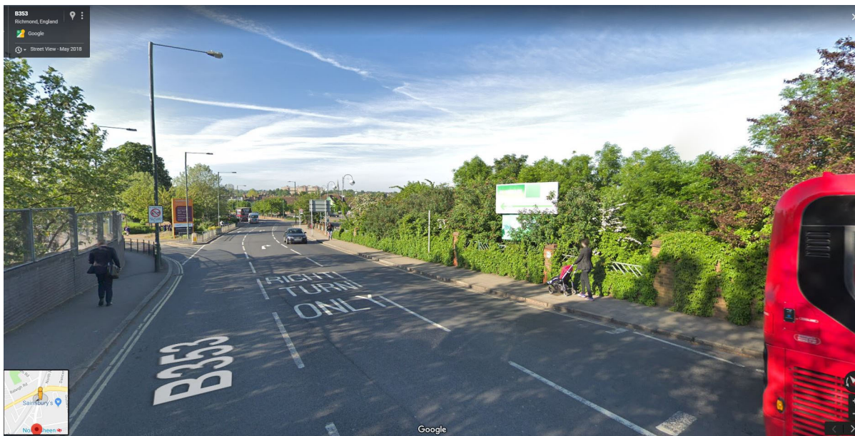
View south from north end of Manor Road

A series of semi-mature street trees are proposed down the length of the Manor Road frontage, extending the vegetation and visual impact of the existing pocket park and drawing the landscape into the proposed site development. A significant amount of landscape planting around the built forms and within the public courtyard in the centre of the site are proposed and this public open space area will add to the available public open space in the locality.