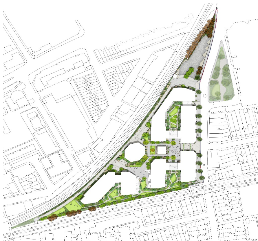
Landscape Master Plan

The Landscape Master Plan indicates the level of greenery added to the site, in comparison to the existing open carpark and limited number of poor shade trees scattered through the Homebase site. The visual impact and accessible nature of the landscape development will contribute to the local open space and townscape in a positive way and augment the contribution to the existing OOLTI area.