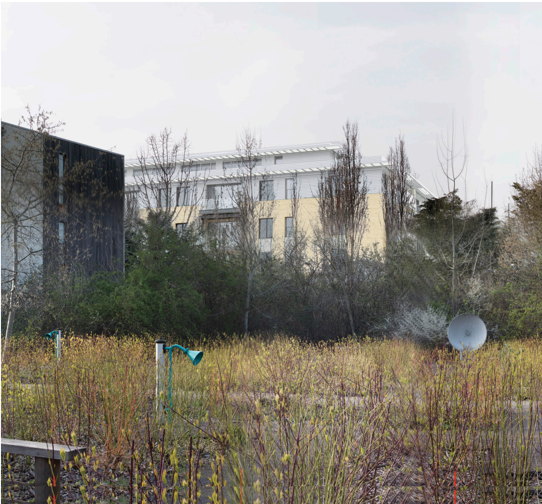
Proposed Level 3 AVR - Winter