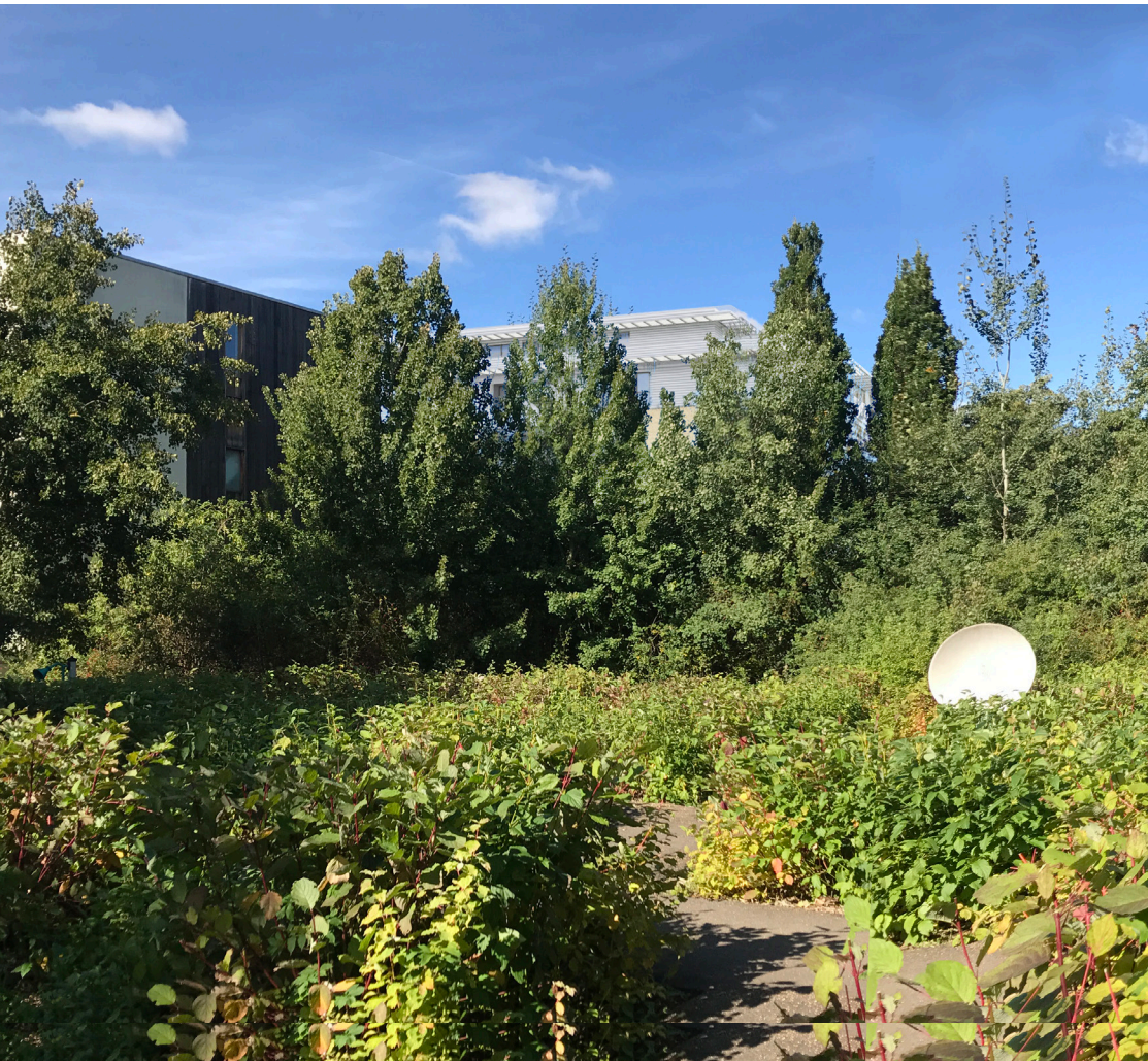
Proposed Level 3 AVR - Spring Unverified

View 4 illustrates the proposals in context when looking north-west from the public gardens to Saffron House. An underutilised public space and landscaped environment of low quality fronts a sporadic tree and shrub line, forming the southern boundary of the site. During the winter months the building is well defined, and will provide a backdrop to this pedestrian connection to the towpath. During the spring and summer months, views of the development will be significantly reduced by trees in leaf.