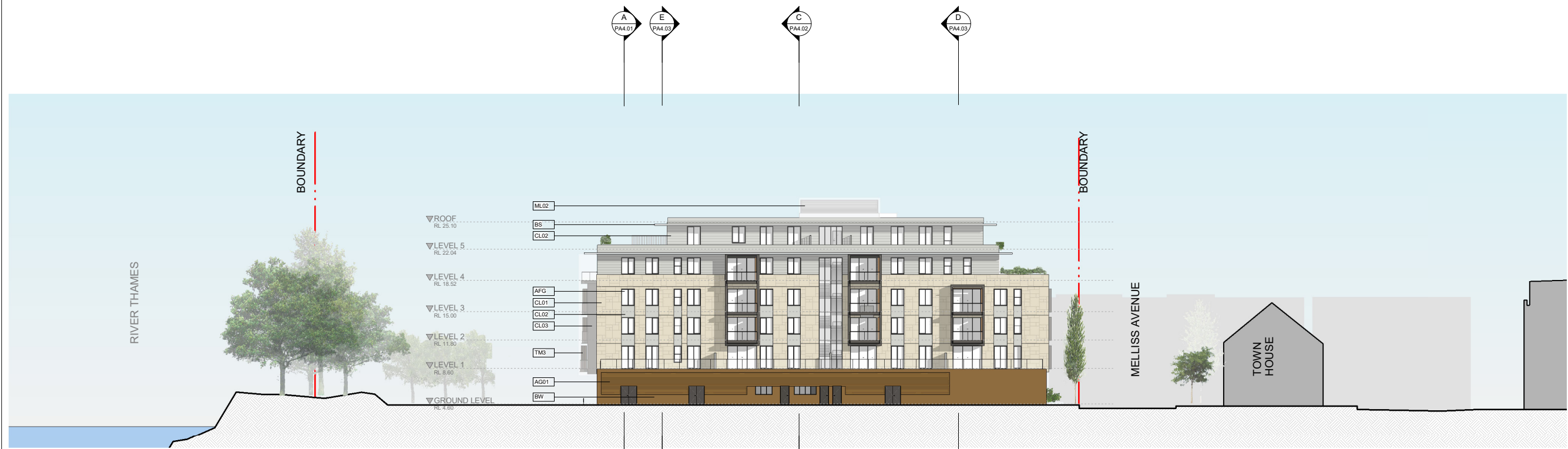
PROPOSED NORTH ELEVATION 1:250 @A1 1:500 @A3