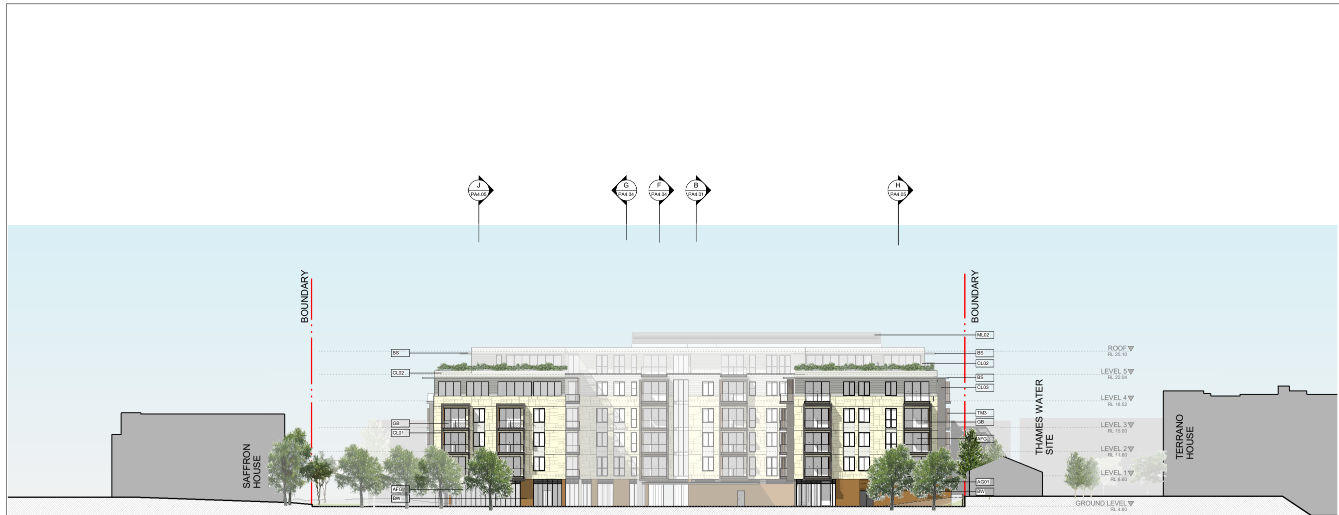
PROPOSED EAST ELEVATION 1 : 250 @A1 1 : 500 @A3