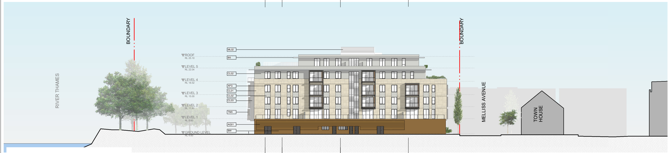
PROPOSED NORTH ELEVATION 1:250 @A1 1:500 @A3