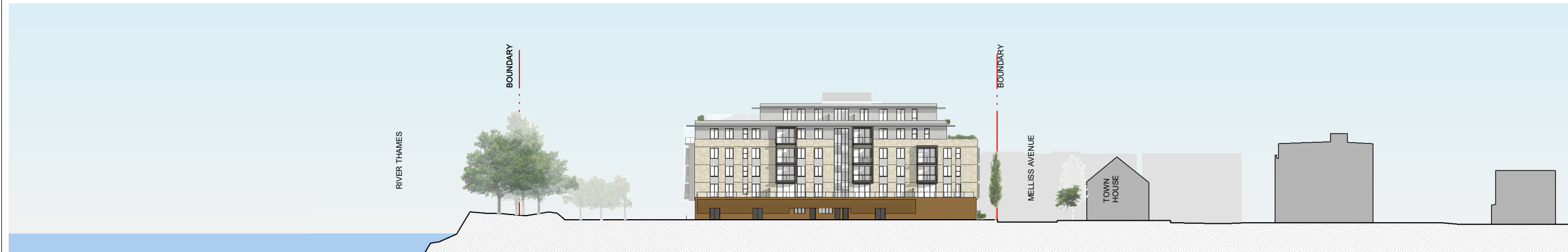
PROPOSED NORTH ELEVATION 100m 1:400 @A1 1:800 @A3