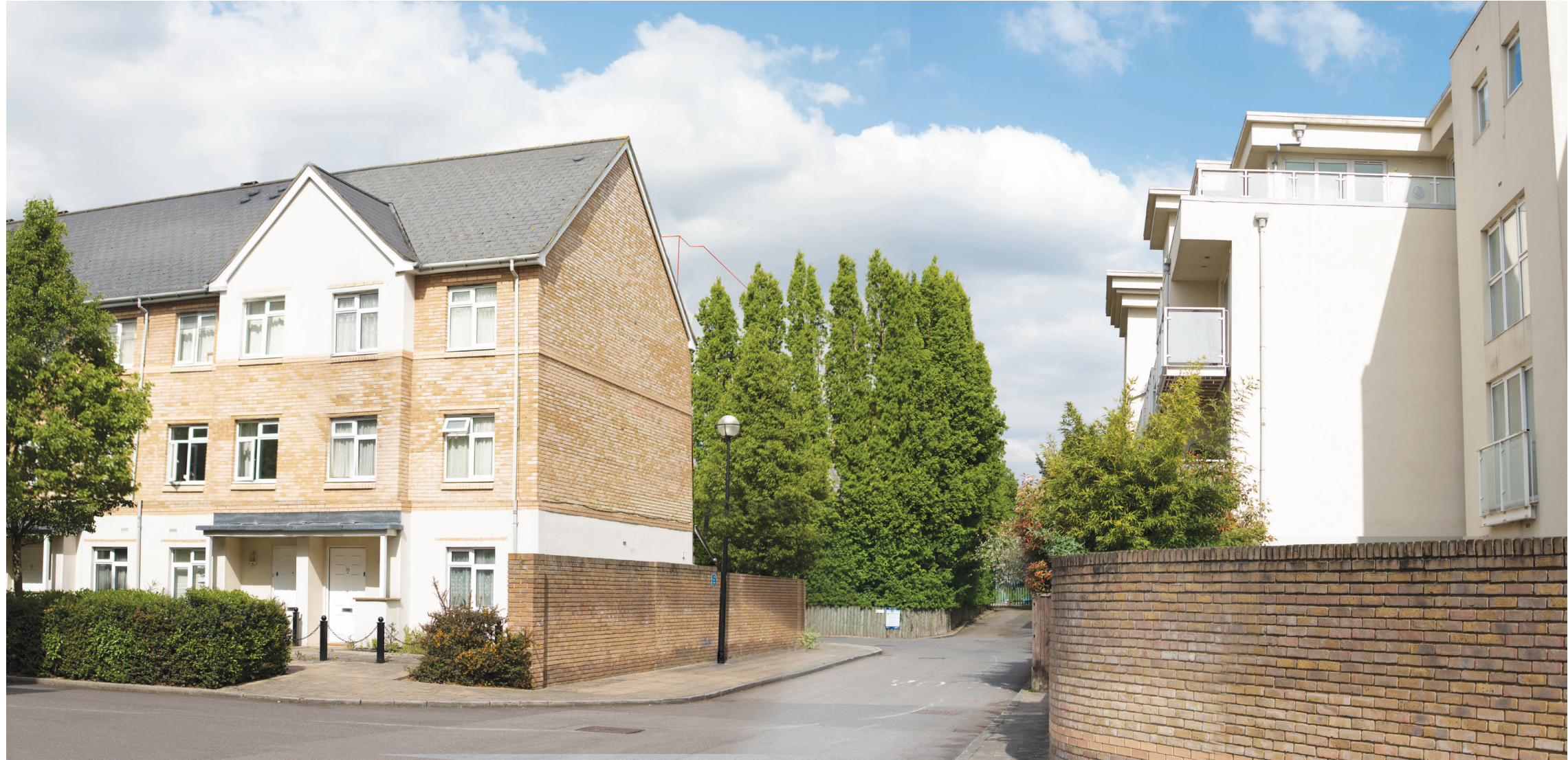
Existing Level 1 AVR - Spring

Date Taken 04.05.18 Distance 50m Level of Camera 5.6m View: From Melliss Avenue