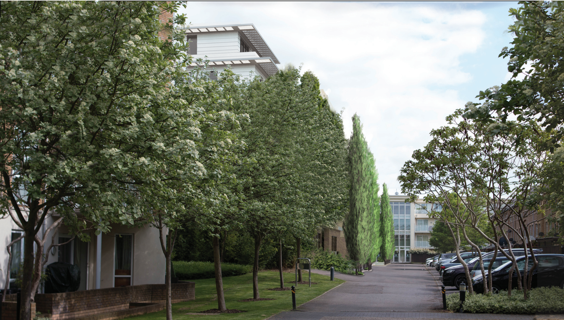
Proposed Level 3 AVR - Spring

With the removal of the existing trees along Melliss Avenue, the main vista along is opened up, providing a clear view to the entrance of Saffron House beyond, and a much increased sense of openness and space to the rear of the Town-houses, and much improved quality to this residential street.