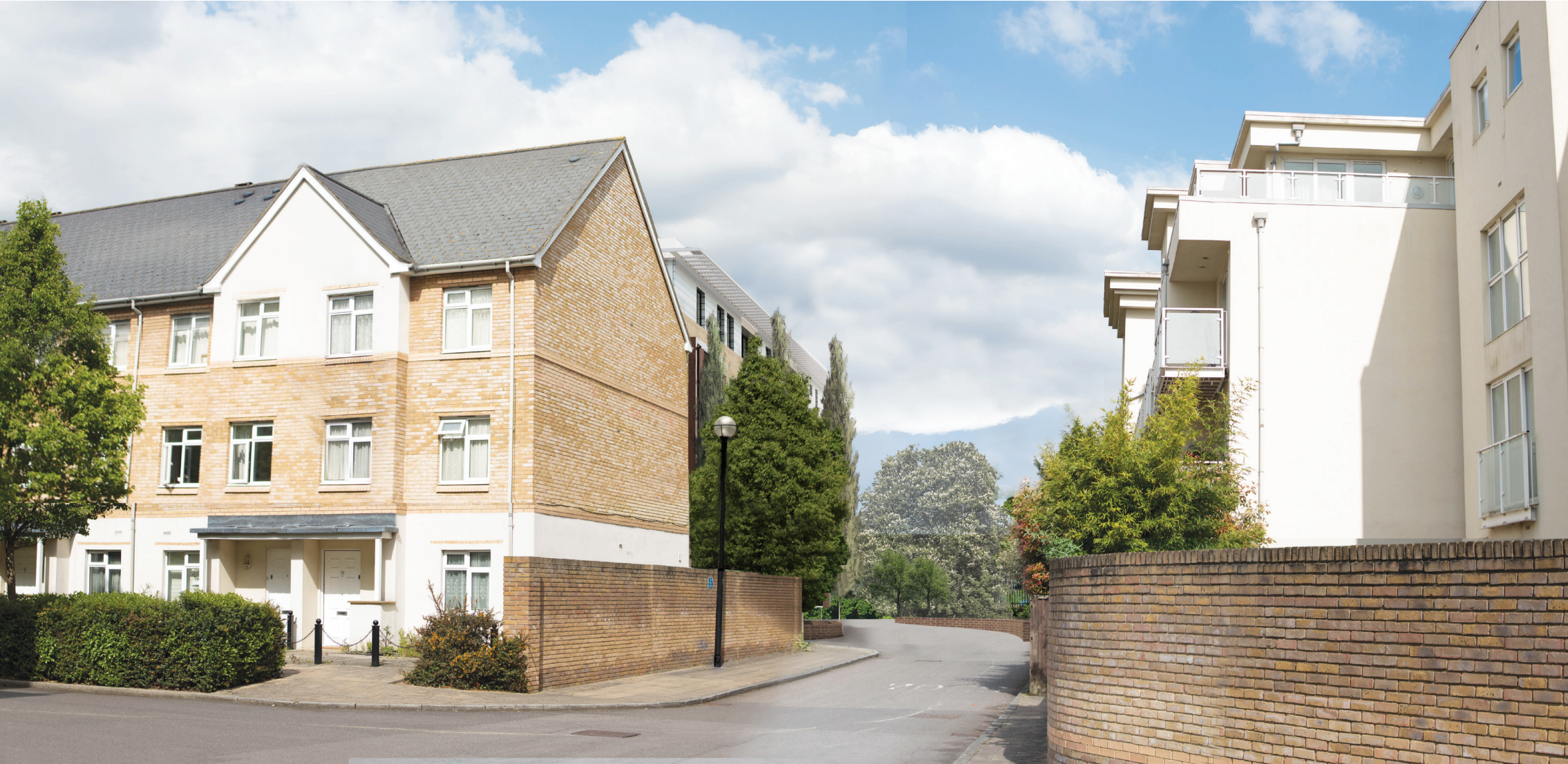
Proposed Level 3 AVR - Spring

As one approaches the site from the main access road to the south, the building can be seen behind the town-houses to Melliss Avenue. With the car park to the south, the 20m setback from Saffron house can be clearly seen (providing daylight and sunlight benefits to these properties) and the towpath tree line in the background is now also visible.