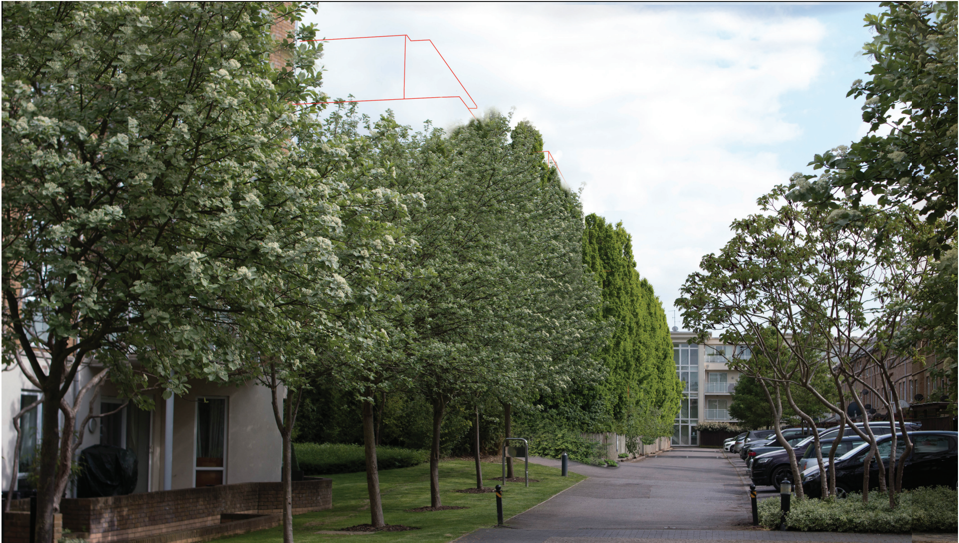
Existing Level 1 AVR - Spring

Date Taken 04.05.18 Distance 100m Level of Camera 5.6m View: From residential street to the north-west of the site