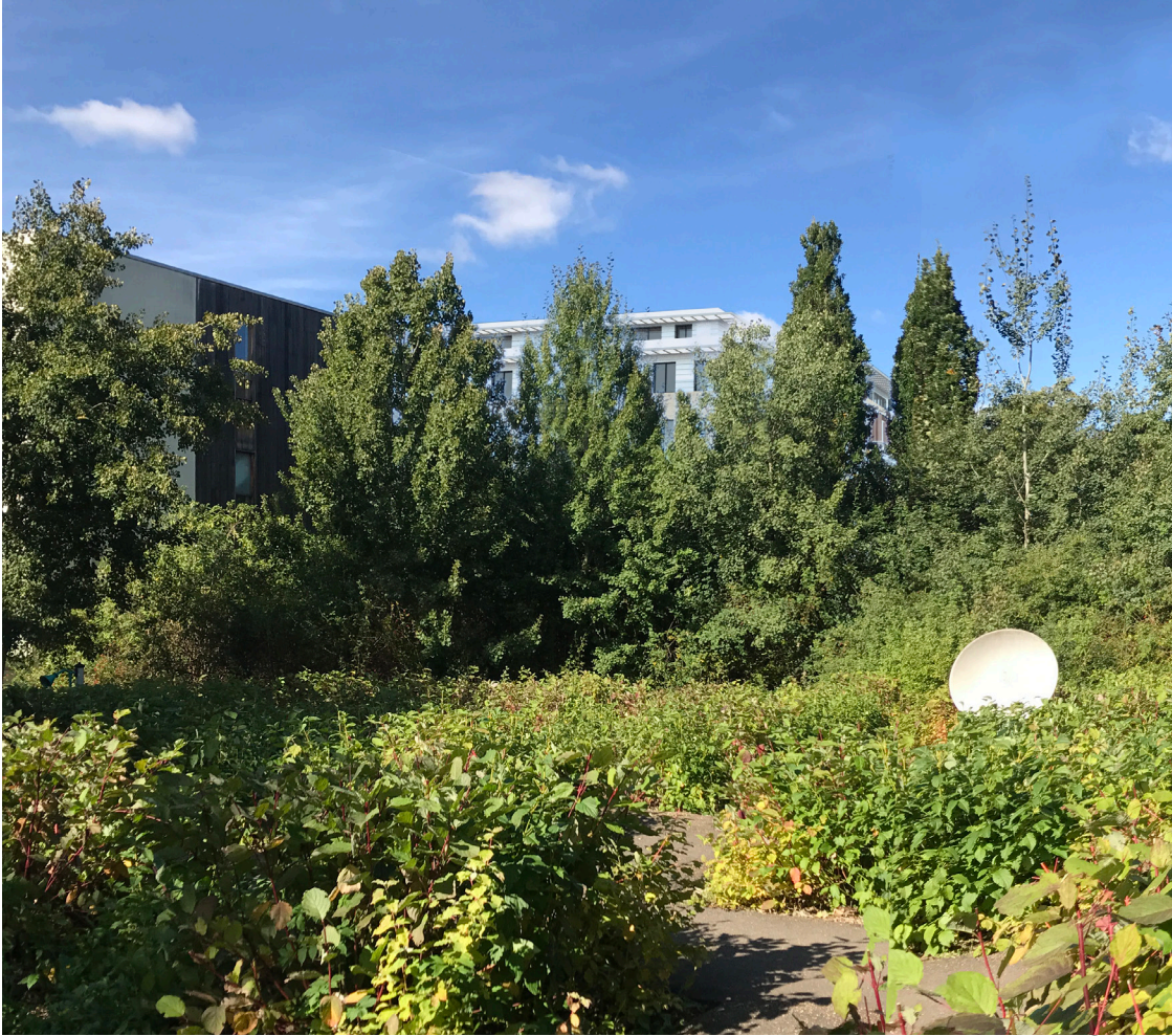
Proposed Level 3 AVR - Spring Unverified

View 4 illustrates the proposals in context when looking north-west from the public gardens to Saffron House. An underutilised public space and landscaped environment of low quality fronts a sporadic tree and shrub line, forming the southern boundary of the site. During the winter months the building is well defined, and will provide a backdrop to this pedestrian connection to the towpath. During the spring and summer months, views of the development will be significantly reduced by trees in leaf.