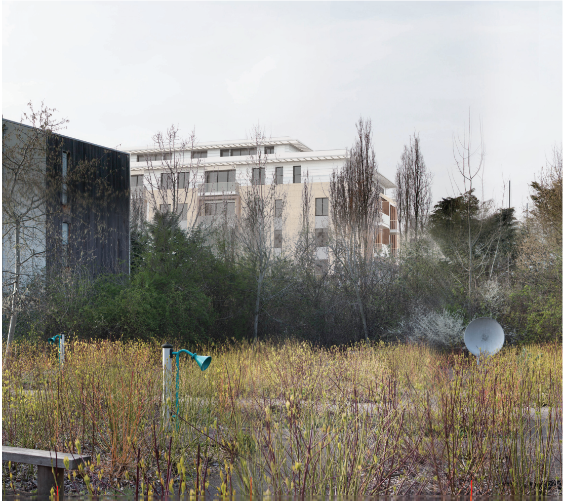
Proposed Level 3 AVR - Winter