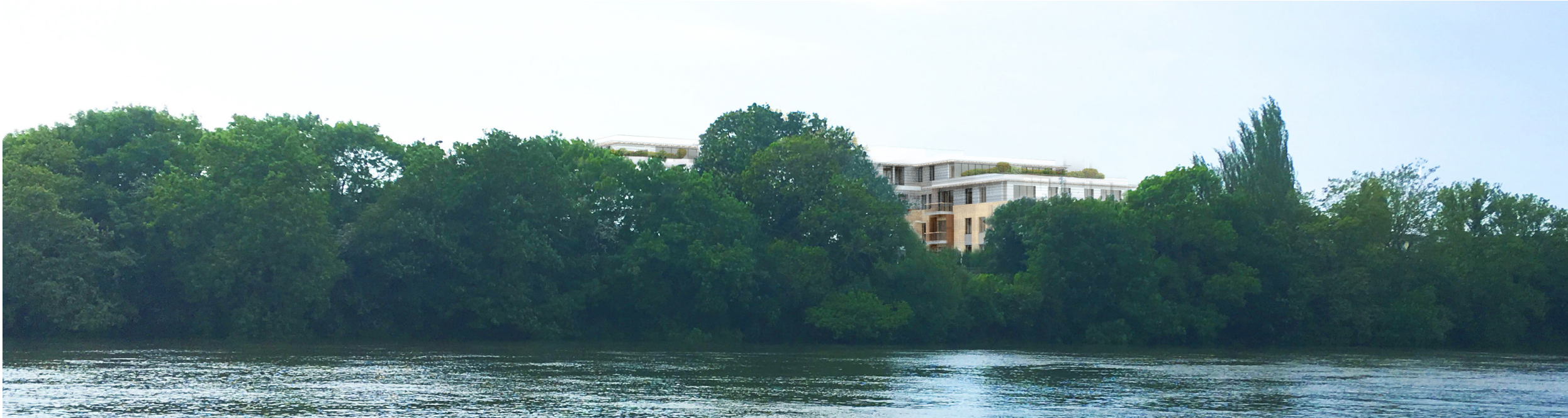
Proposed Level 3 AVR - Spring - Unverified