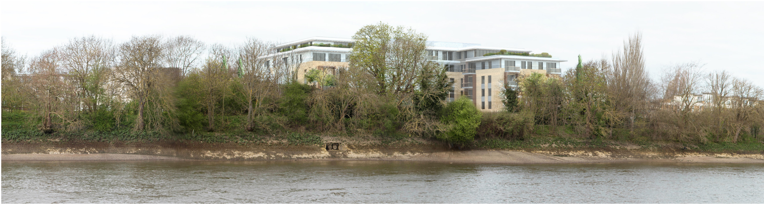
Proposed Level 3 AVR - Winter