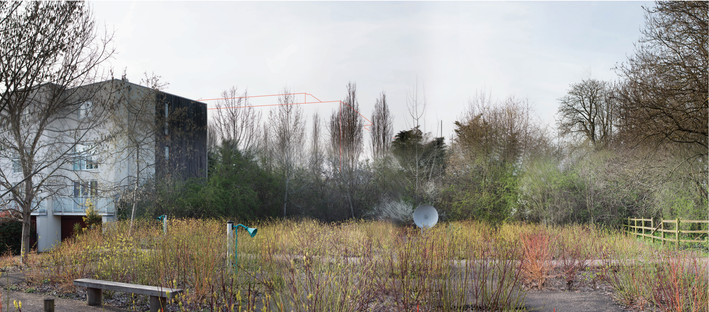
Existing Level 1 AVR - Winter

Date Taken 26.03.18 Distance 80m Level of Camera 6.6m View: From public gardens to the south of the site