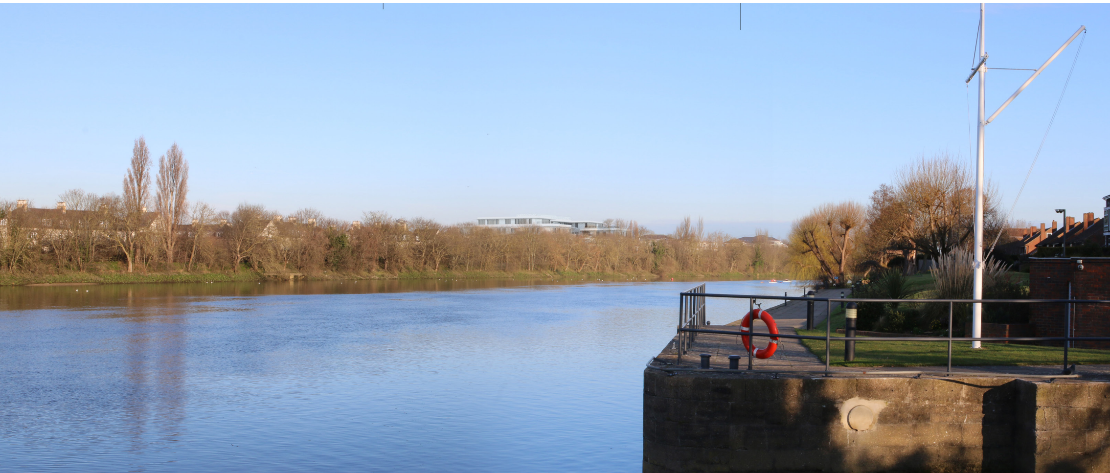
Existing Level 3 AVR - Winter

During the winter months, when the tree line along the towpath is without leaf, the development can be seen peeking over the tops of the tree line. It is expected that during the months when trees are in leaf, the extent of the proposed development visible above the tree line will be very much limited.