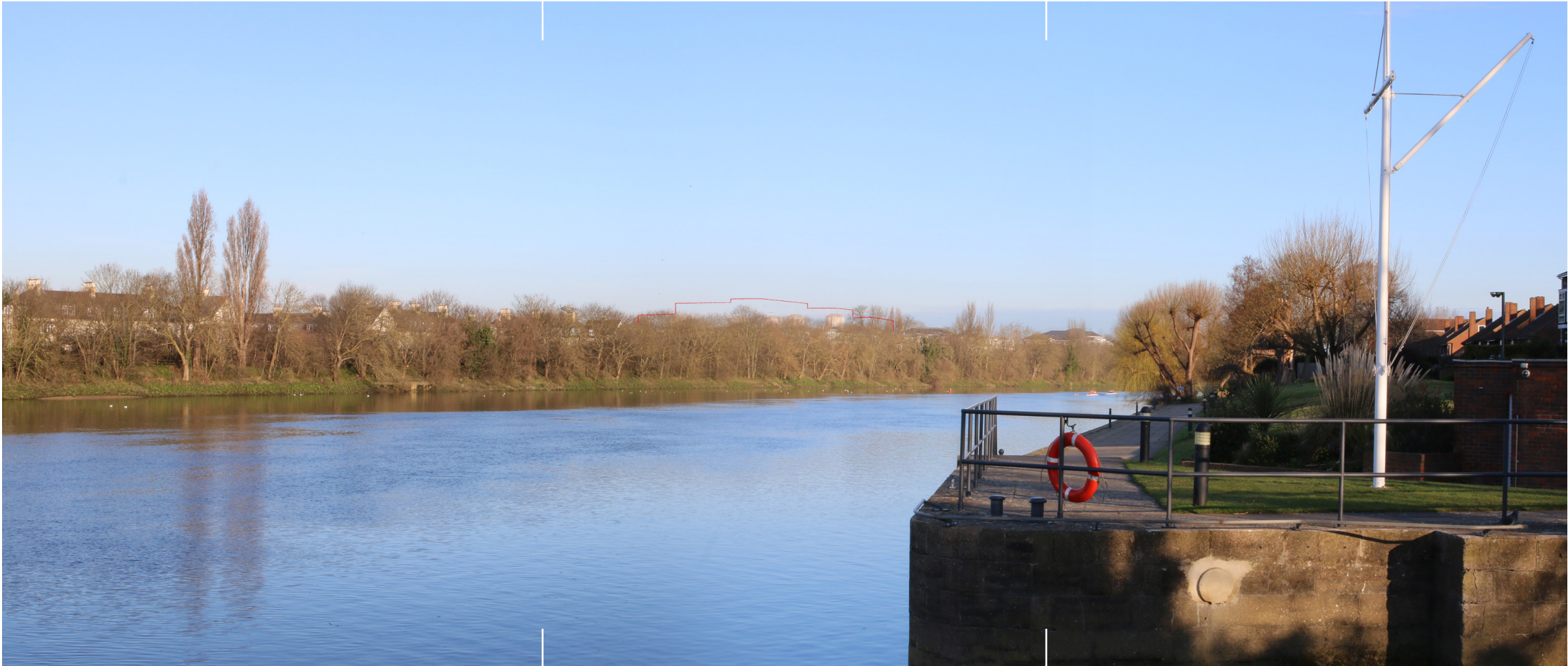
Existing Level 1 AVR - Winter

View 6 illustrates the proposals in context when looking north from the east bank of the river. This view is taken from the entry to Chiswick Quay.