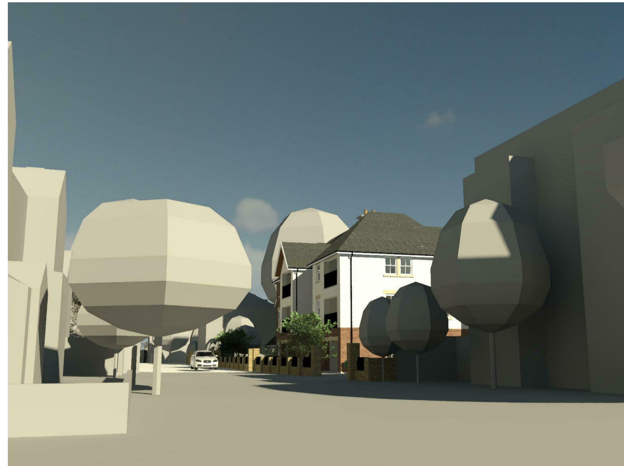
Planning Perspective 02B 1 : 1