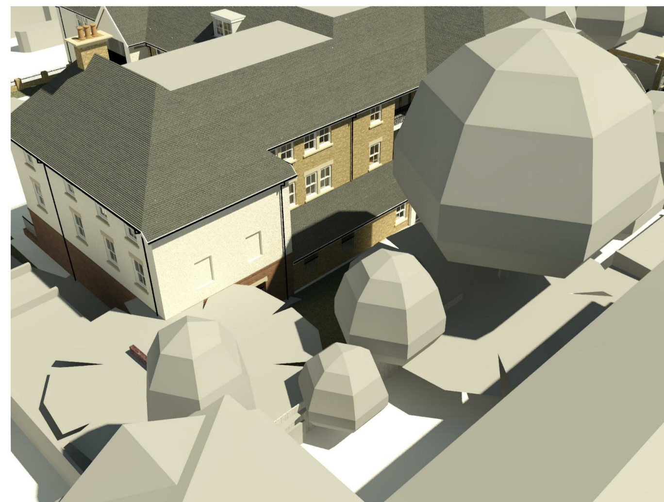
Planning Perspective 06 1 : 1

Figured dimensions only are to be used. All dimensions to be checked onsite. Differences between drawings and between drawings and specification or bills of quantities to be reported to the PRC Group.