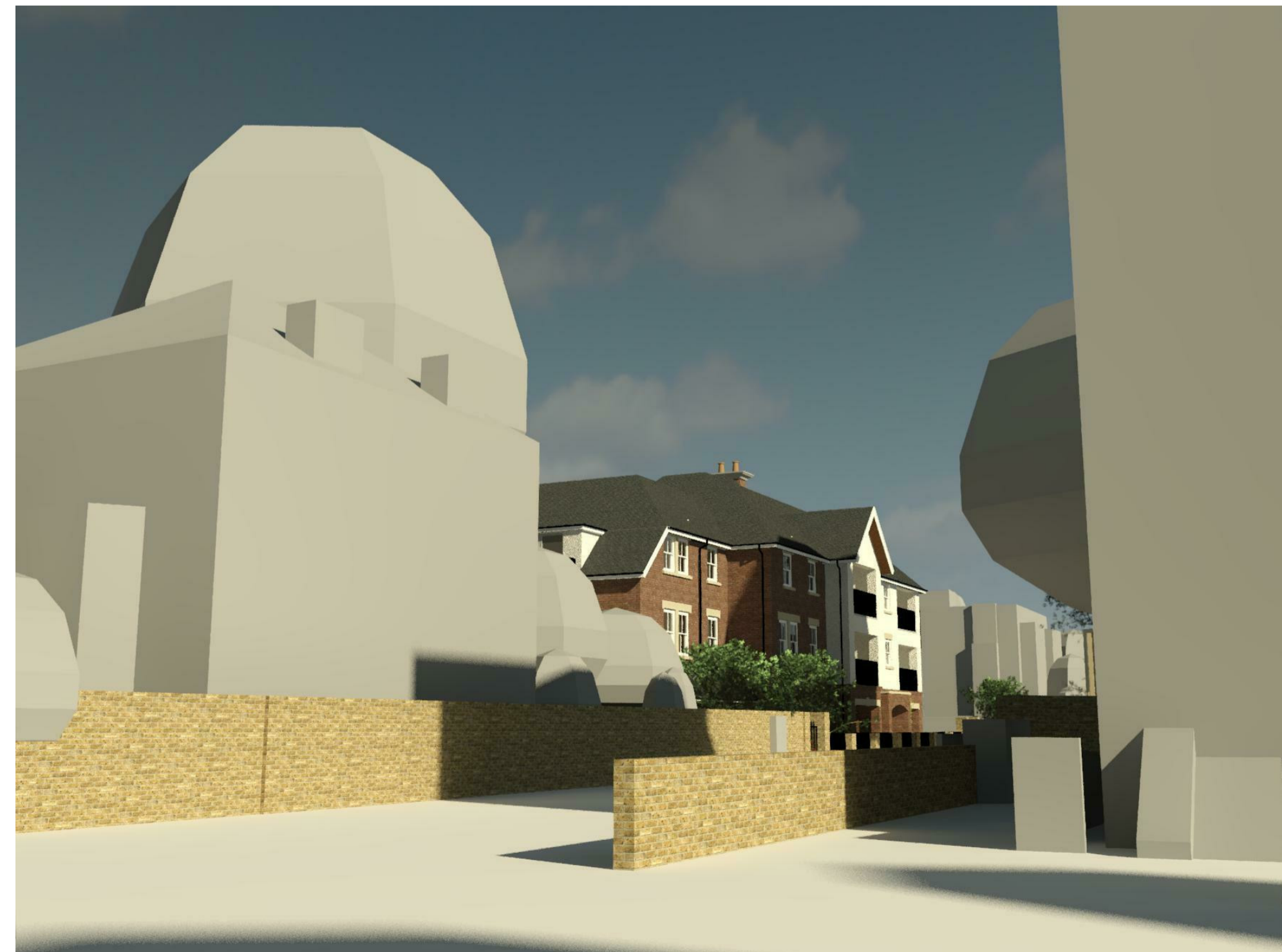
Planning Perspective 03B 1 : 1