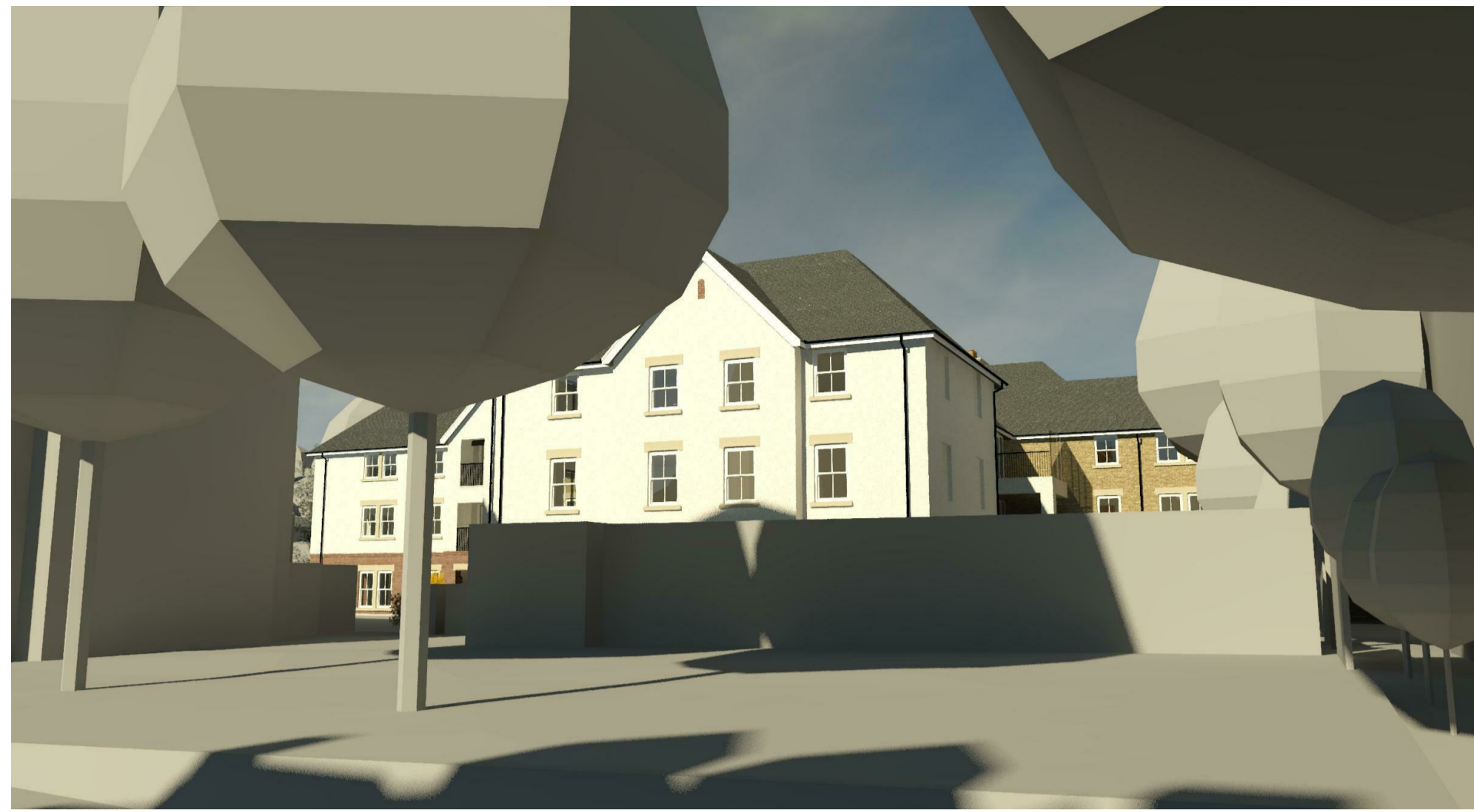
Planning Perspective 01A 1 : 1