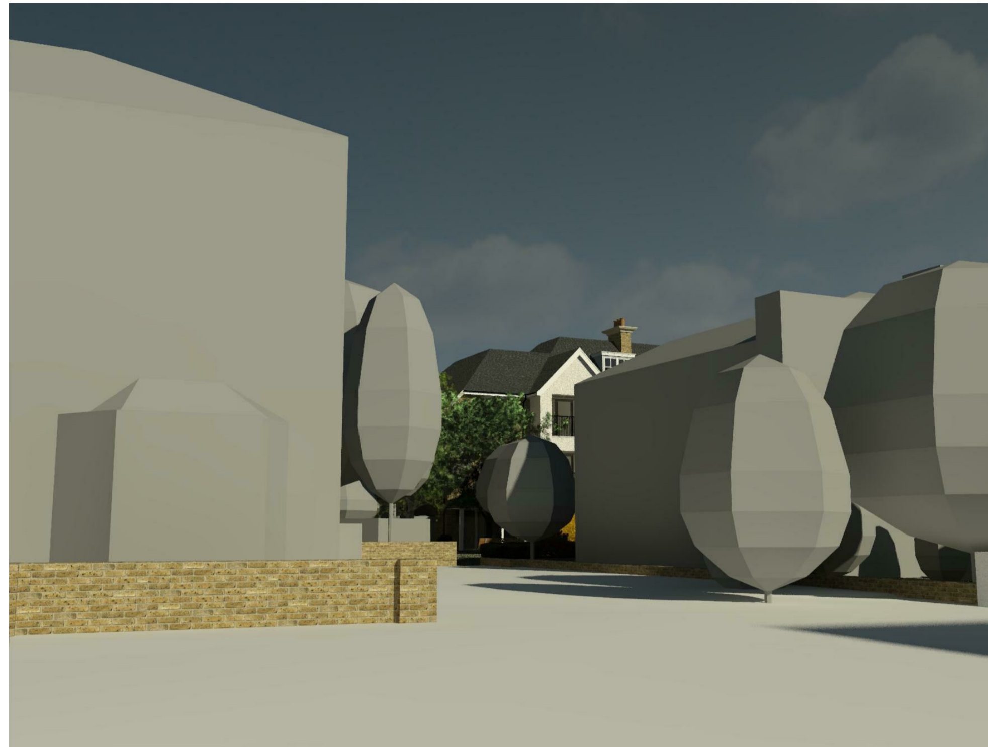
Planning Perspective 04A 1 : 1