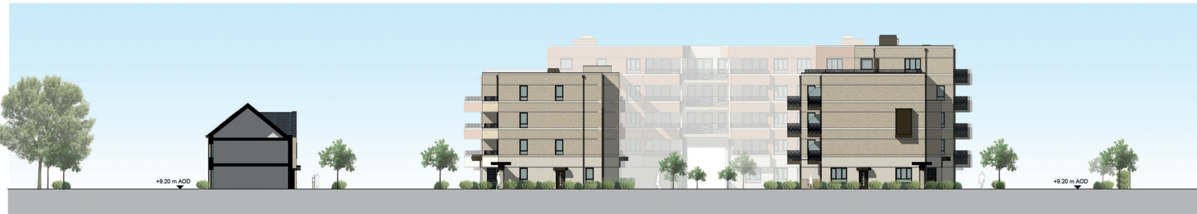
Section M 1 : 250