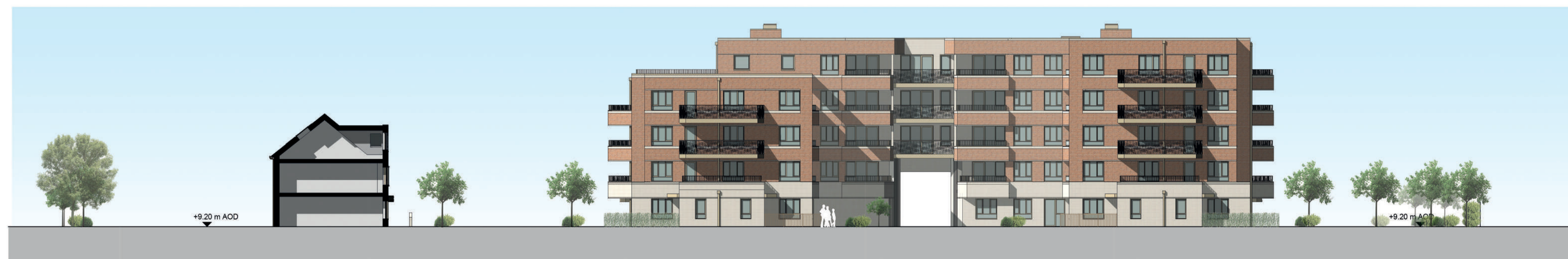
Section N 1 : 250