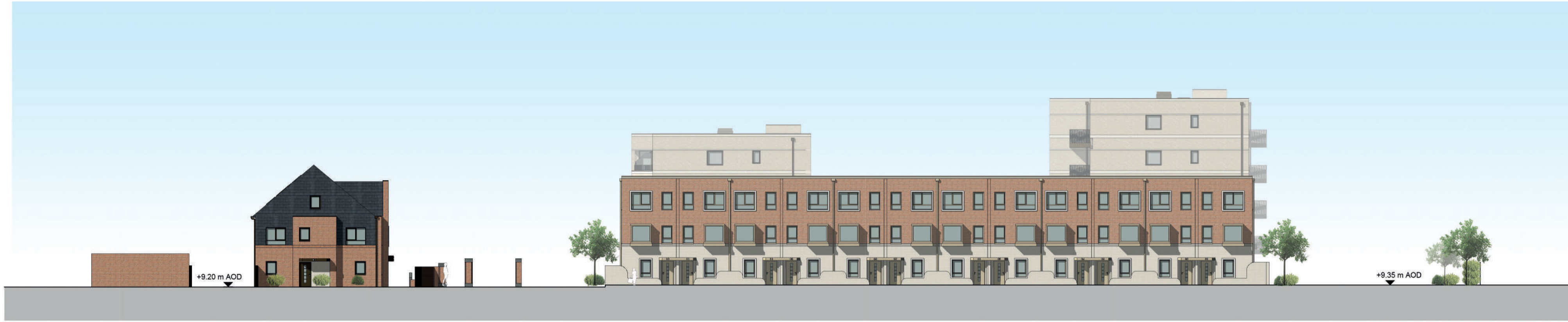
Section K 1 : 250