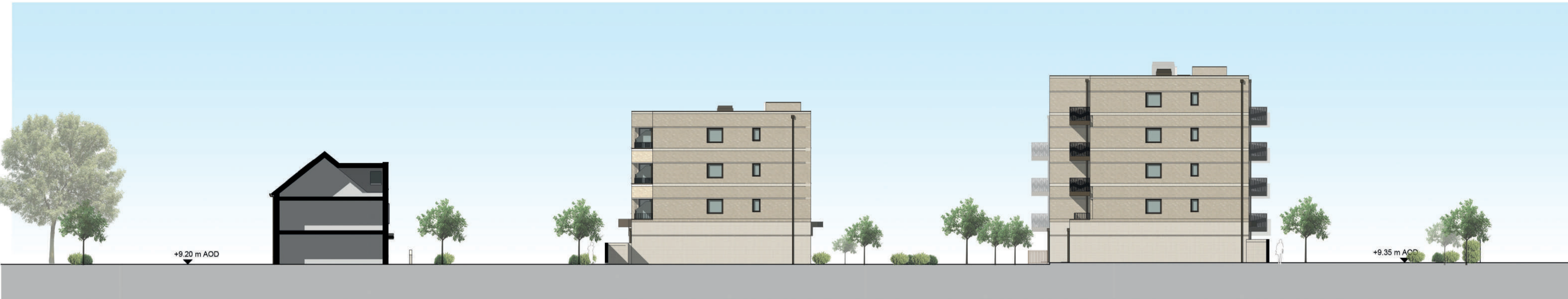
Section L 1 : 250