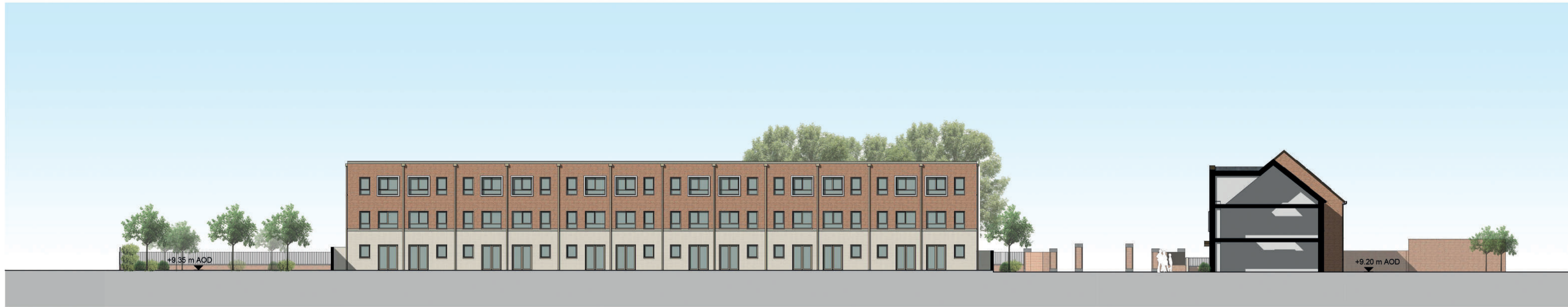
Section J 1 : 250