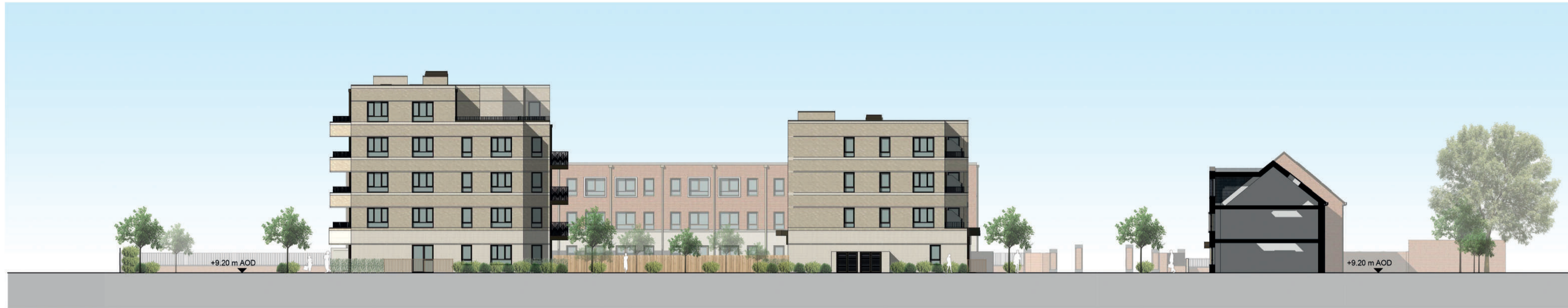
Section H 1 : 250