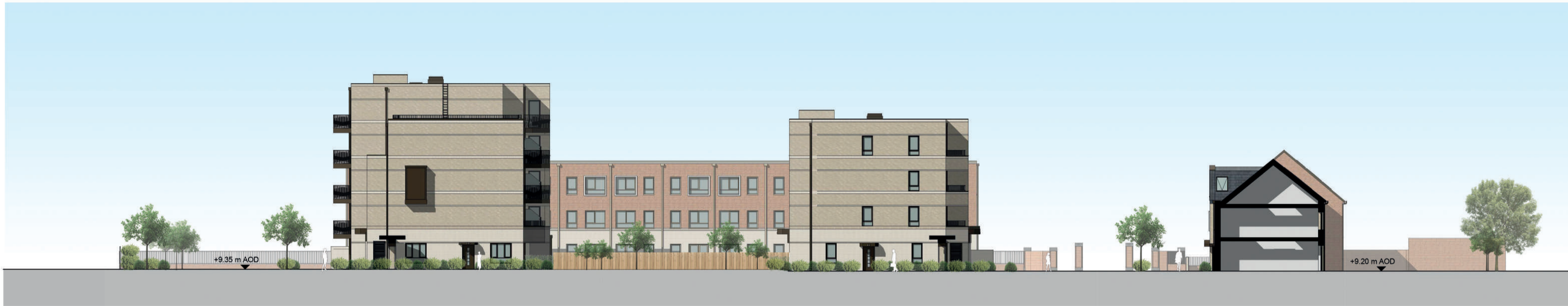
Section I 1 : 250