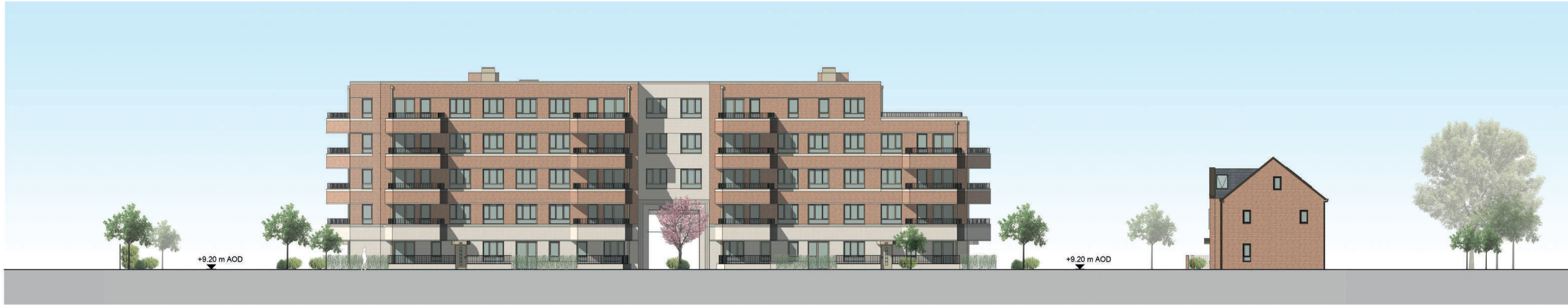
Section G 1 : 250