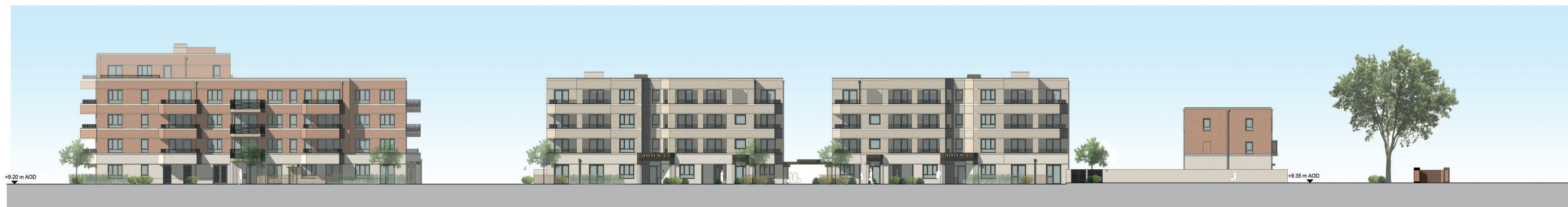
Section E 1 : 250