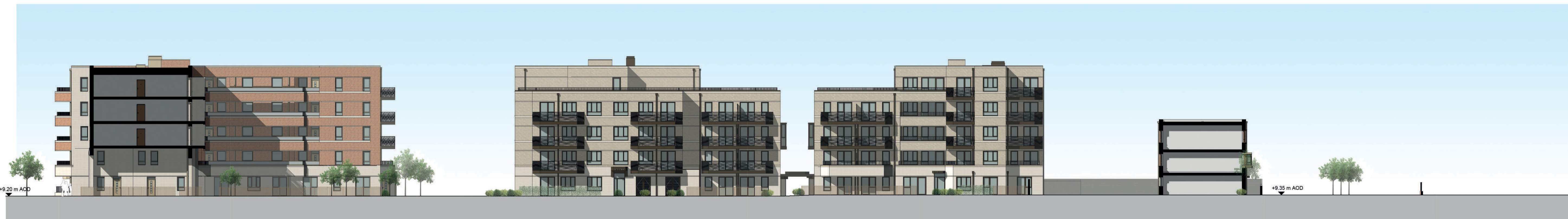
Section F 1 : 250