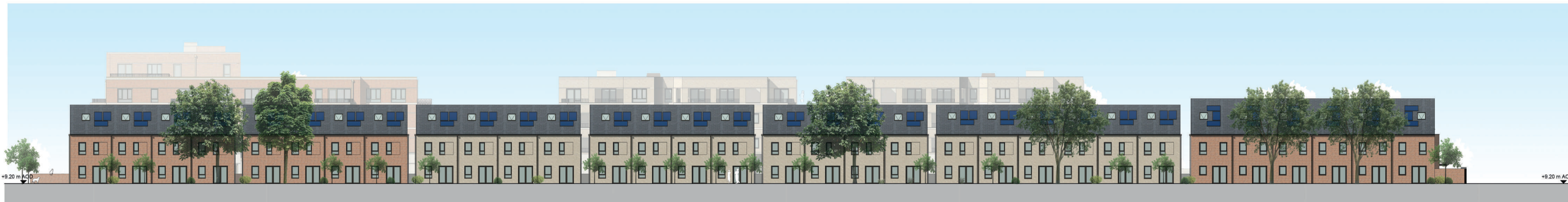
Section D 1 : 250